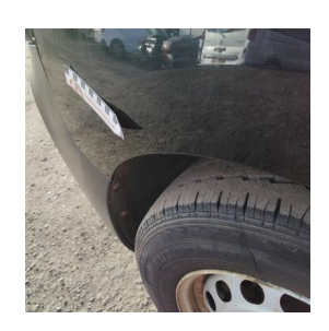
10mm + 30mm Smart