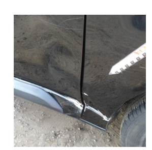
Door nsr Dented With Paint Damage Repair and Refinish