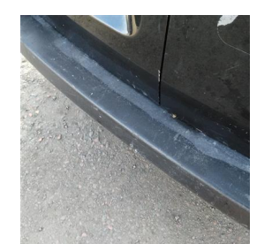
Bumper Rear Moulding