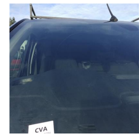
Front Cracked Needs Replaced Replace