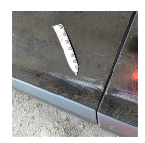
Door nsf Scratched Over 25mm Thru Paint Refinish