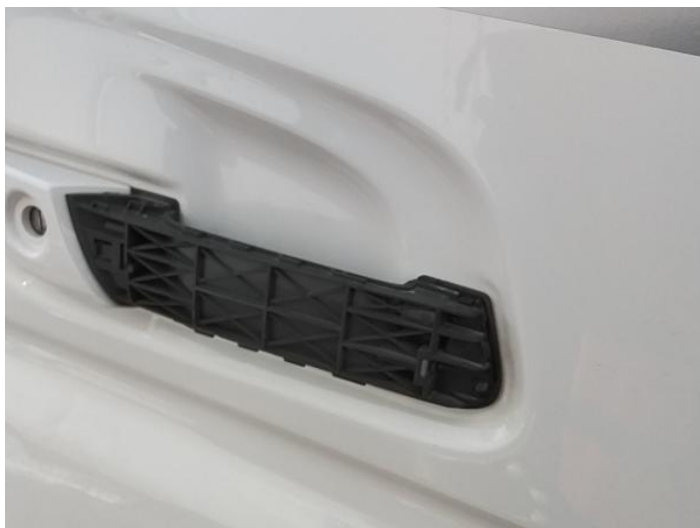
1: Handle Outer nsf Broken Replace