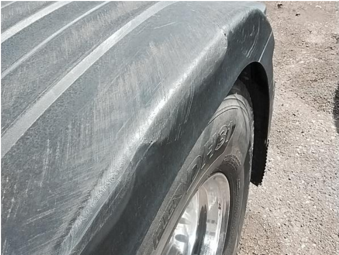
3: Qtr Panel osr Scratched Over 25mm Not Thru Paint