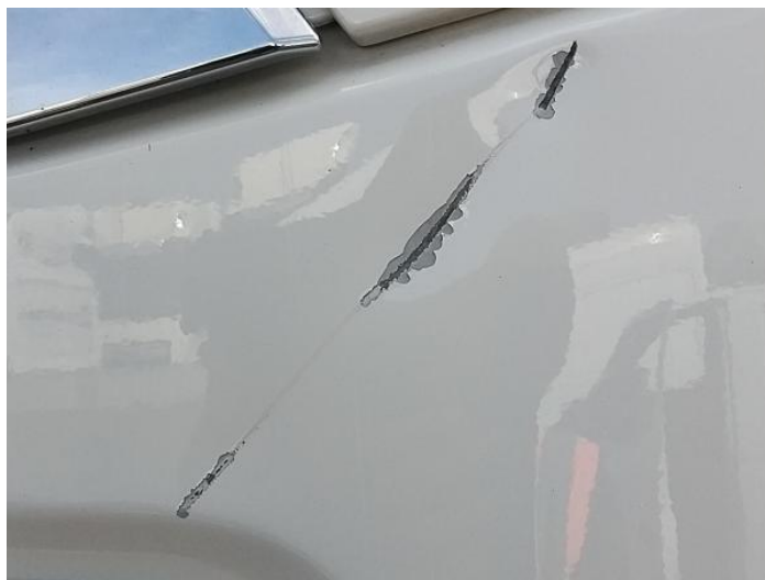
2: Panel Front Dented With Paint Damage