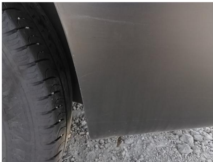
2: Bumper Rear Scratched Over 25mm Not Thru Paint