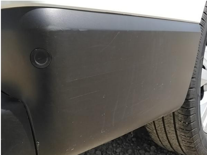
4: Bumper Rear Moulding Scuffed (Unpainted) Over 100mm