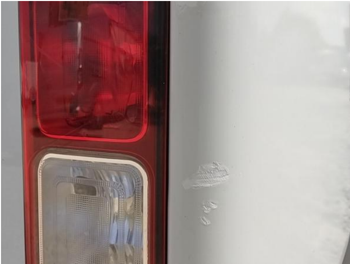
3: Qtr Panel osr Scratched Over 25mm Thru Paint