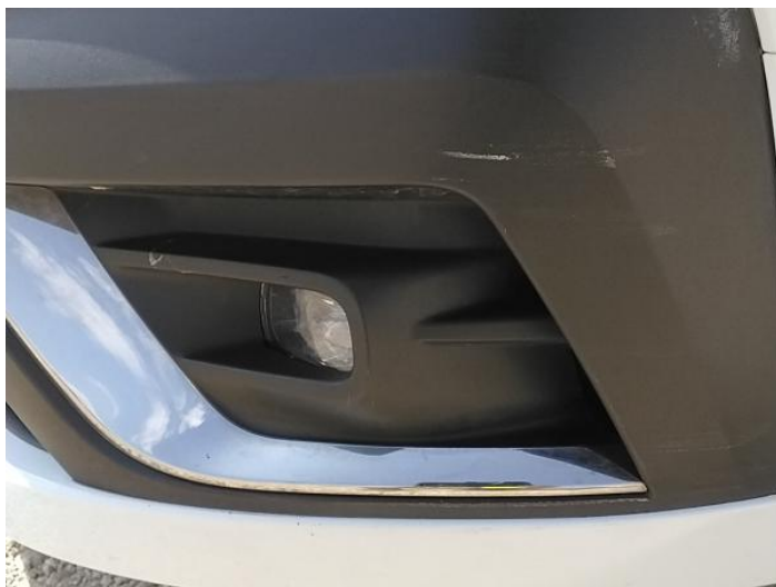
1: Bumper Front Moulding Scuffed (Unpainted) UpTo 100mm