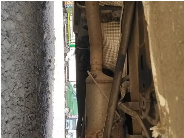
6: Sill os Dented Over 30mm