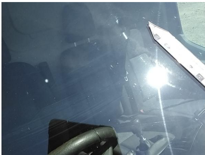
1: Screen Front Chipped UpTo 10mm