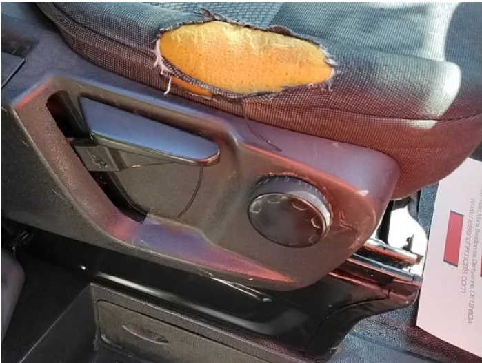
5: Seat Back Cover osf Torn Over 3mm