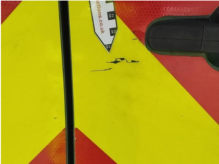
4: Panel Rear Scratched UpTo 25mm Thru Paint