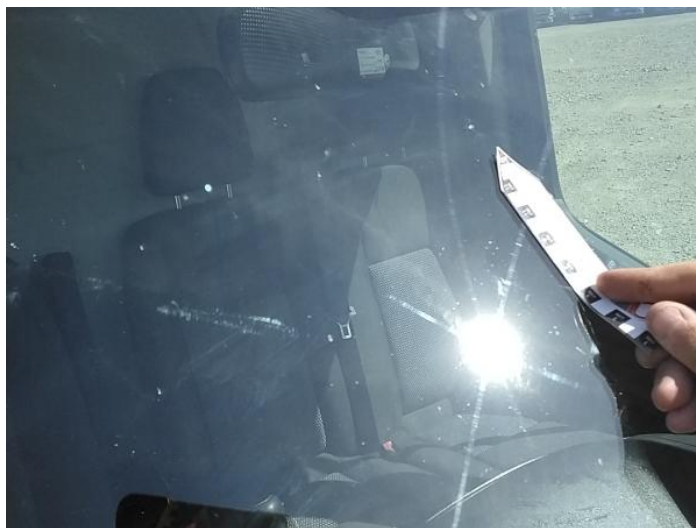
2: Screen Front Chipped UpTo 10mm