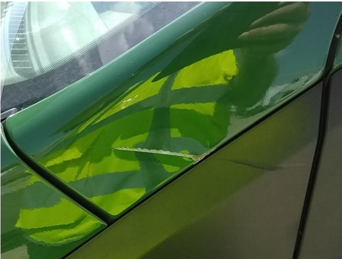
5: A Post ns Dented With Paint Damage