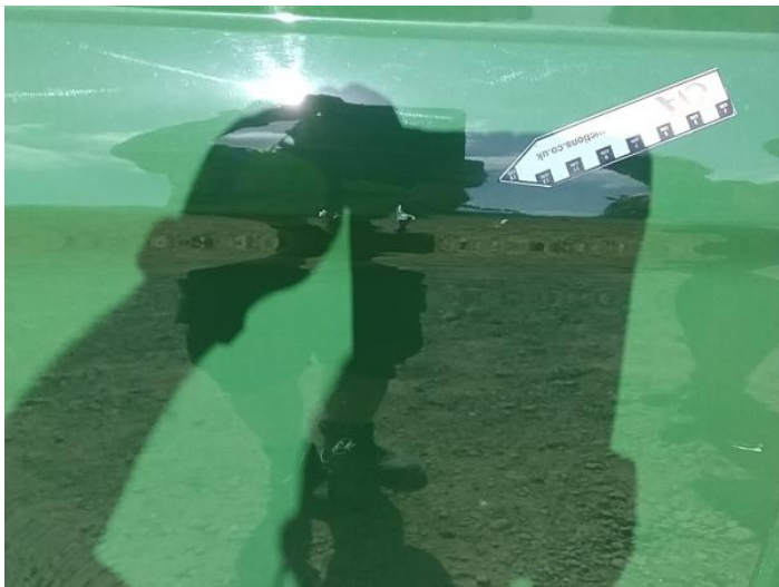
9: Qtr Panel osr Scratched Over 25mm Thru Paint