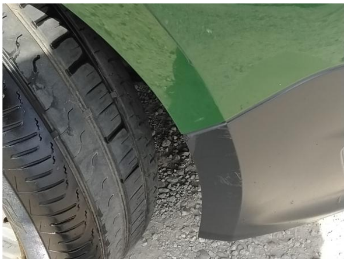
1: Bumper Front Moulding Scratched (Painted) Over 25mm Thru Paint