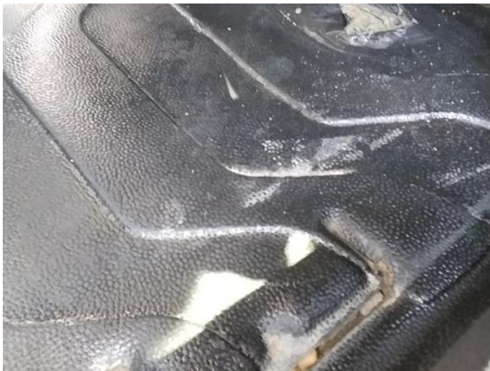
11: Carpets Front Holed Over 3mm