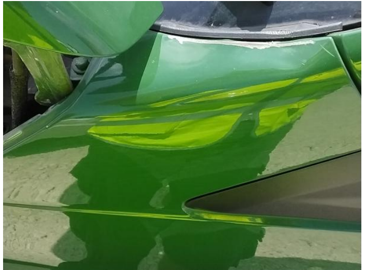
4: Wing nsf Dented With Paint Damage