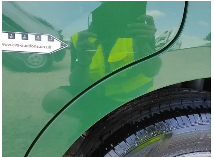
6: Door nsr Scratched Over 25mm Thru Paint