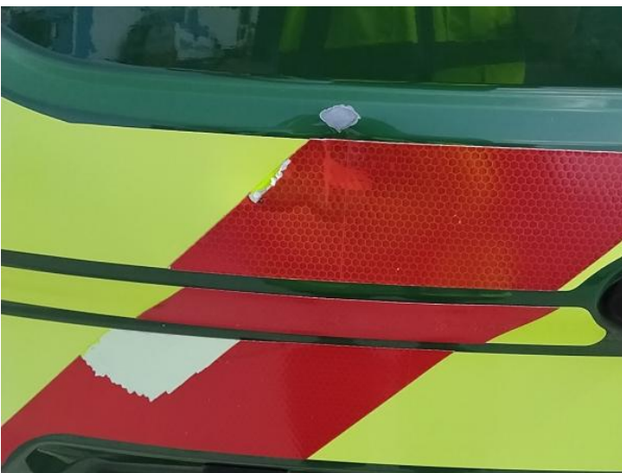
7: General Exterior Soiled Light