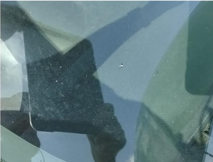
3: Screen Front Chipped Over 10mm