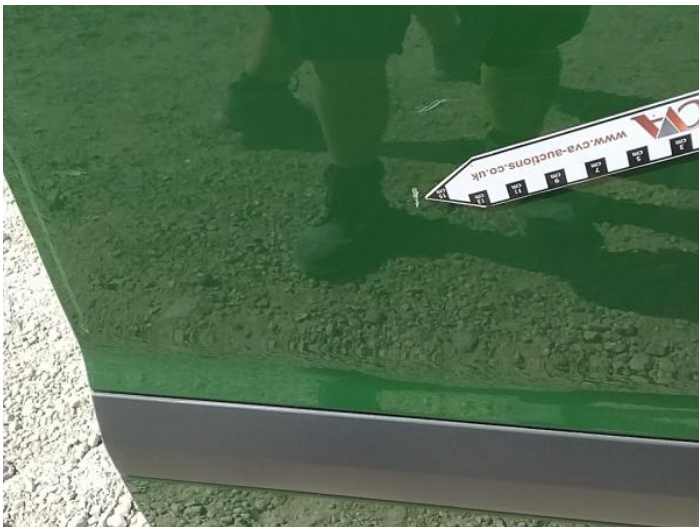
10: Door osf Scratched Over 25mm Thru Paint