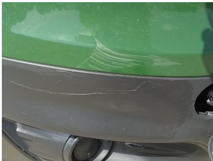
2: Bumper Front Moulding Scratched (Painted) Over 25mm Thru Paint