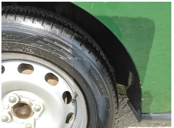
8: Qtr Panel osr Scratched Over 25mm Thru Paint