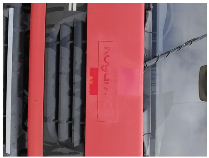
3: Bonnet Chipped Multiple Chips