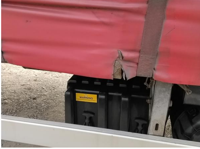
5: General Exterior Soiled Light