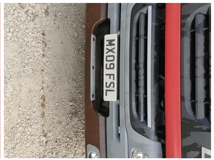
2: Bumper Front Rusted Over 5mm