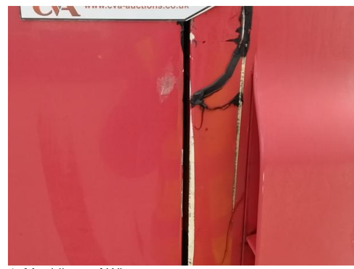
1: Moulding osf Wing Broken Replace