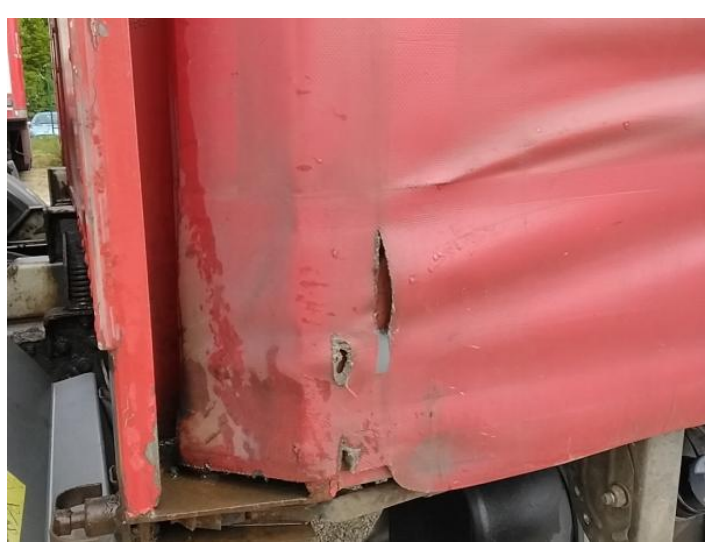
4: General Exterior Soiled Light