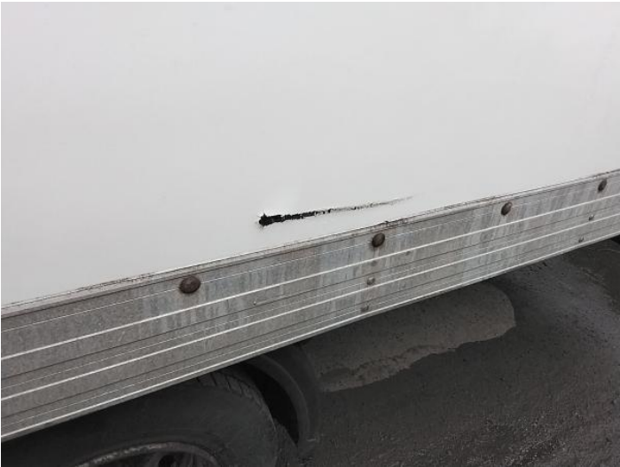
4: Qtr Panel nsr Scratched Over 25mm Thru Paint