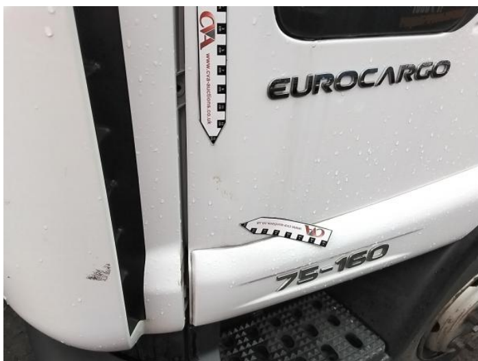
1: Door nsf Dented Over 30mm