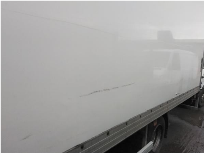
3: Qtr Panel nsr Scratched Over 25mm Thru Paint