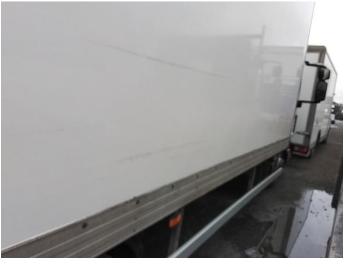
5: Qtr Panel osr Scratched Over 25mm Not Thru Paint