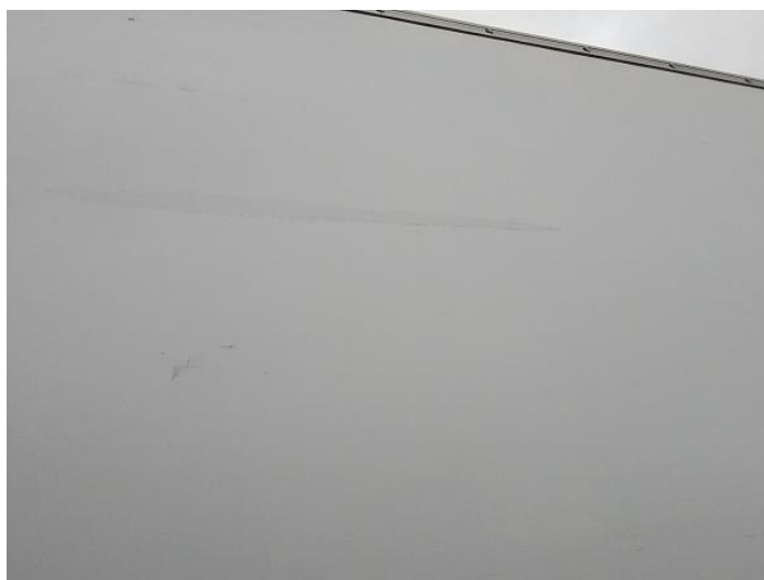
2: Qtr Panel nsr Scratched Over 25mm Not Thru Paint