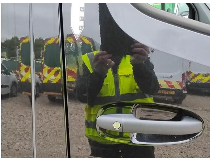
7: Door osf Scratched UpTo 25mm Thru Paint