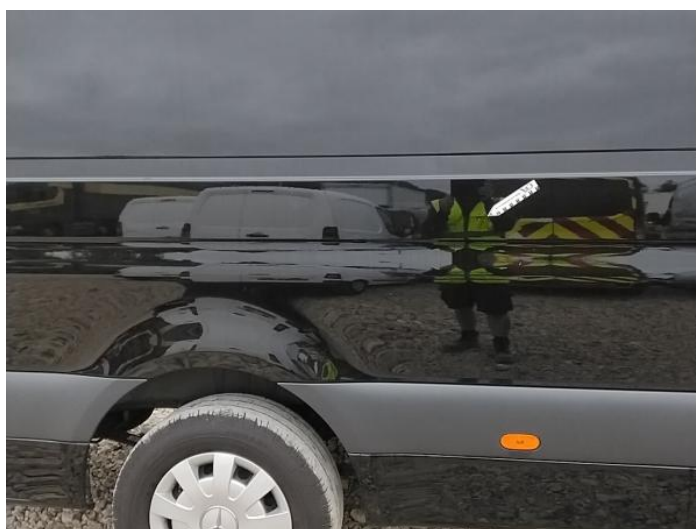
6: General Exterior Soiled Light