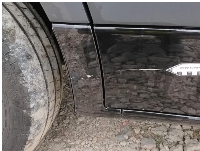
2: Door nsf Scratched Over 25mm Thru Paint