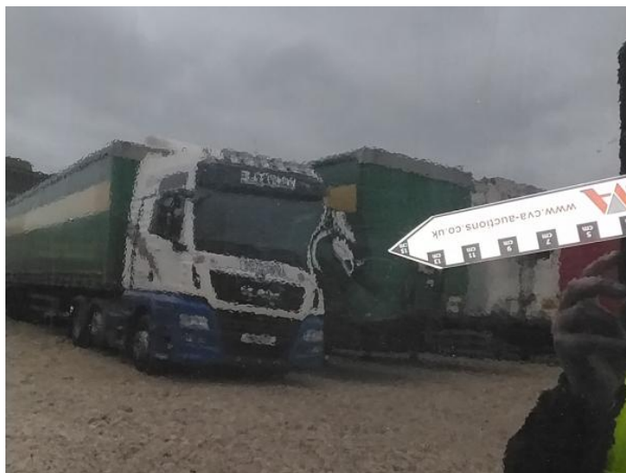
4: General Exterior Soiled Light