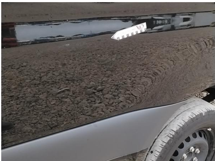
3: General Exterior Soiled Light