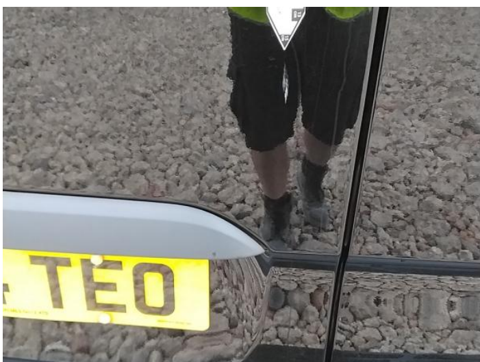
5: General Exterior Soiled Light