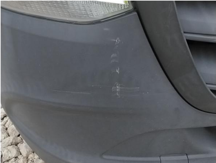
3: Bumper Front Scratched Over 25mm Not Thru Paint