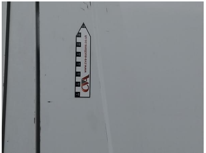
6: Door nsr Scratched Over 25mm Thru Paint