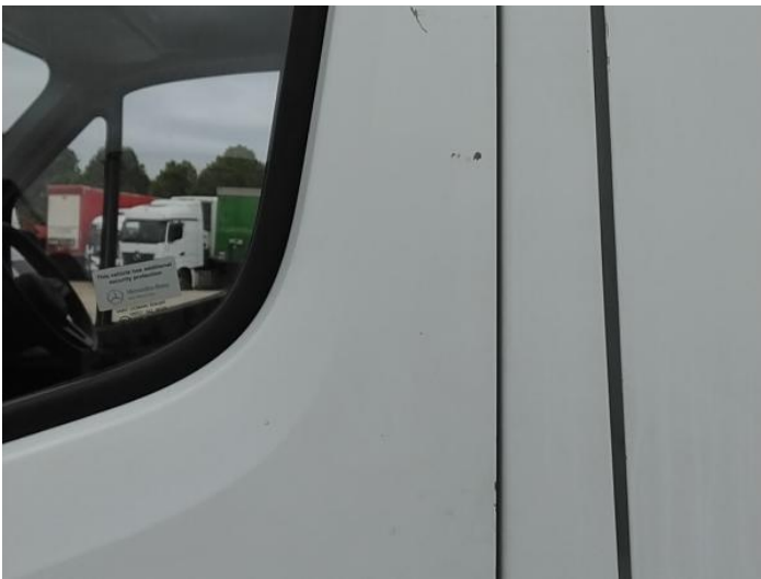
5: Door nsf Scratched Over 25mm Thru Paint