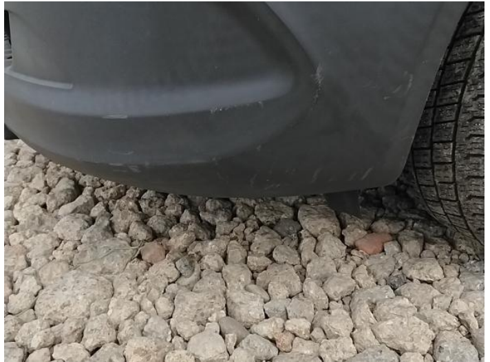
4: Bumper Front Scratched Over 25mm Not Thru Paint