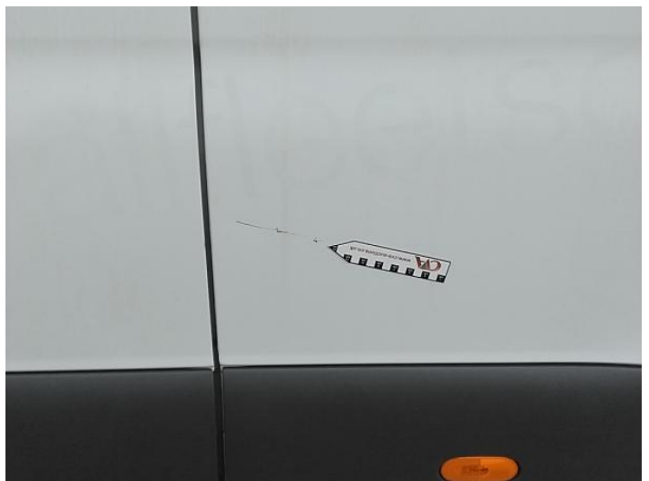
8: Qtr Panel nsr Scratched Over 25mm Thru Paint