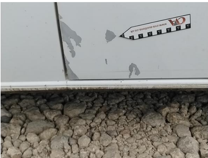
7: Door nsr Scratched Over 25mm Thru Paint