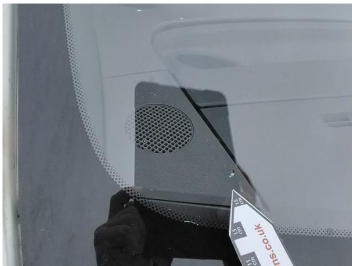
1: Screen Front Chipped Over 10mm