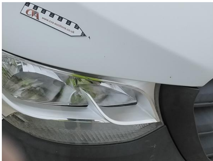
2: Bonnet Chipped Multiple Chips