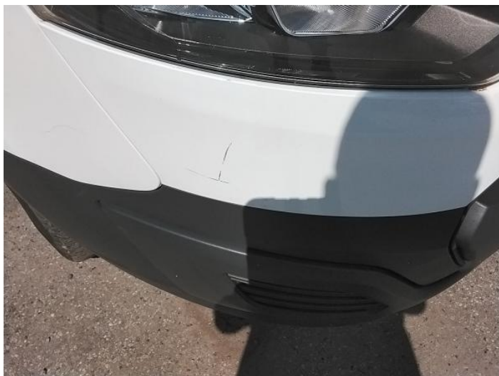
1: Panel Front Scratched Over 25mm Thru Paint