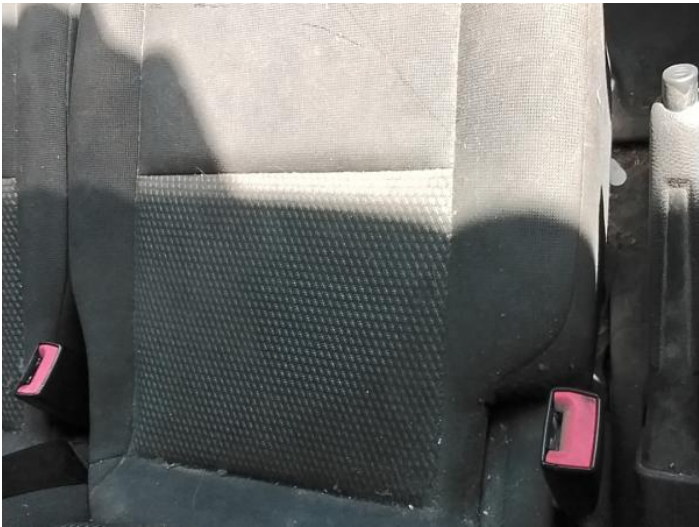
5: Seat Base Cover nsf Soiled Heavy