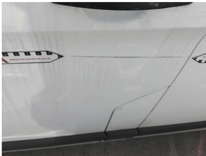
2: Door nsf Scratched Over 25mm Not Thru Paint