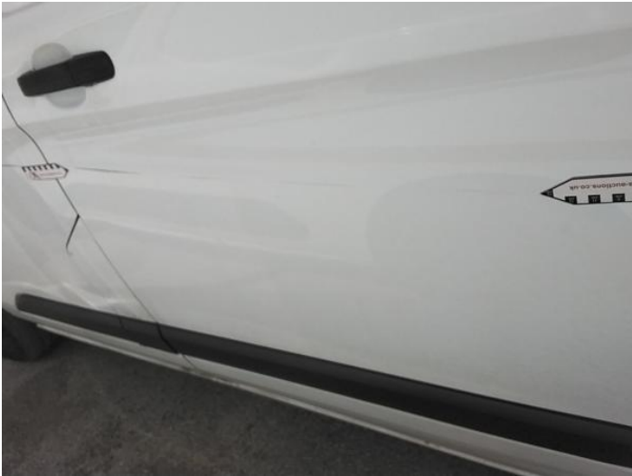
3: Qtr Panel nsr Scratched Over 25mm Not Thru Paint