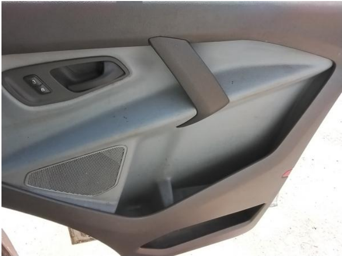
4: Door Pad osf Soiled Heavy