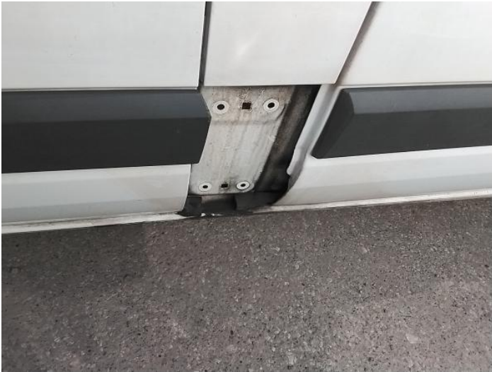
3: Door Moulding nsf Missing Replace