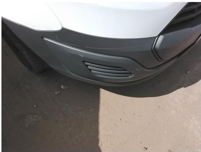
1: Bumper Front Scratched Over 100mm Thru Paint