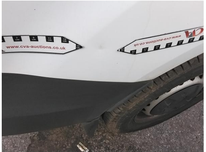
4: Qtr Panel osr Dented Over 30mm