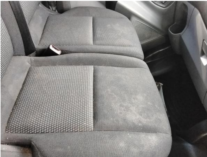
5: Seat Base Cover nsf Soiled Heavy