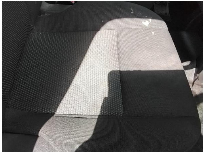
6: Seat Base Cover osf Soiled Heavy