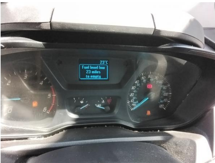
7: Dash Warning Lights Displayed No Action