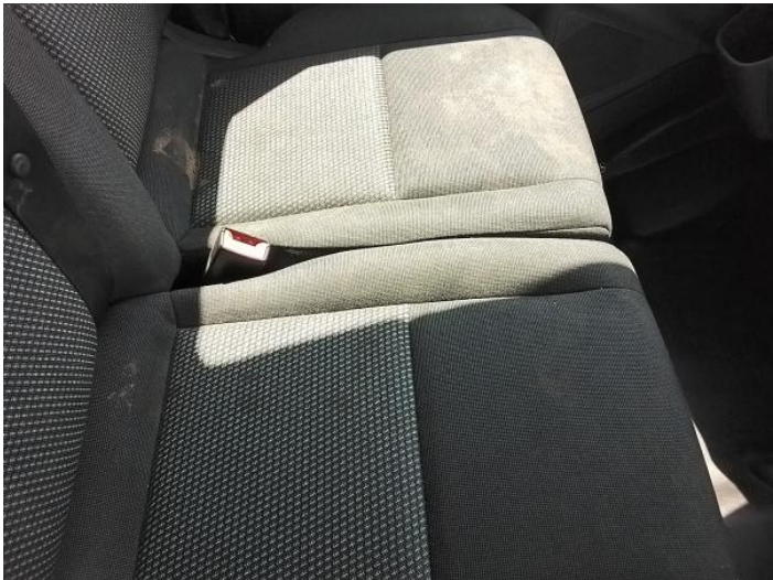
2: Seat Base Cover nsf Soiled Heavy