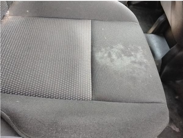
1: Seat Base Cover osf Soiled Heavy