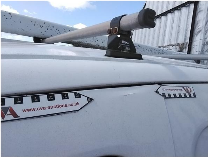
3: Door nsf Dented Over 30mm