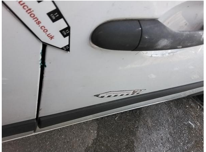
4: Qtr Panel nsr Dented Over 30mm