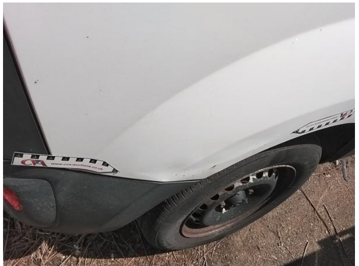
6: Qtr Panel osr Dented Over 30mm