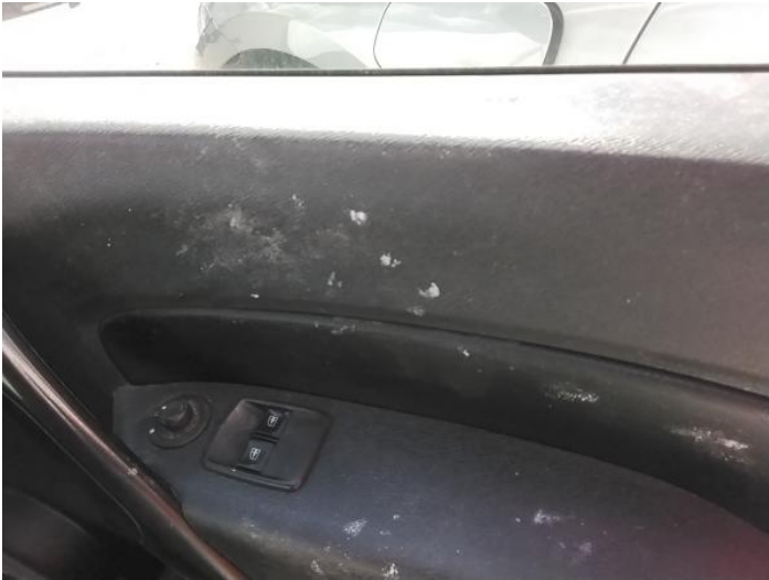
9: Door Pad osf Soiled Heavy