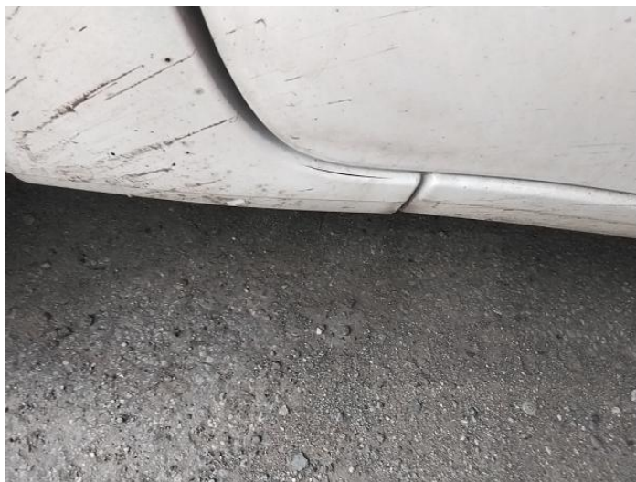
2: Wing nsf Cracked Replace