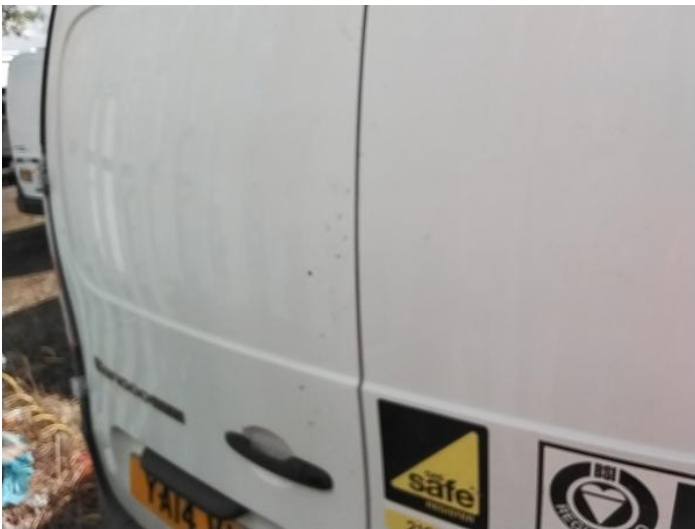
5: Door nsr Chipped Multiple Chips