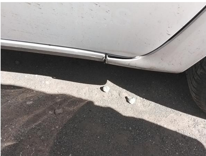
7: Wing osf Cracked Replace