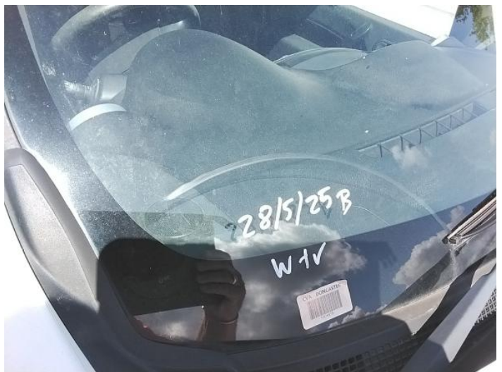
8: Screen Front Scratched Over 30mm