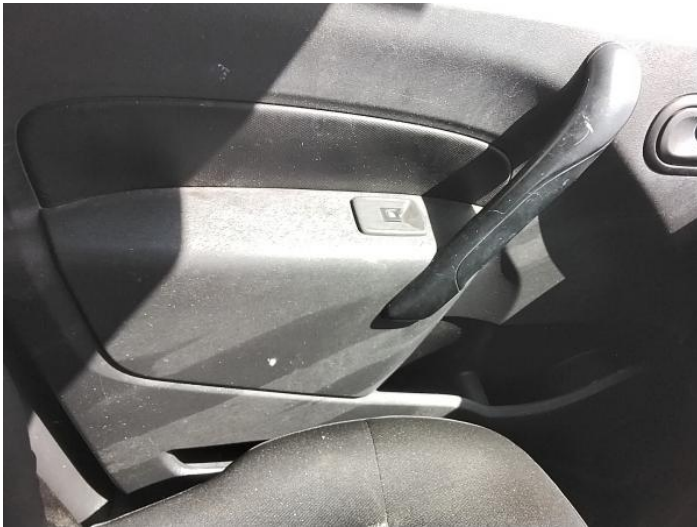
12: Door Pad nsf Soiled Heavy