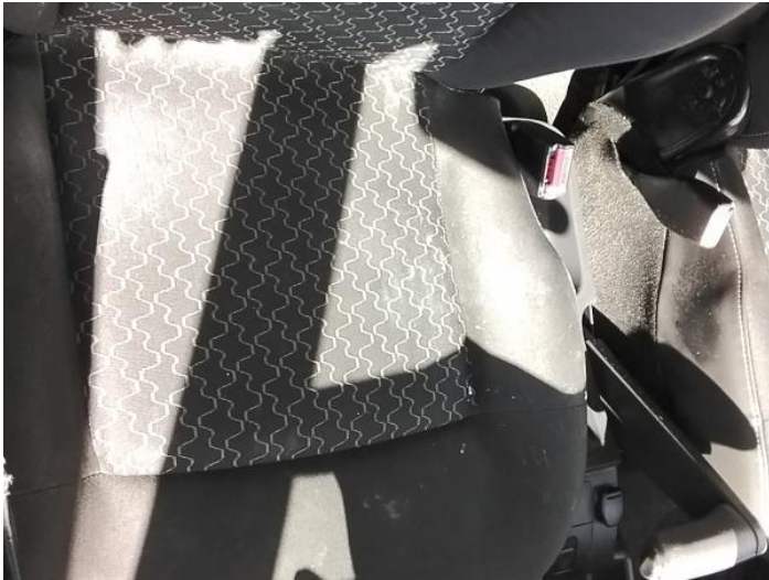
10: Seat Base Cover osf Soiled Heavy