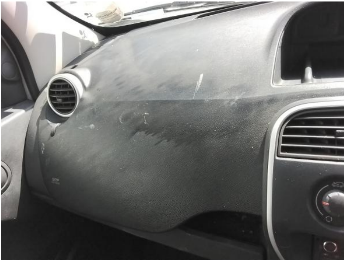
11: Fascia Panel Soiled Heavy