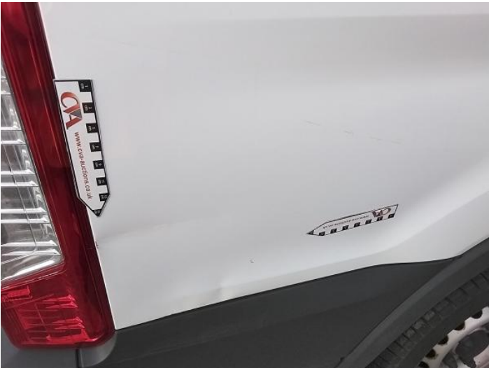
1: Qtr Panel osr Dented Over 30mm