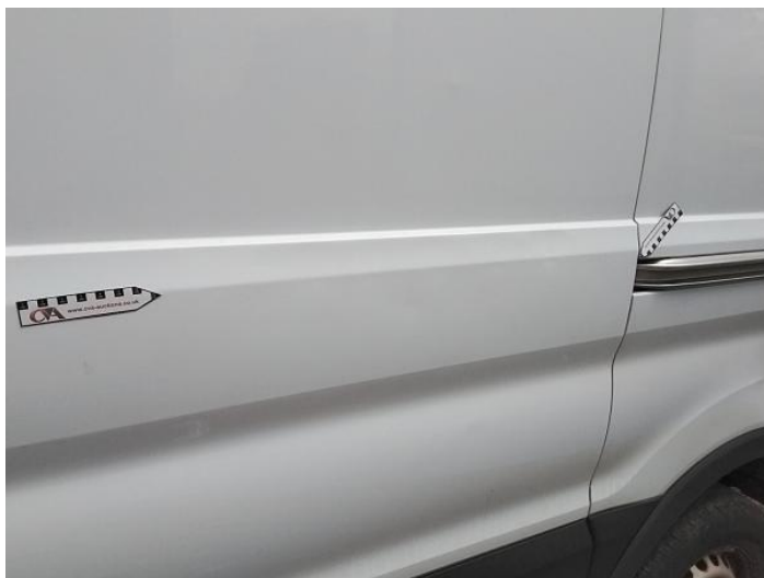
1: Qtr Panel nsr Dented Over 30mm