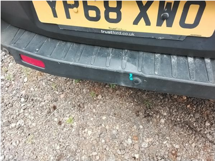
3: Bumper Rear Dented Over 30mm