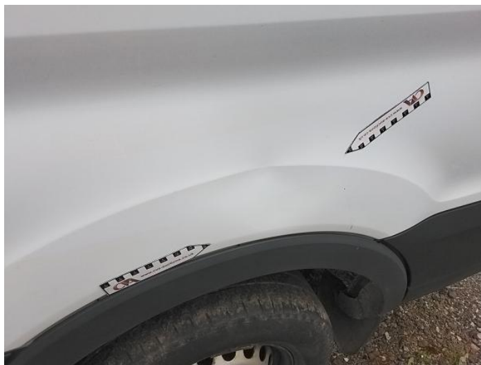
2: Qtr Panel nsr Dented Over 30mm