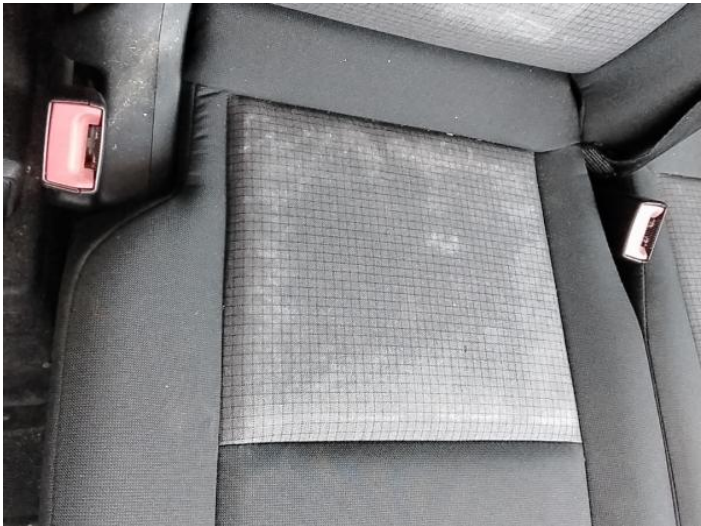
2: Seat Base Cover nsf Soiled Heavy