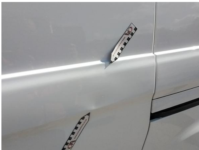
1: Qtr Panel nsr Dented Over 30mm