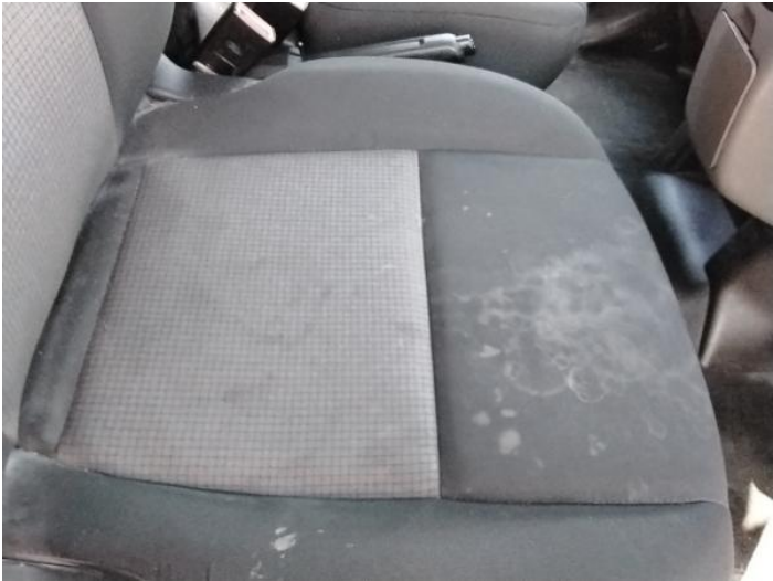
3: Seat Base Cover osf Soiled Heavy