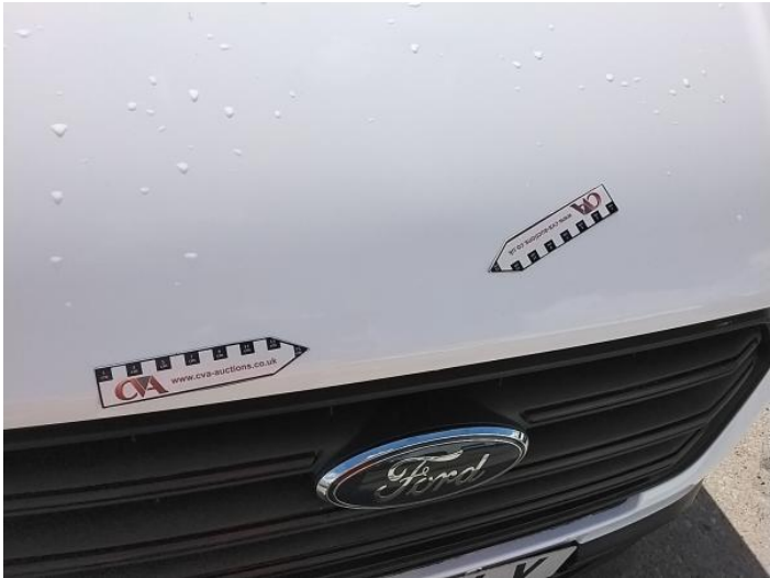
4: Bonnet Dented Over 30mm