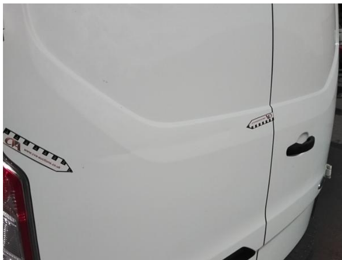
2: Door nsr Dented Over 30mm