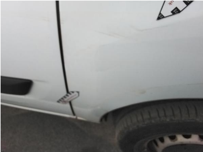
3: Qtr Panel nsr Dented With Paint Damage