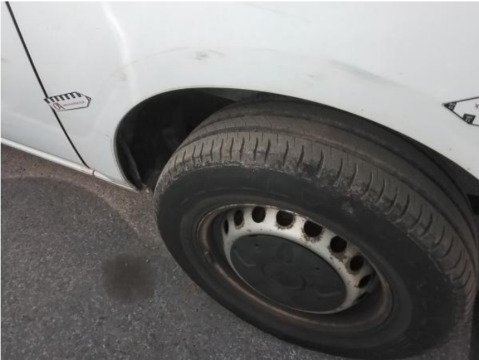
4: Qtr Panel nsr Dented With Paint Damage