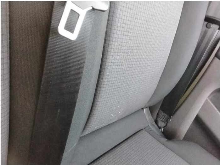
5: Seat Back Cover nsf Soiled Heavy