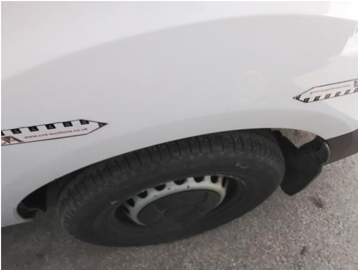
3: Qtr Panel nsr Scratched Over 25mm Thru Paint