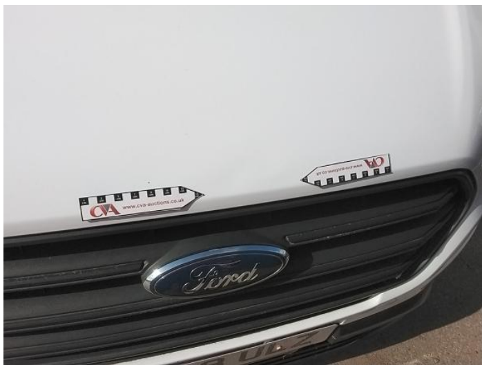
1: Bonnet Dented Over 30mm