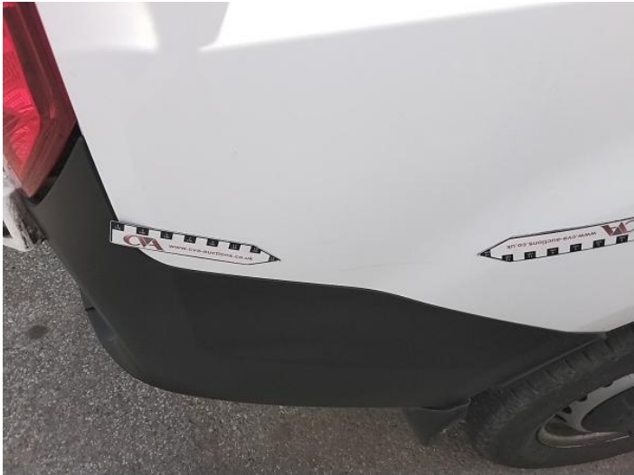
4: Qtr Panel osr Scratched Over 25mm Not Thru Paint