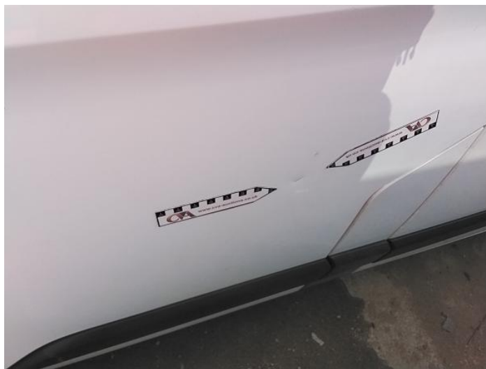
2: Door nsf Dented Over 30mm