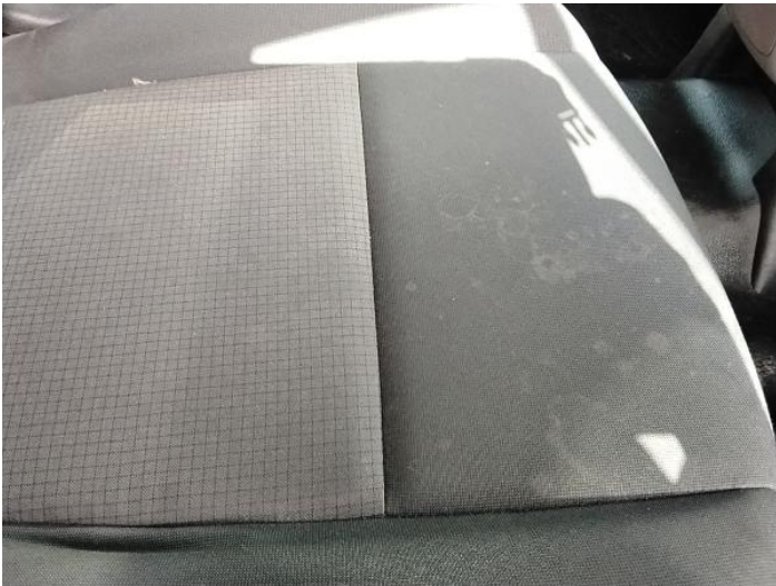
5: Seat Base Cover osf Soiled Heavy