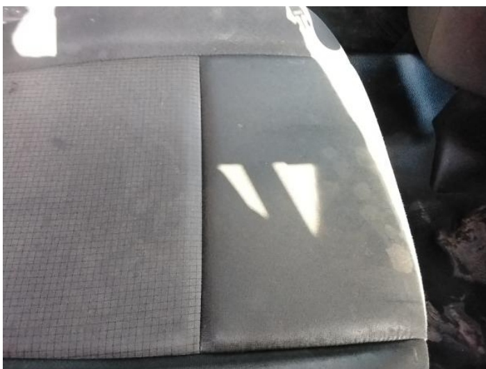
7: Seat Base Cover osf Soiled Heavy