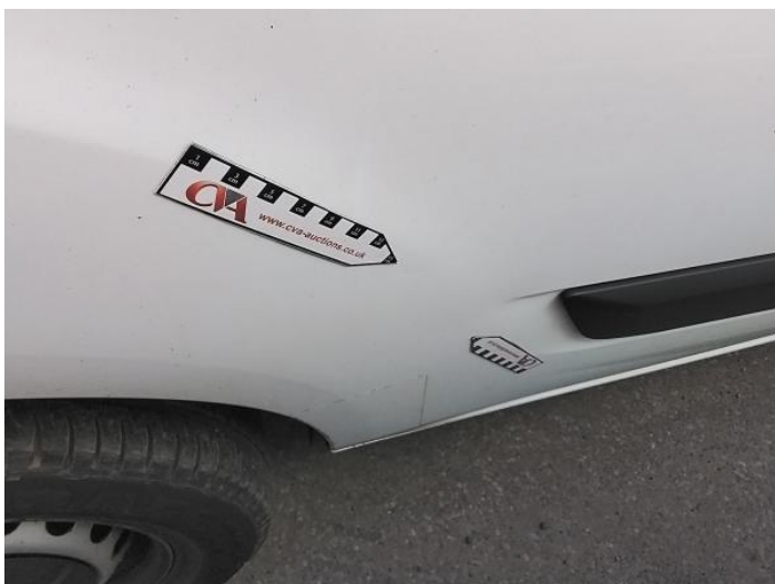
5: Qtr Panel osr Dented Over 30mm