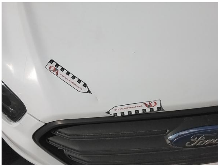
1: Bonnet Dented Over 30mm