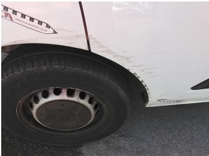
3: Door nsf Scratched Over 25mm Thru Paint