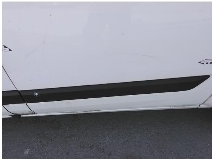
4: Qtr Panel nsr Scratched Over 25mm Thru Paint