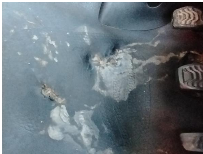
6: Carpets Front Holed Over 3mm