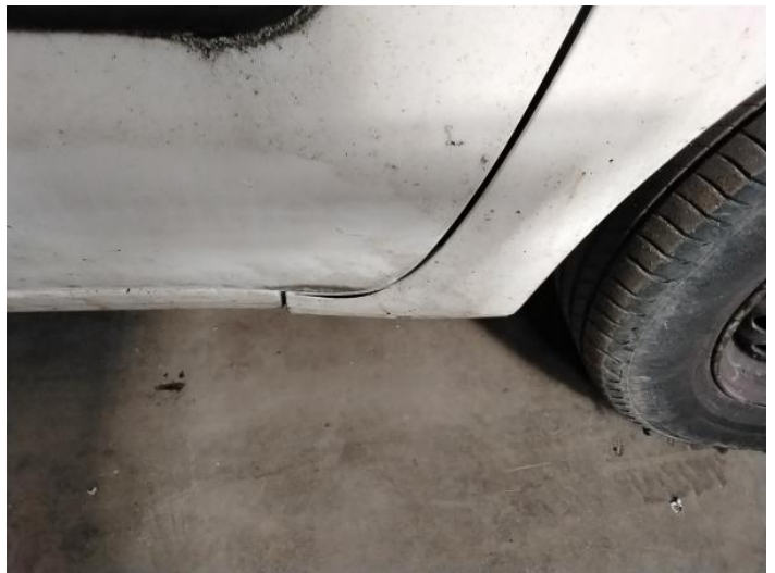
6: Wing osf Cracked Replace