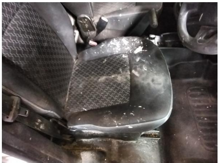
8: Seat Base Cover osf Soiled Heavy