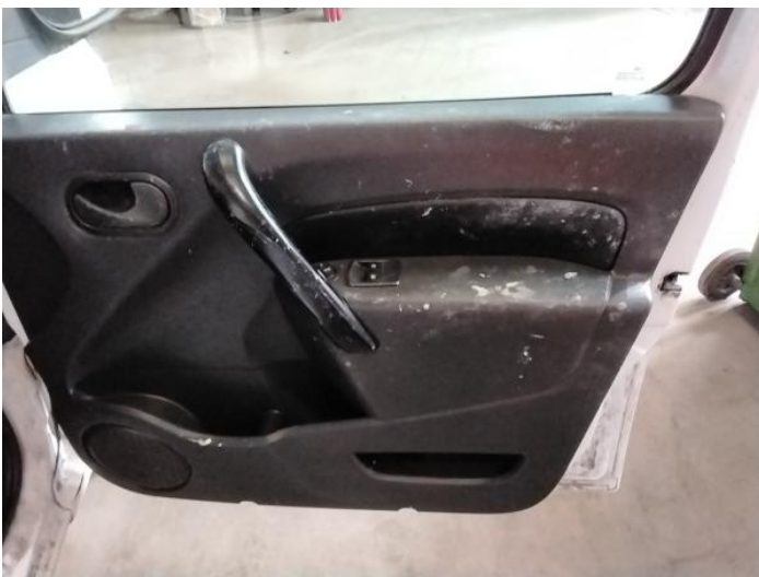
7: Door Pad osf Soiled Heavy