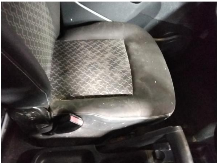
9: Seat Base Cover nsf Soiled Heavy