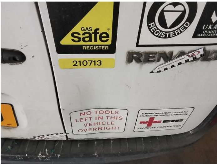
3: Door osr Dented Over 30mm