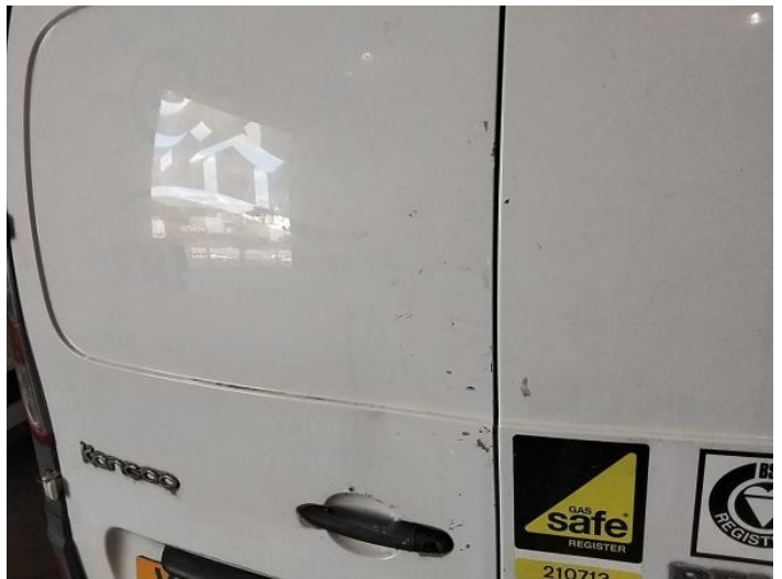
4: Door osr Chipped Multiple Chips