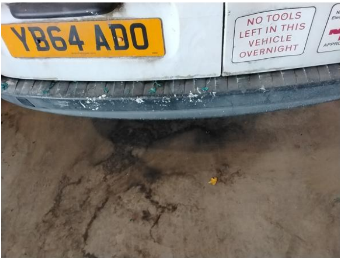
5: Bumper Rear Chipped Multiple Chips