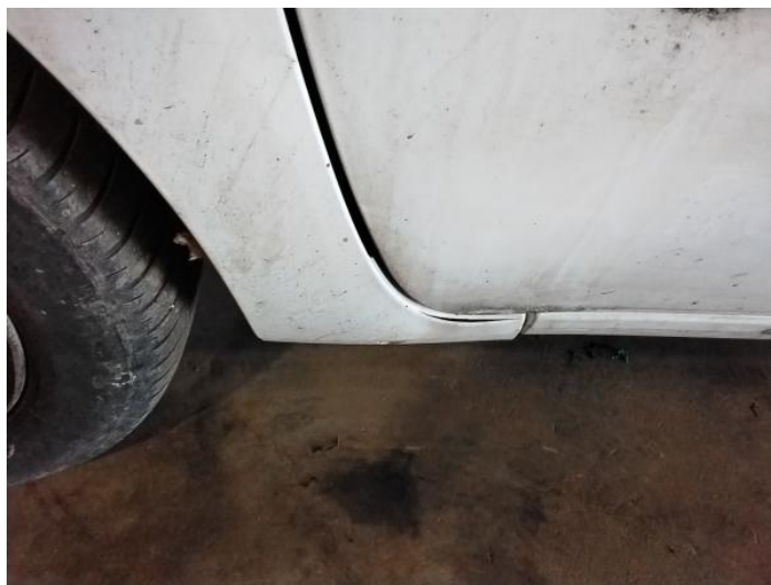
2: Wing nsf Cracked Replace