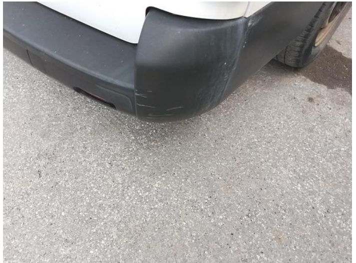
6: Qtr Panel Moulding os Scuffed (Unpainted) Over 100mm