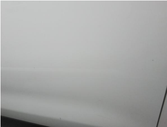
3: Qtr Panel nsr Chipped Multiple Chips