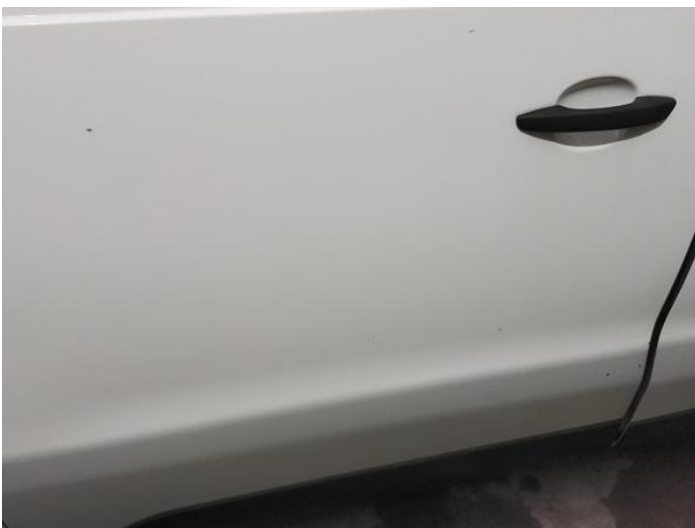
7: Qtr Panel osr Chipped Multiple Chips