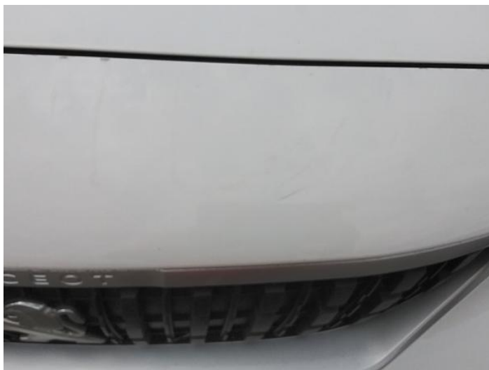
1: Panel Front Scratched UpTo 25mm Not Thru Paint