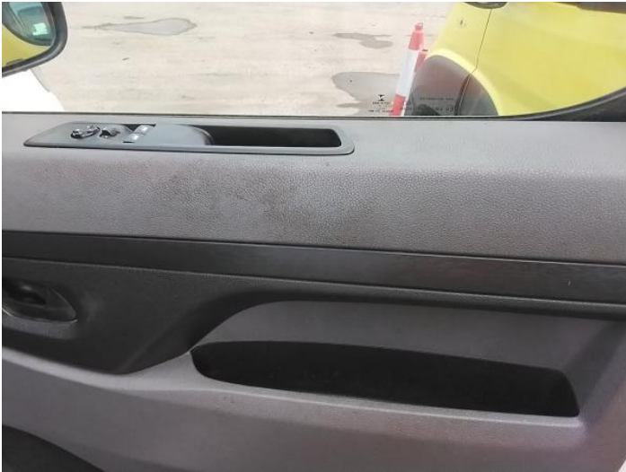
9: Door Pad osf Soiled Heavy