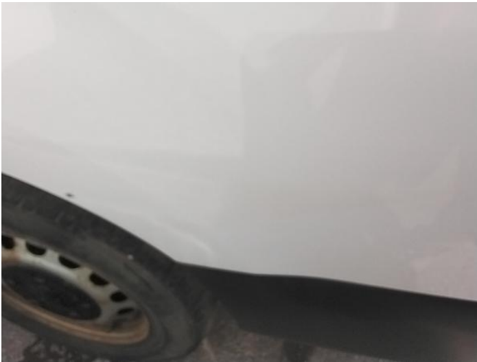
5: Qtr Panel nsr Chipped Multiple Chips