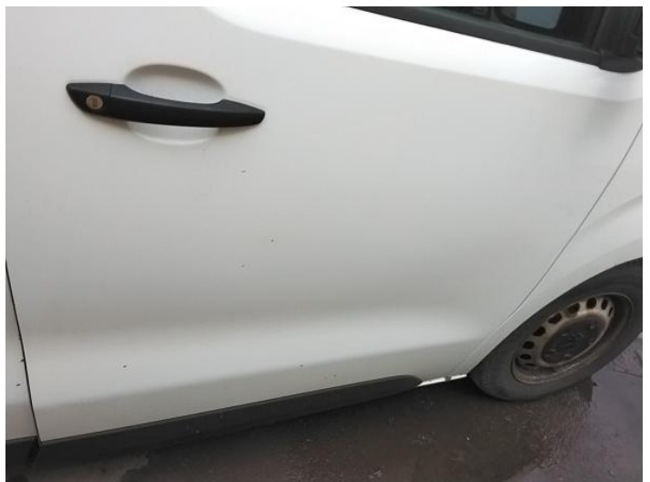
8: Door osf Chipped Multiple Chips