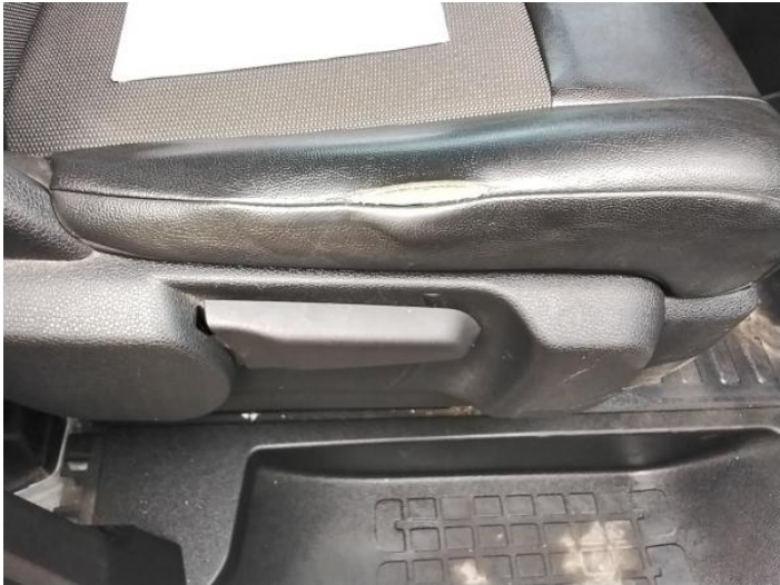
10: Seat Base Cover osf Torn Over 3mm