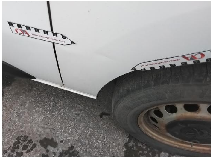
4: Qtr Panel nsr Dented Over 30mm