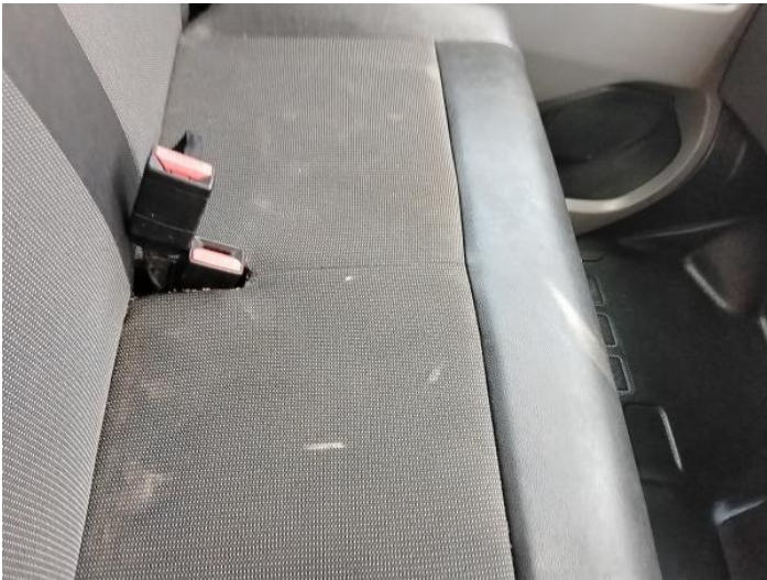
11: Seat Base Cover nsf Soiled Heavy