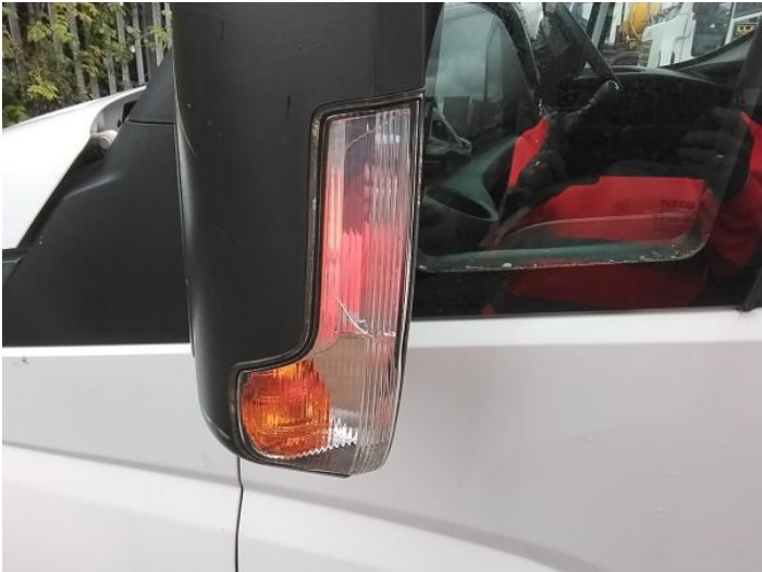
3: Door Mirror Assy nsf Broken Replace