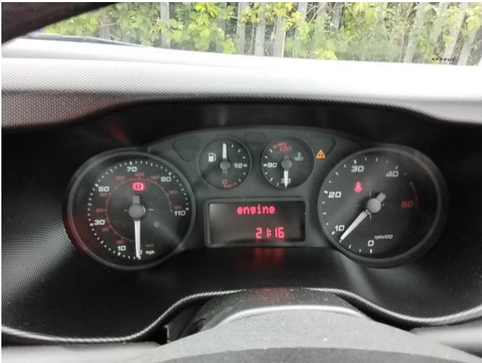
5: Dash Warning Lights Displayed No Action