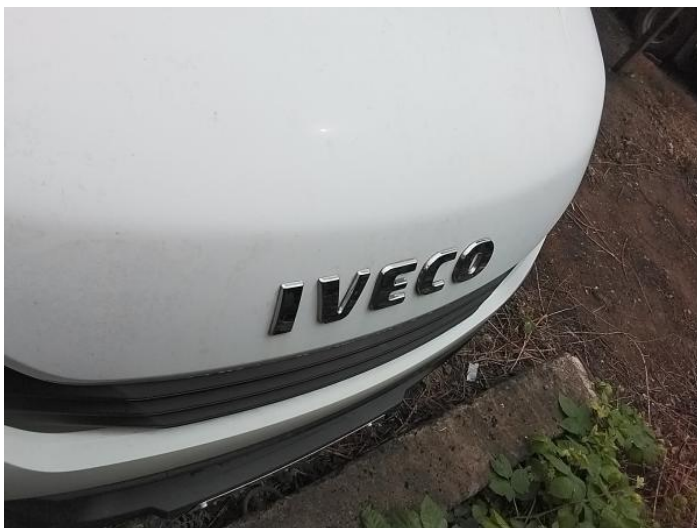
1: Bonnet Chipped Multiple Chips