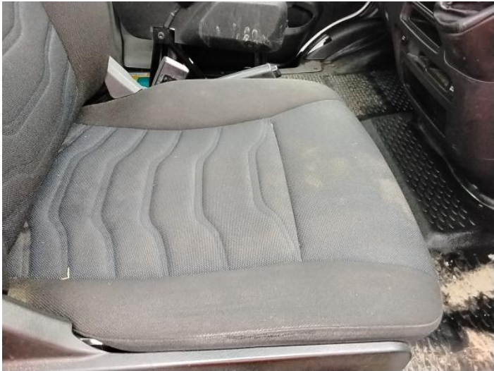
4: Seat Base Cover osf Soiled Heavy