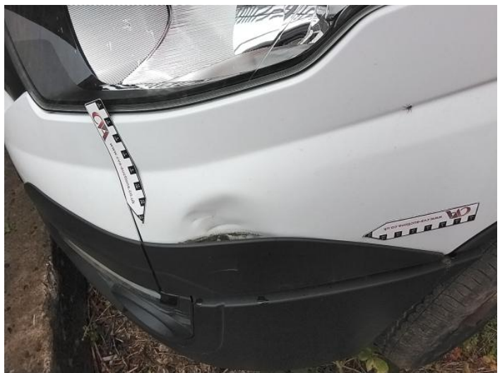
2: Wing nsf Dented Over 30mm