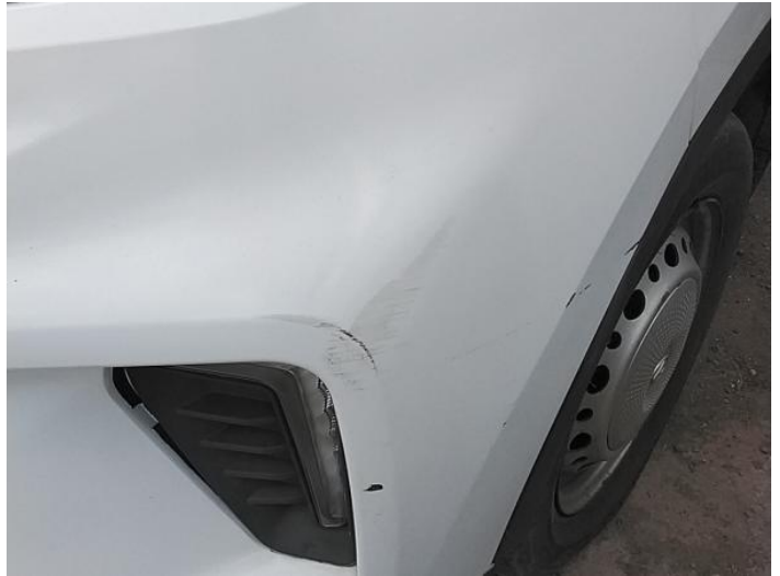
4: Bumper Front Scratched Over 100mm Thru Paint