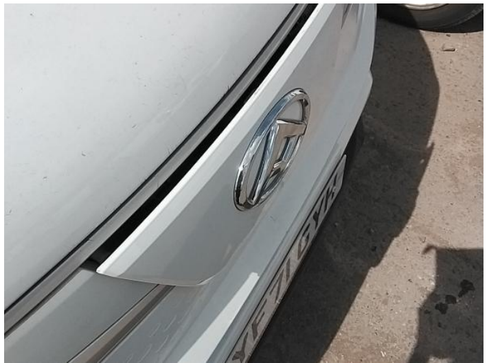
6: EV Charging Port Broken Replace