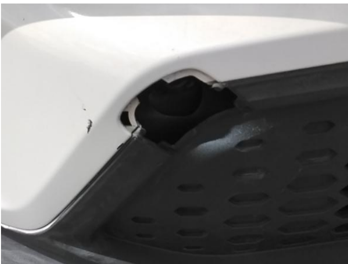
7: Front TowEye Cvr Missing Replace