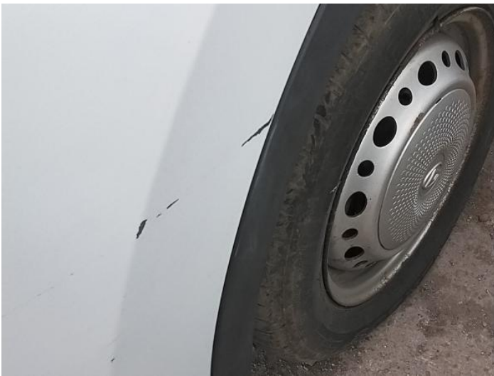
5: Bumper Front Scratched Over 100mm Thru Paint