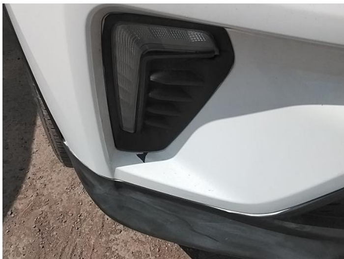
1: Bumper Front Chipped Over 5mm