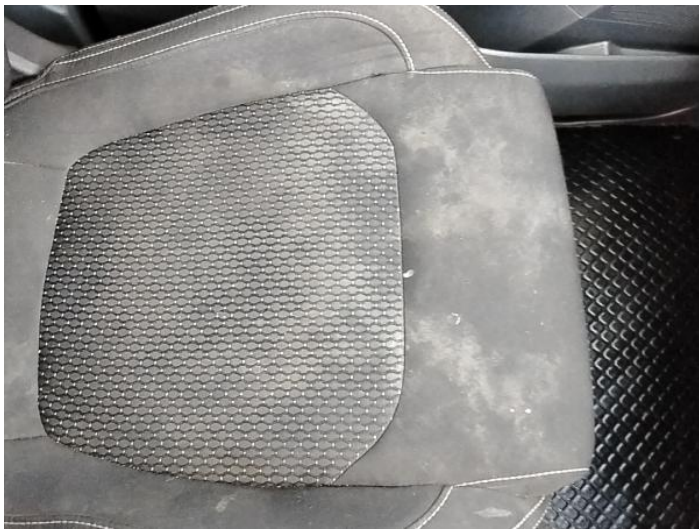
9: Seat Base Cover osf Soiled Light