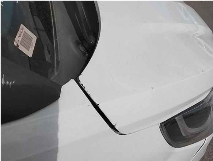
3: Bonnet Chipped Multiple Chips