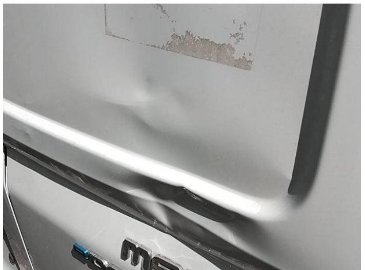
8: Door nsr Dented Over 30mm