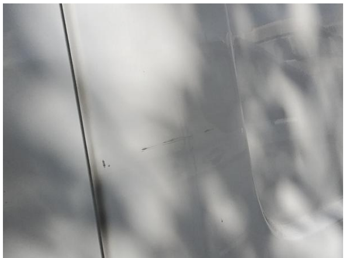
8: Panel Rear Scratched Over 25mm Not Thru Paint