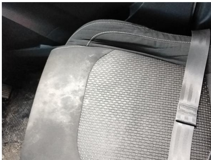
2: Seat Base Cover nsf Soiled Light