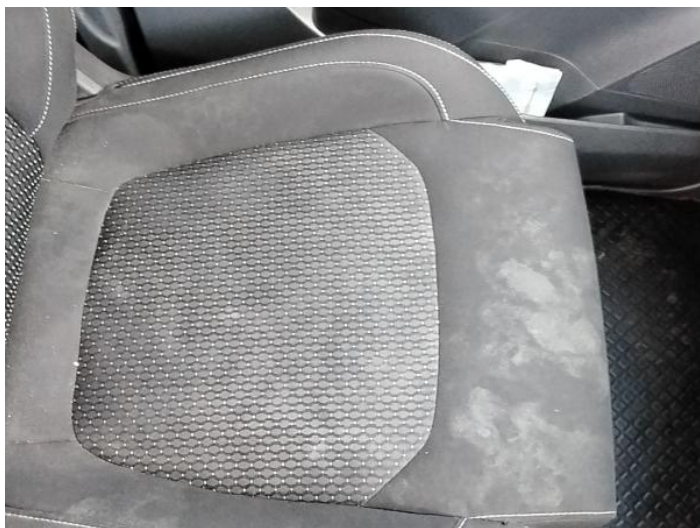
1: Seat Base Cover osf Soiled Light