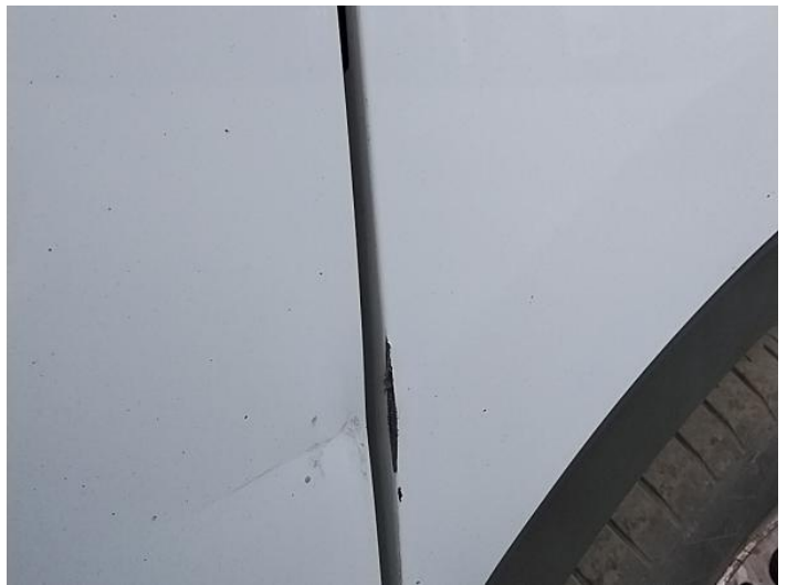
6: Moulding nsf Wing Scratched (Painted) Over 25mm Thru Paint