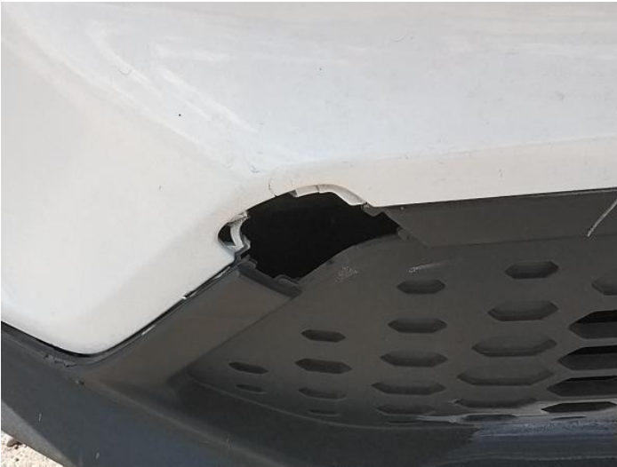
3: Front TowEye Cvr Missing Replace