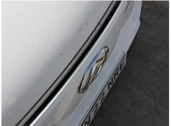
4: EV Charging Port Broken Replace