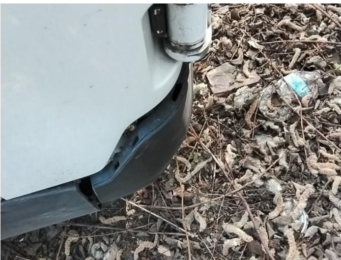
7: Bumper Rear Moulding Broken Replace