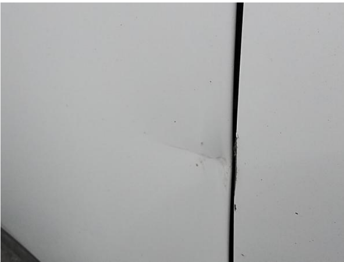
5: Door nsf Dented With Paint Damage