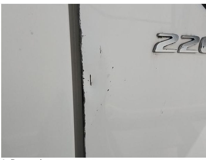
3: Door nsf Dented With Paint Damage