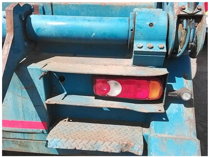
2: Lamp nsr Broken Replace