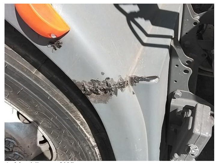
1: Moulding osf Wing Broken Replace