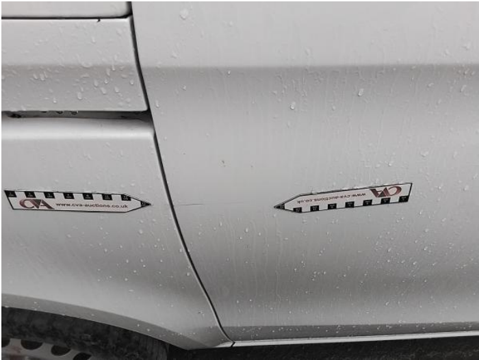
3: Qtr Panel osr Scratched Over 25mm Not Thru Paint