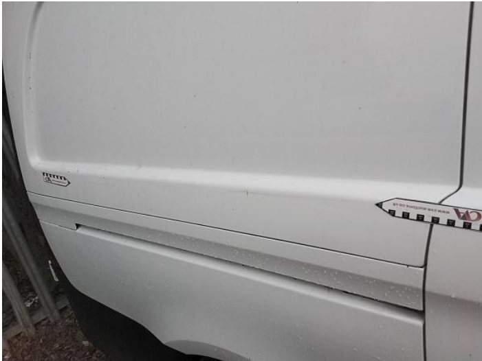
4: Qtr Panel osr Scratched Over 25mm Not Thru Paint