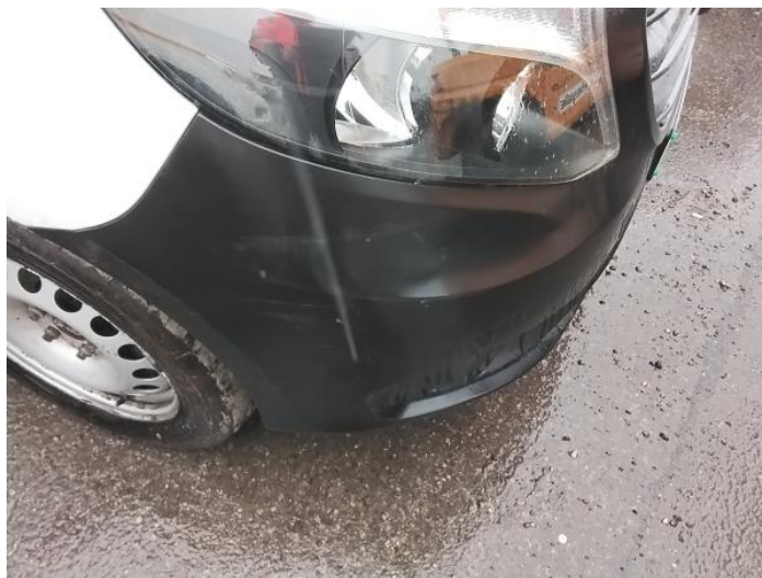
2: Bumper Front Scratched Over 100mm Thru Paint