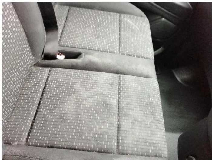
1: Seat Base Cover nsf Soiled Heavy