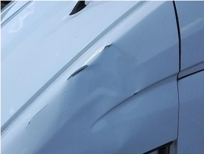
3: Roof Dented With Paint Damage