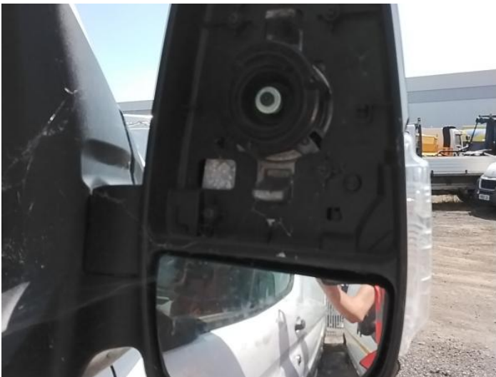
1: Door Mirror Assy nsf Missing Replace