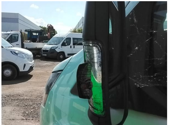
2: Door Mirror Assy osf Broken Replace