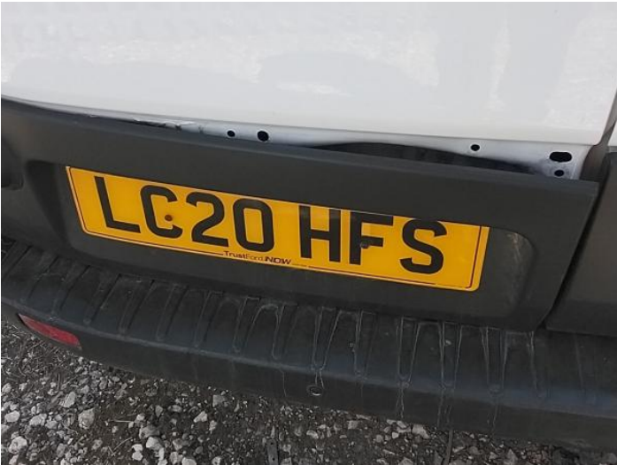
4: Door osr Missing Replace