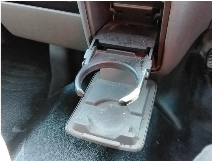
5: Other N/A N/A