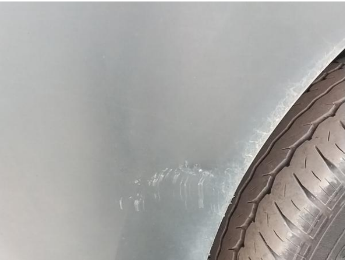
1: Bumper Front Moulding Scuffed (Unpainted) Over 100mm