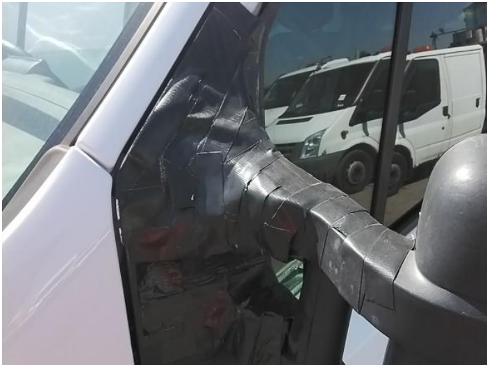
2: Door Mirror Assy osf Broken Replace