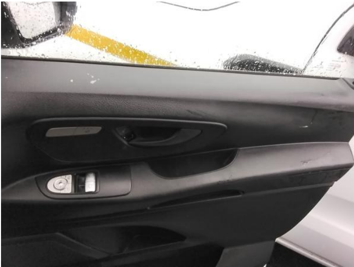
11: Door Pad osf Soiled Heavy