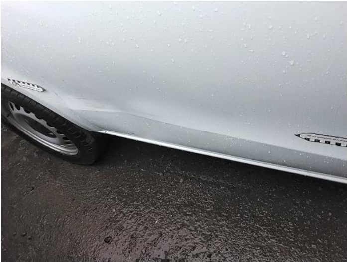
9: Qtr Panel osr Dented Over 30mm