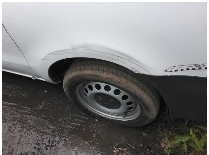
8: Qtr Panel nsr Dented Over 30mm