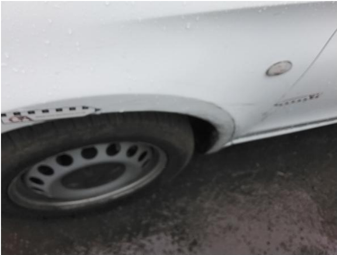
3: Wing nsf Scratched Over 25mm Thru Paint