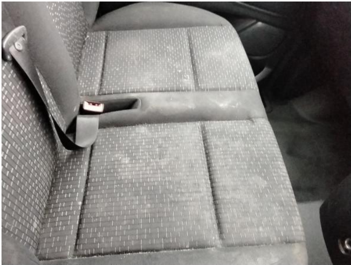
12: Seat Base Cover nsf Soiled Heavy