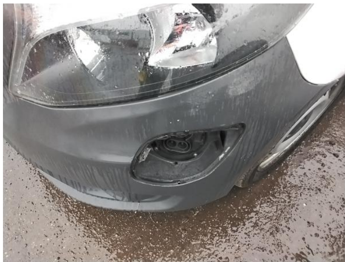
2: Bumper Front Moulding Missing Replace