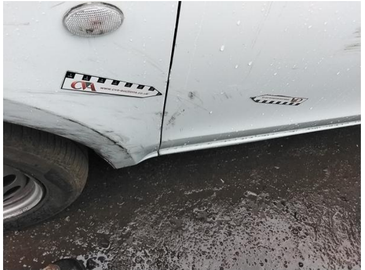
4: Door nsf Scratched Over 25mm Thru Paint