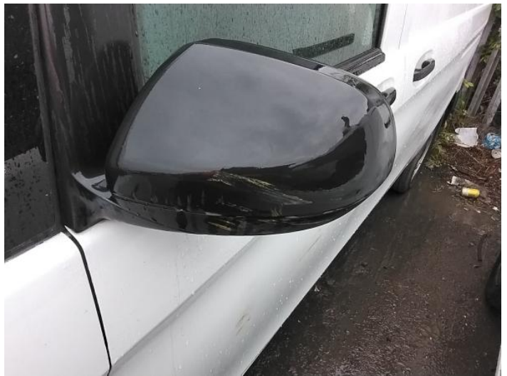
6: Door Mirror Assy nsf Scuffed (Unpainted) Over 100mm