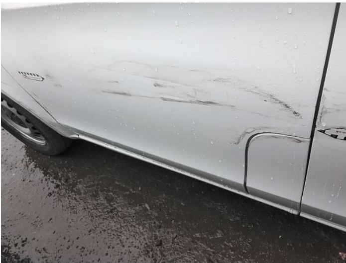
5: Door nsf Dented Over 30mm