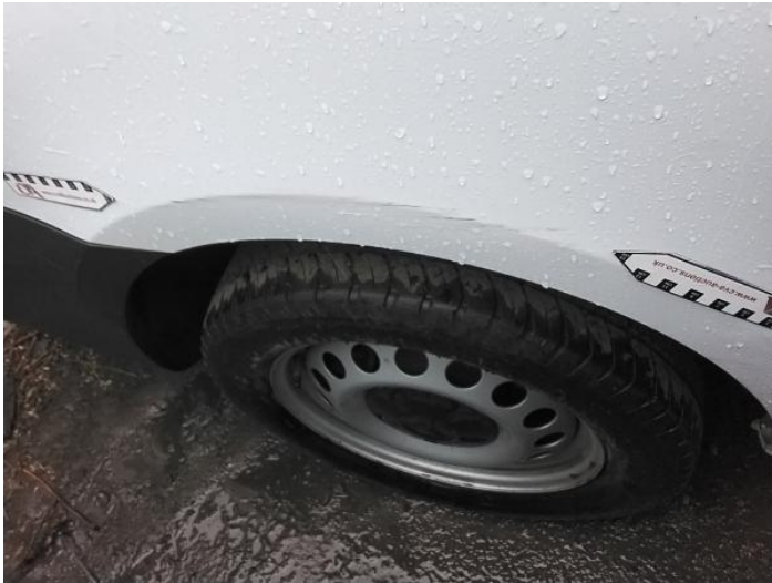
10: Qtr Panel osr Scratched Over 25mm Thru Paint