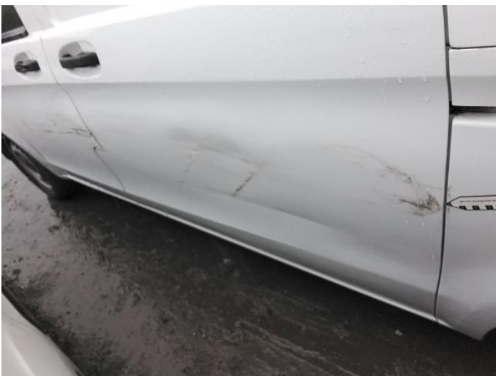
7: Qtr Panel nsr Dented Over 30% Of Panel