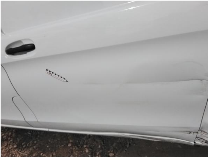
3: Qtr Panel nsr Dented Over 30mm