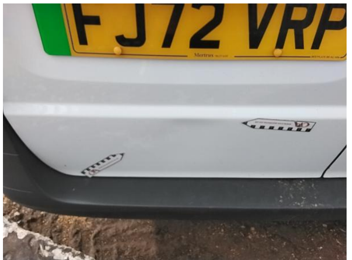
8: Door nsr Dented Over 30mm