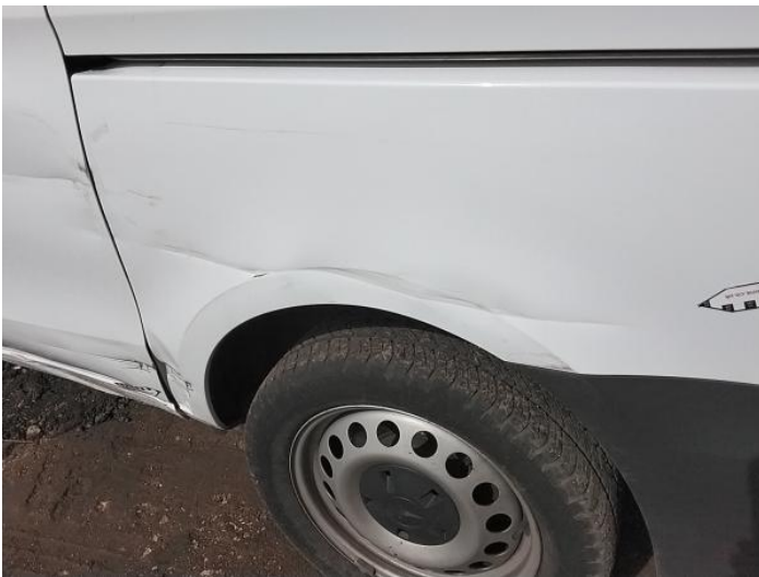
5: Qtr Panel nsr Dented Over 30mm