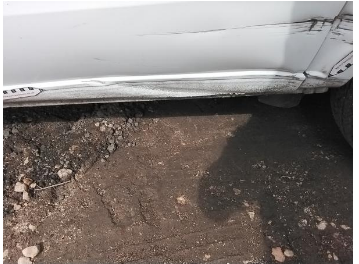
4: Sill ns Dented Over 30mm