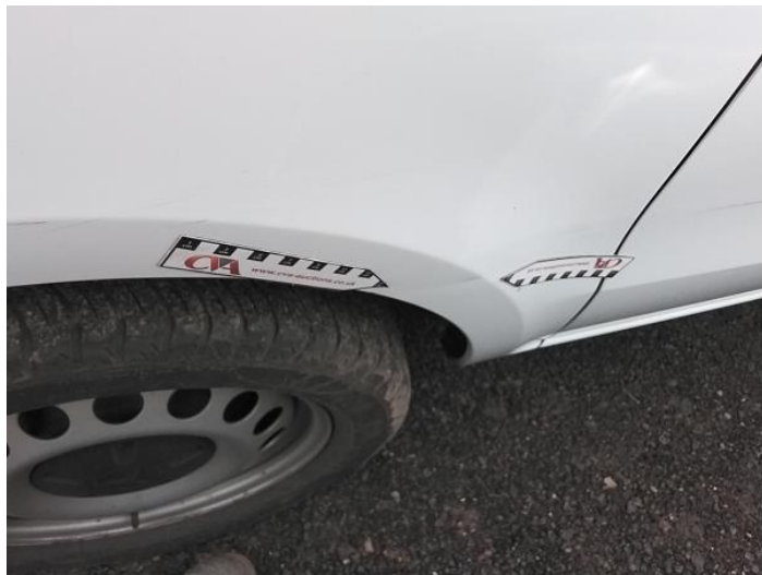
10: Qtr Panel osr Dented Over 30mm