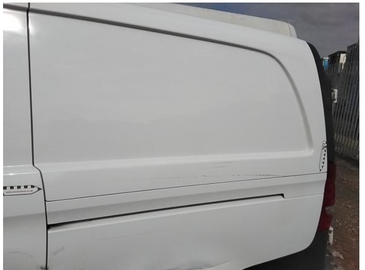
6: Qtr Panel nsr Scratched Over 25mm Not Thru Paint