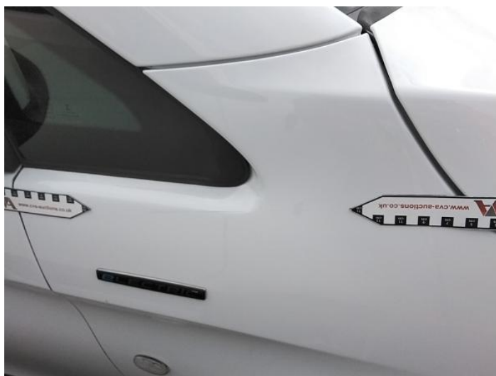
14: Wing osf Scratched Over 25mm Not Thru Paint