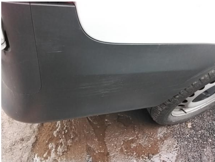
9: Bumper Rear Moulding Scuffed (Unpainted) Over 100mm