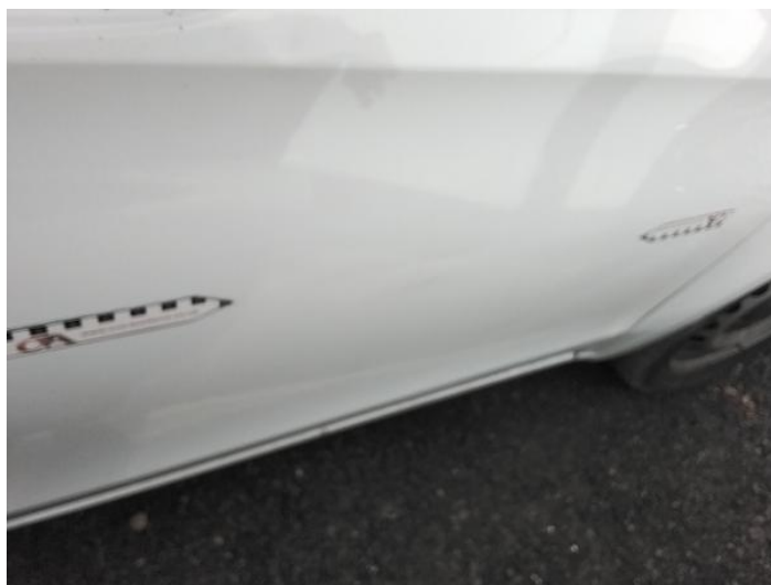
12: Door osf Dented Over 30mm