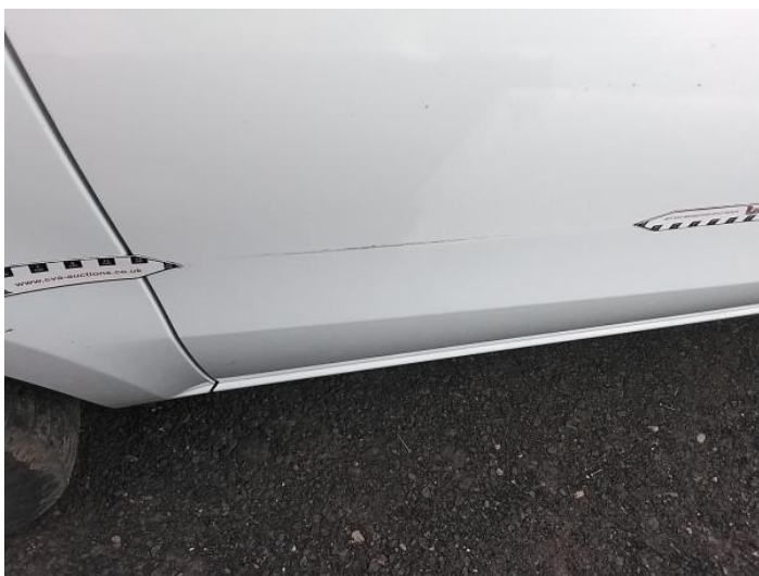
11: Qtr Panel osr Scratched Over 25mm Not Thru Paint