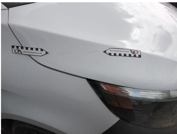
13: Bonnet Scratched Over 25mm Not Thru Paint