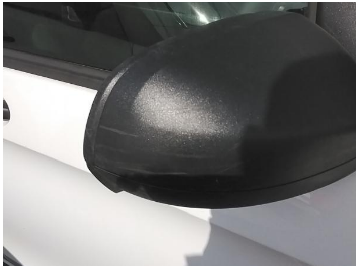
12: Door Mirror Assy nsf Scuffed (Unpainted) Over 100mm