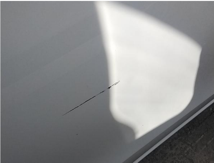
11: Panel Front Scratched Over 25mm Thru Paint