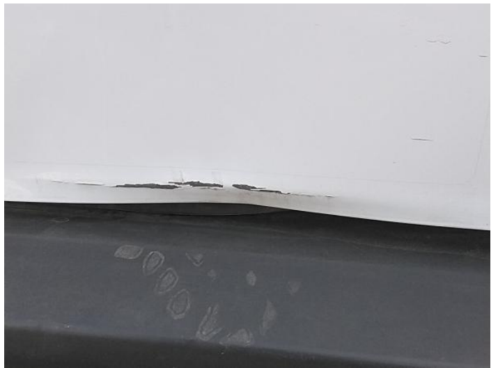
6: Door nsr Dented With Paint Damage