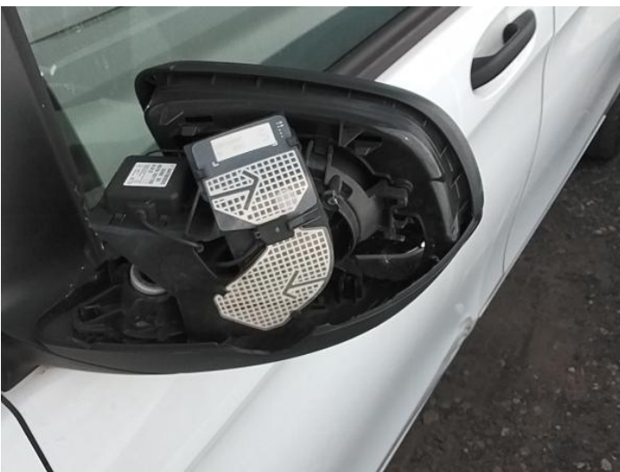
13: Door Mirror Assy osf Broken Replace