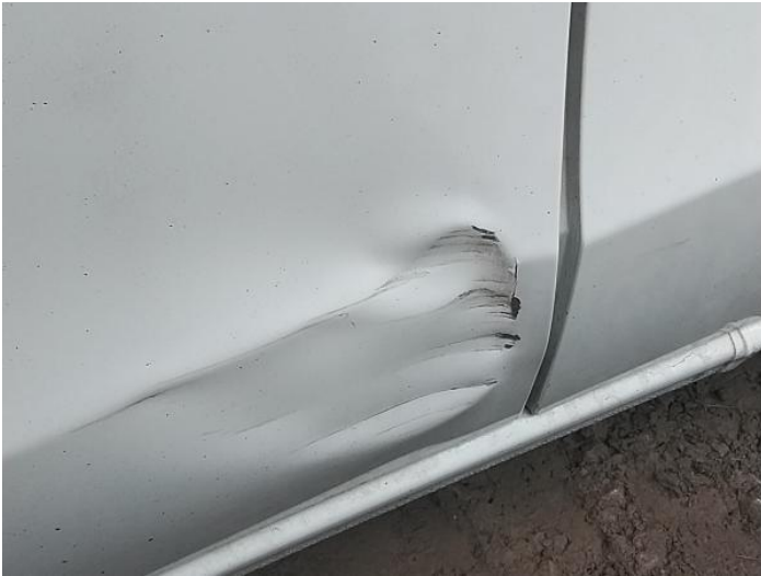
3: Door osf Dented With Paint Damage