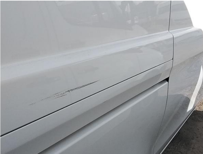
9: Panel Rear Scratched Over 25mm Thru Paint