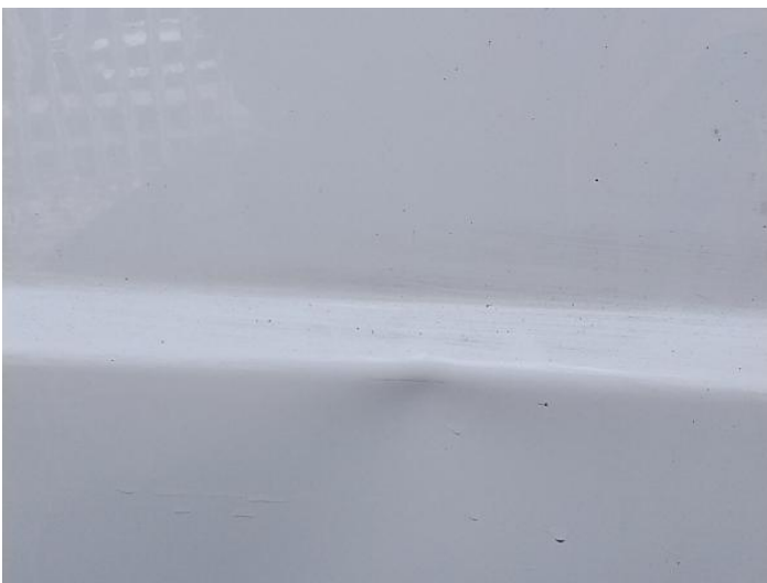
7: Door nsr Dented Over 30mm