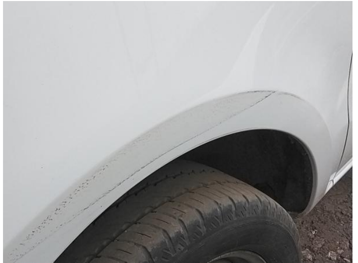
10: Qtr Panel nsr Scratched Over 25mm Thru Paint