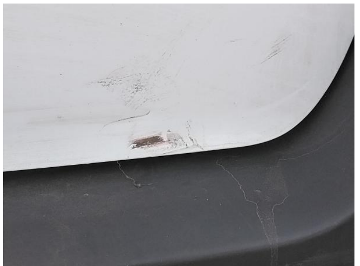
8: Door nsr Scratched Over 25mm Thru Paint