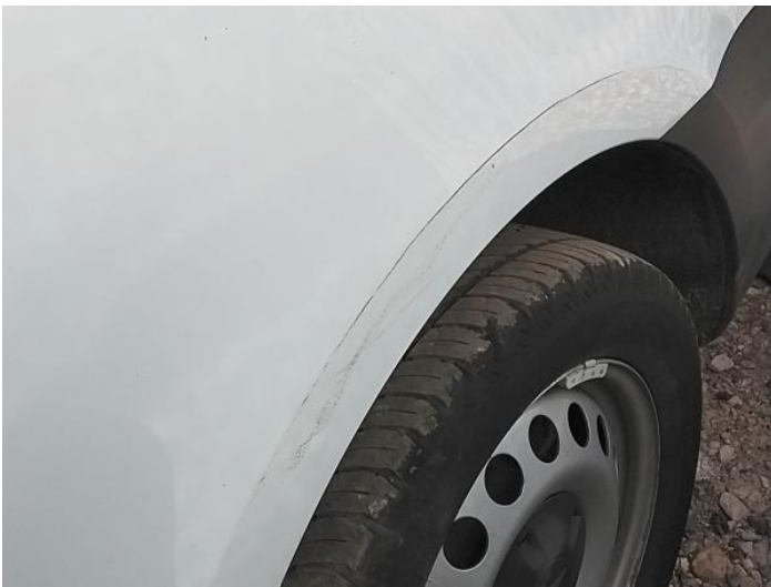
5: Qtr Panel osr Scratched Over 25mm Thru Paint