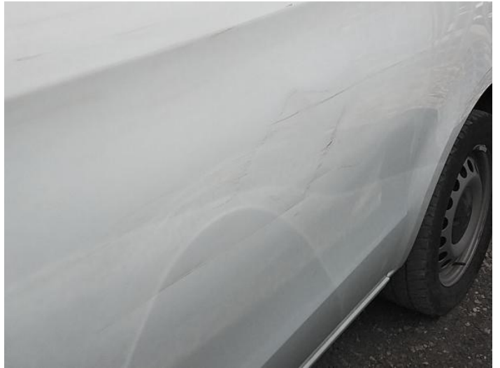
4: Panel Rear Scratched Over 25mm Thru Paint