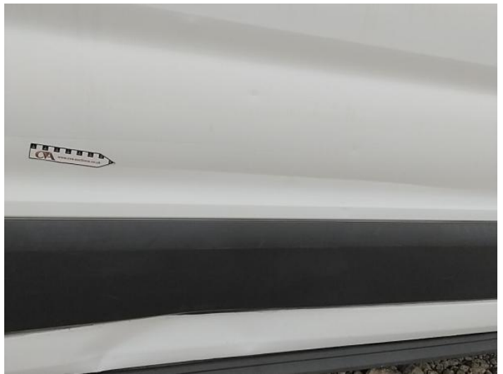
24: Qtr Panel osr Dented Over 30mm