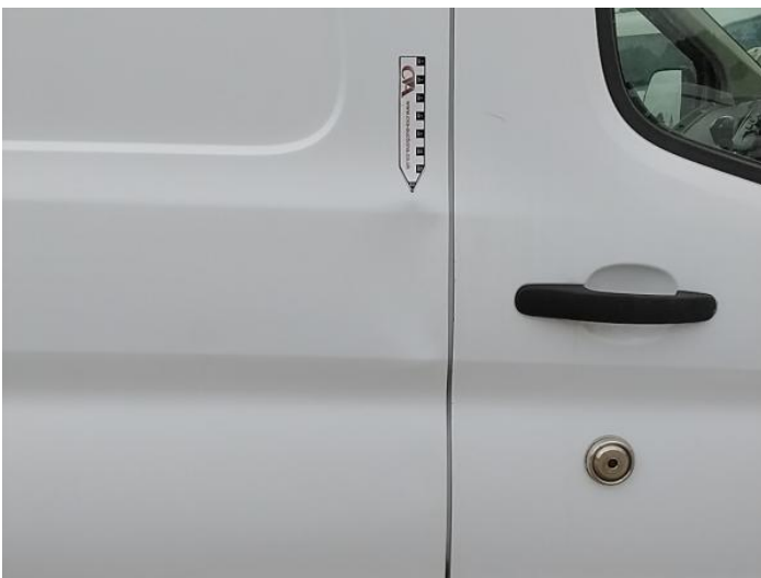
25: Qtr Panel nsr Dented Over 2 UpTo 10mm