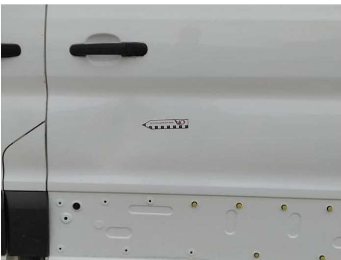
7: Door nsr Dented Between 10mm + 30mm