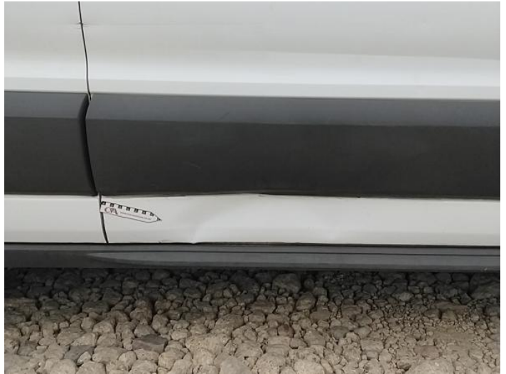
22: Qtr Panel osr Dented Between 10mm + 30mm