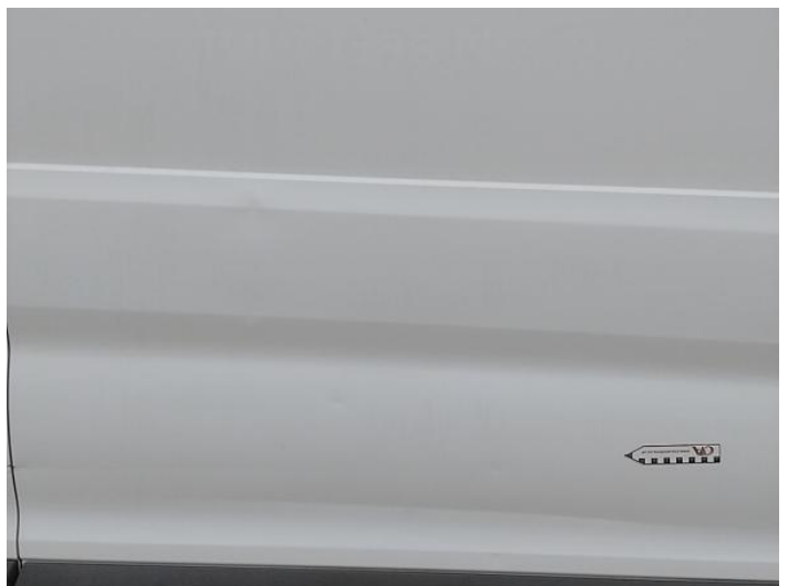
20: Qtr Panel osr Dented Over 2 UpTo 10mm