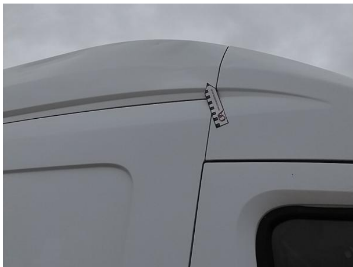
28: Qtr Panel osr Dented Between 10mm + 30mm