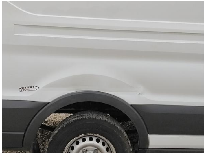
18: Qtr Panel osr Dented With Paint Damage