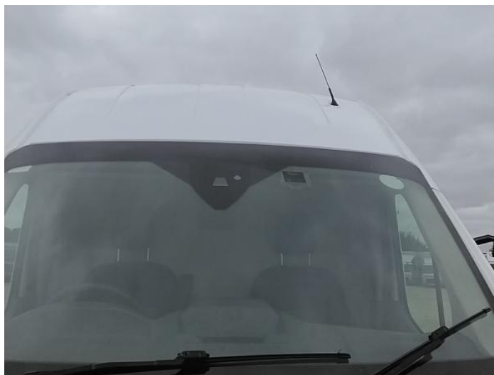
2: Screen Front Cracked Replace