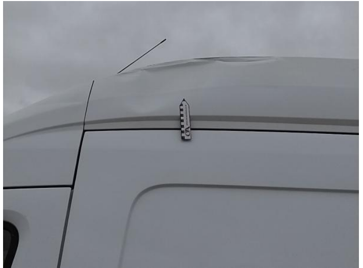
10: Other N/A N/A