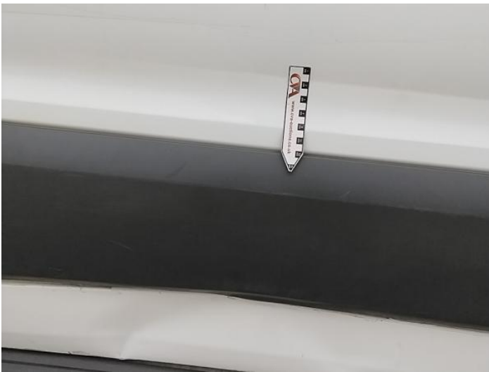
23: Qtr Panel Moulding os Broken Replace