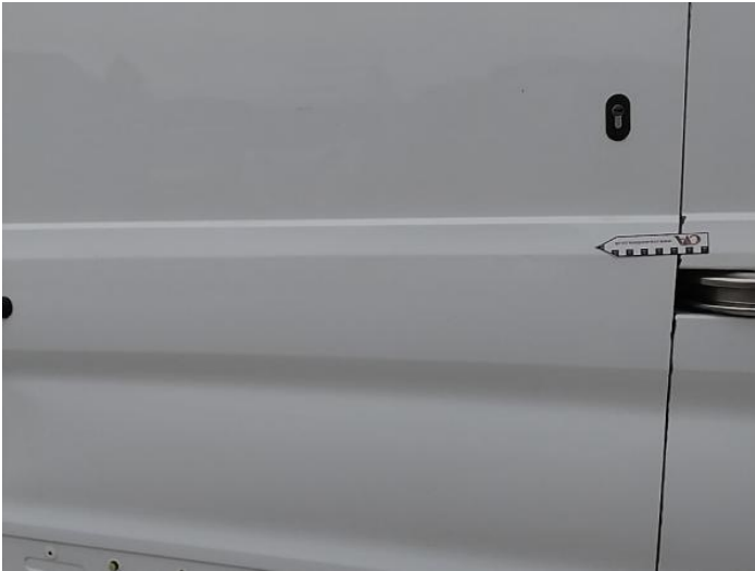
9: Door nsr Dented Between 10mm + 30mm