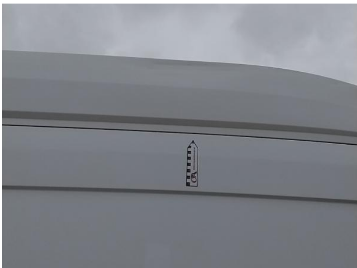
27: Qtr Panel osr Dented Over 30mm