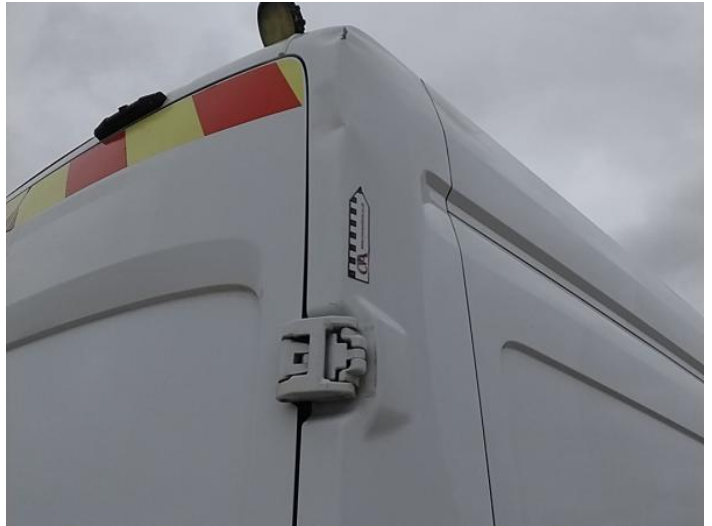
16: Qtr Panel osr Dented With Paint Damage