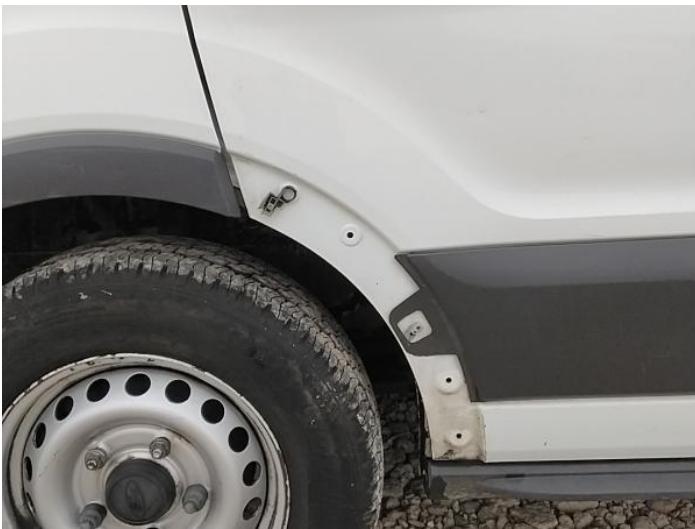
5: Moulding nsf Wing Missing Replace