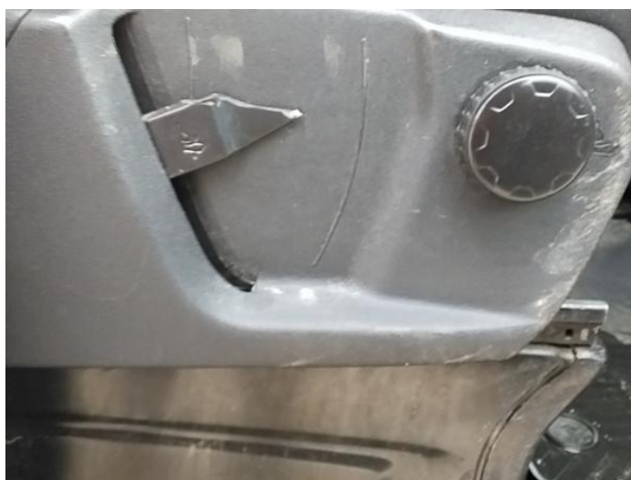
30: Other N/A N/A