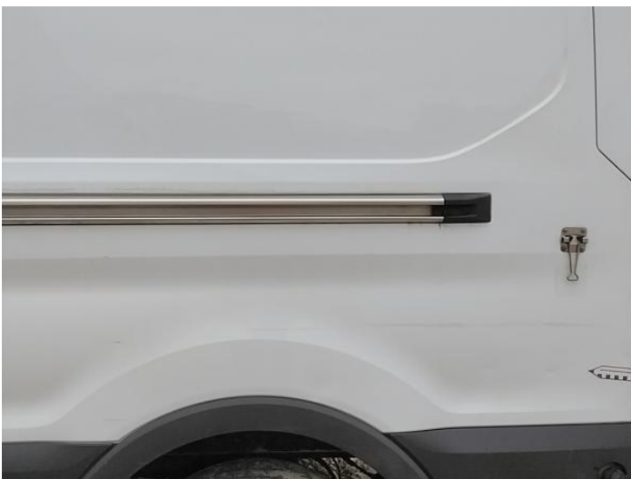
13: Qtr Panel nsr Dented Over 2 UpTo 10mm