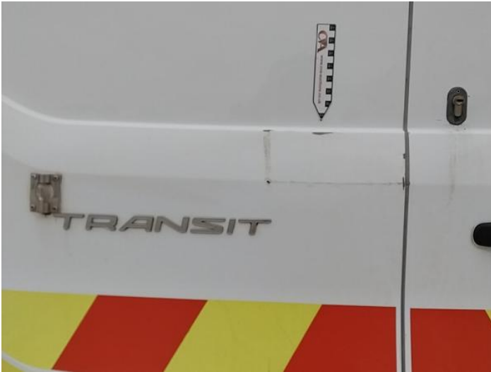
15: Door nsr Scratched UpTo 25mm Thru Paint