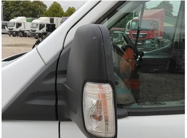
4: Door Mirror Assy nsf Scuffed (Unpainted) UpTo 100mm