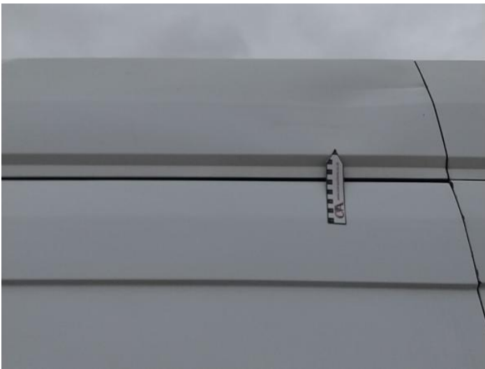
11: Other N/A N/A