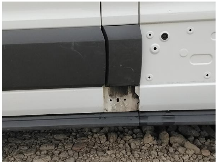
6: Other N/A N/A