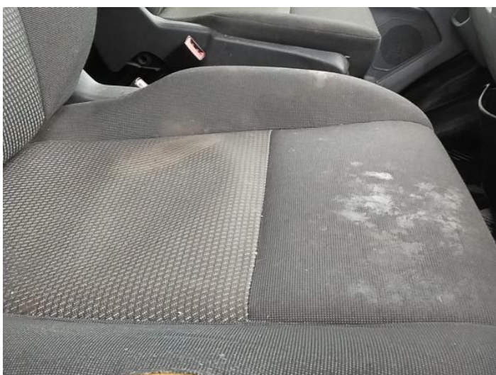
29: Seat Base Cover osf Holed Over 3mm