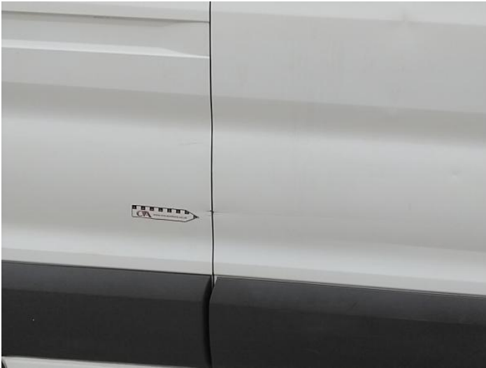
21: Qtr Panel osr Dented With Paint Damage