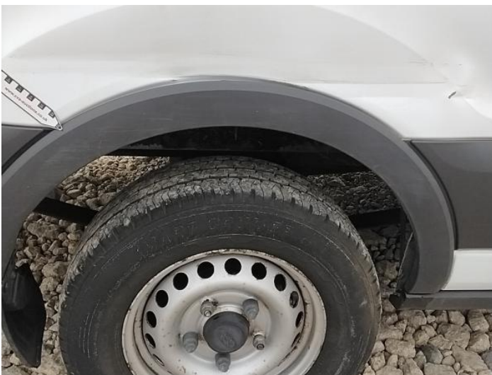
19: Qtr Panel Arch Extension os Scuffed (Unpainted) UpTo 100mm