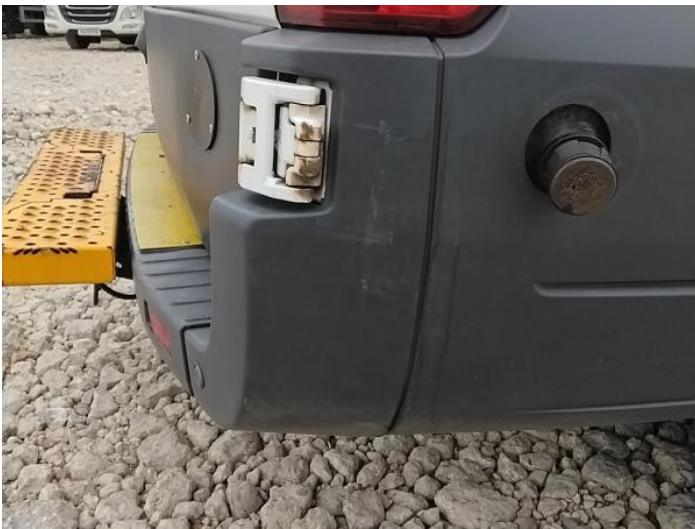
17: Bumper Rear Moulding Scuffed (Unpainted) UpTo 100mm