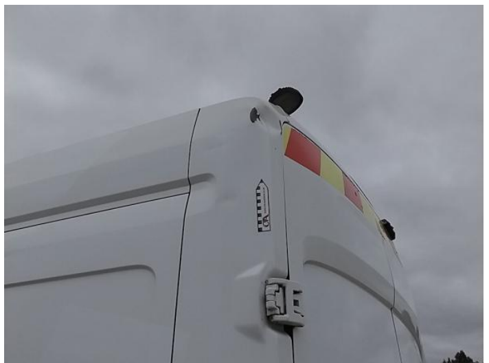
14: Qtr Panel nsr Dented With Paint Damage