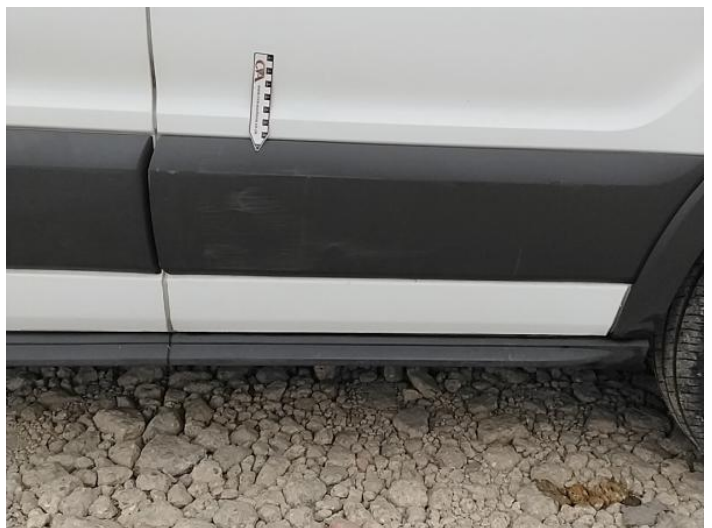
26: Door Moulding osf Scuffed (Unpainted) UpTo 100mm