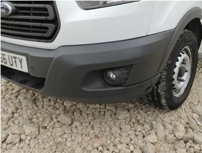
3: Bumper Front Moulding Scuffed (Unpainted) UpTo 100mm