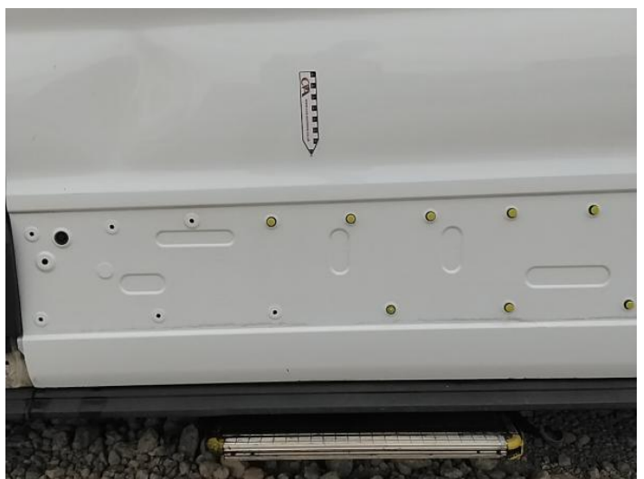
8: Door Moulding nsr Missing Replace