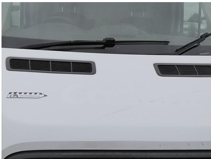
1: Bonnet Scratched Over 25mm Thru Paint