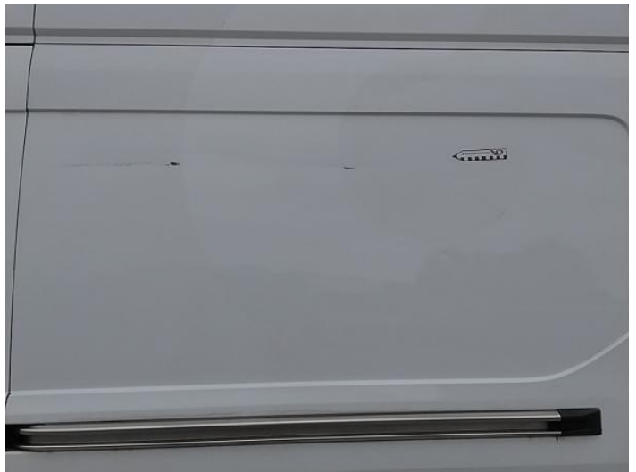
12: Qtr Panel nsr Dented Between 10mm + 30mm