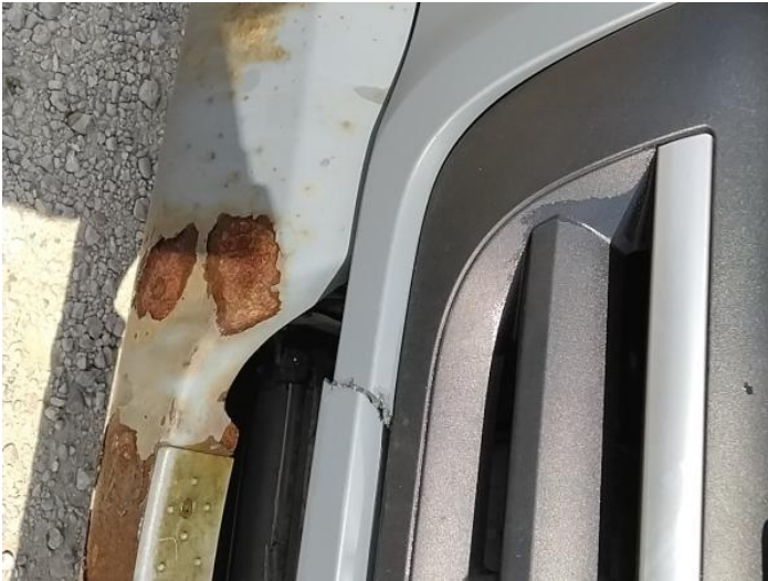
3: Panel Front Cracked Replace