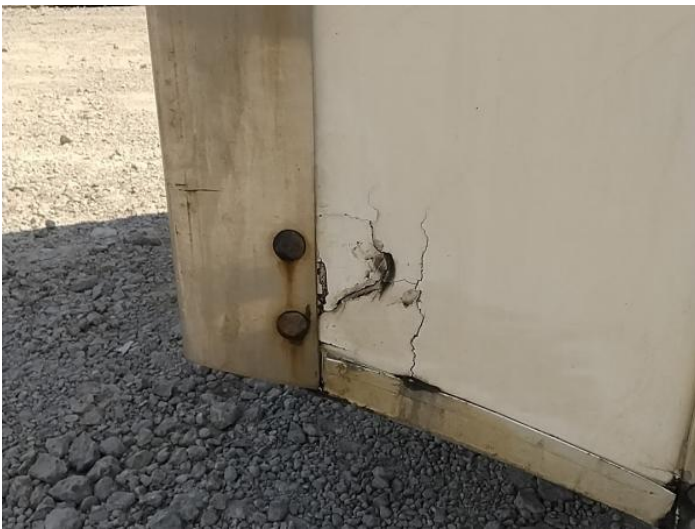
5: Qtr Panel osr Cracked Replace