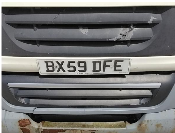
2: Bonnet Cracked Replace