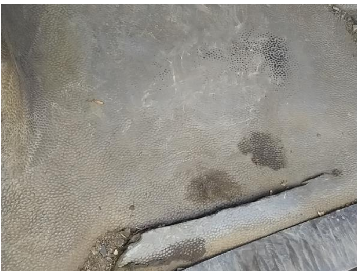
7: Carpets Front Torn Over 10mm