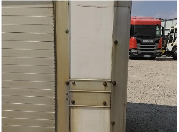
4: Qtr Panel nsr Scratched Over 25mm Thru Paint