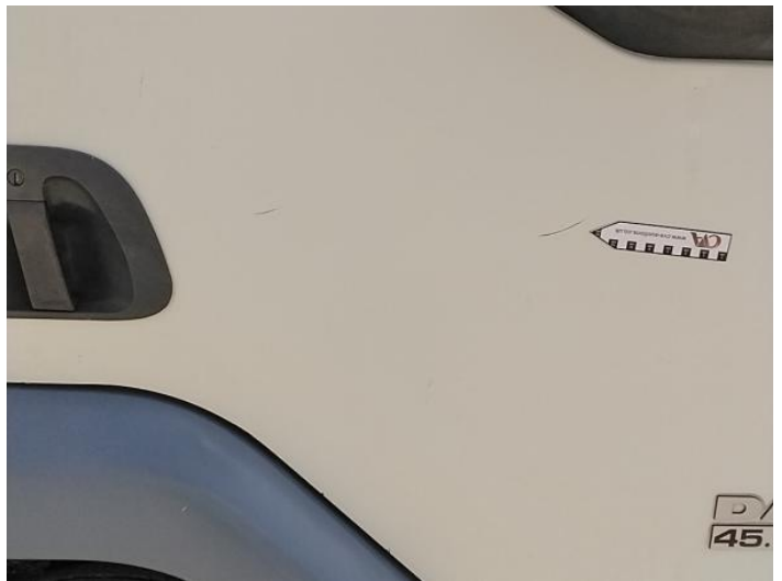
6: Door osf Scratched Over 25mm Not Thru Paint