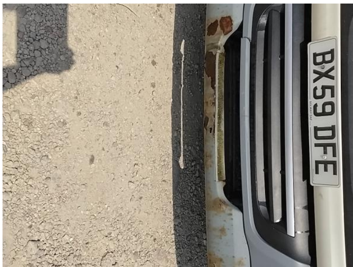
1: Bumper Front Rusted Over 5mm