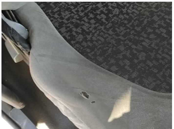
8: Seat Base Cover osf Holed Over 3mm