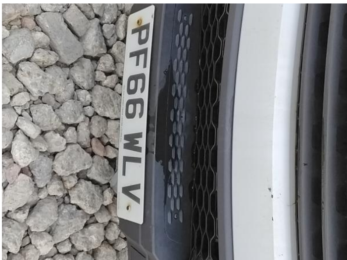
3: Bumper Front Moulding Scratched (Painted) Over 25mm Thru Paint