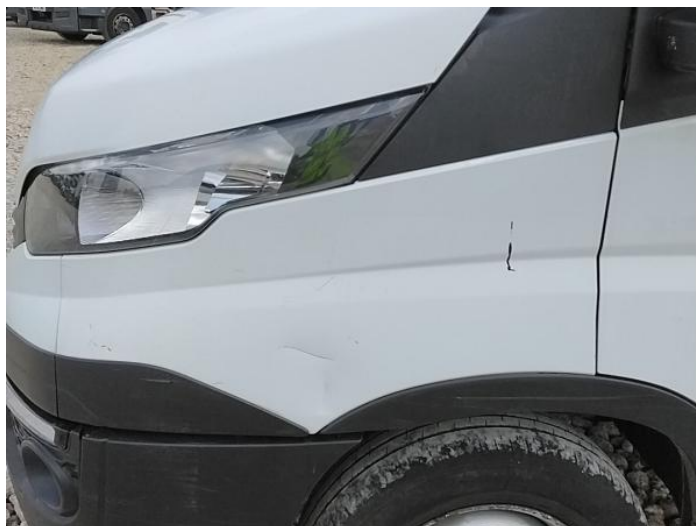
4: Wing nsf Scratched Over 25mm Thru Paint