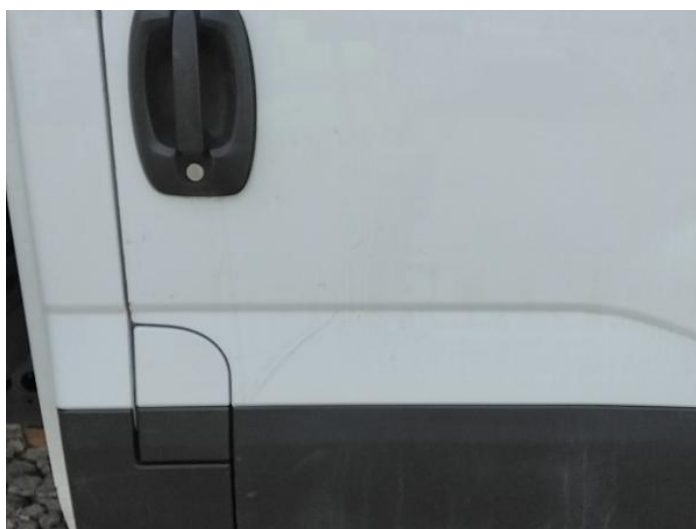
6: Door osf Scratched Over 25mm Thru Paint