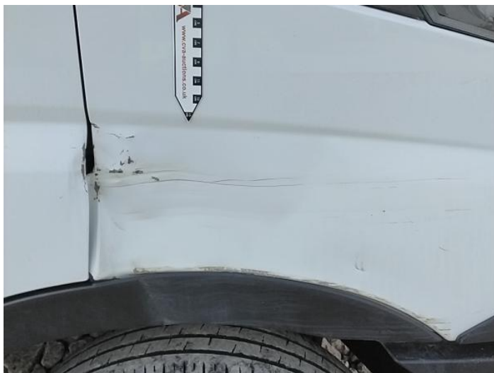
1: Wing osf Dented With Paint Damage