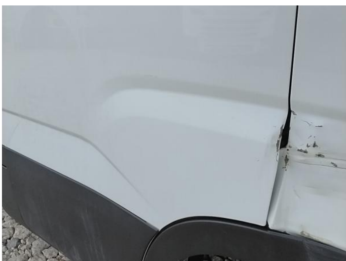
7: Door osf Dented With Paint Damage