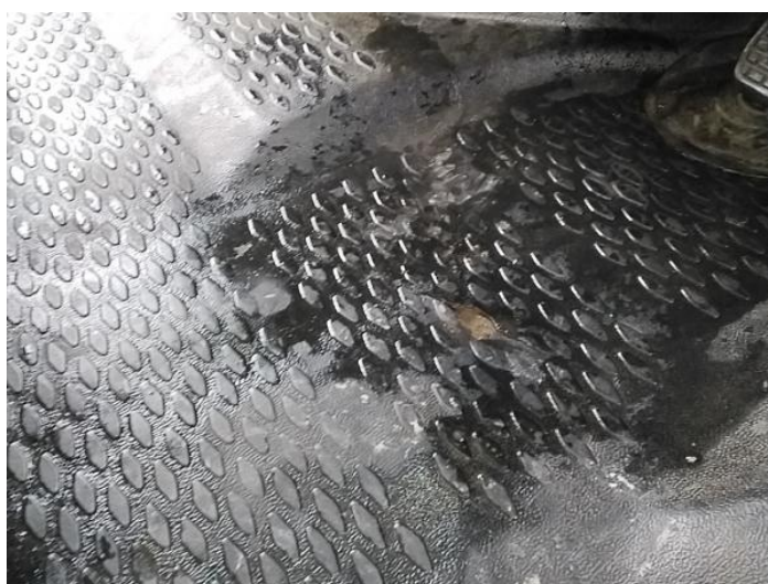
8: Carpets Front Holed Over 3mm