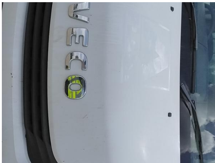
2: Bonnet Chipped Multiple Chips