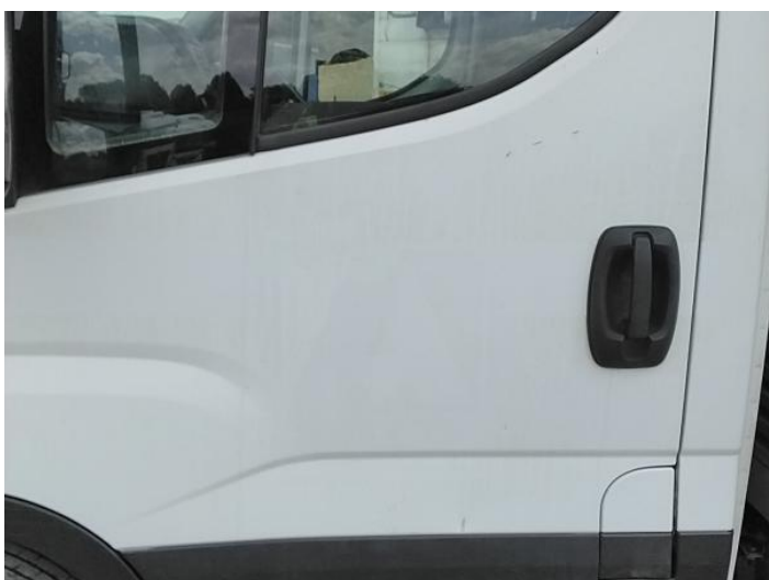
5: Door nsf Scratched Over 25mm Thru Paint