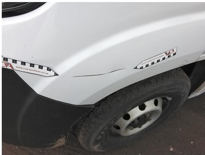
2: Wing nsf Dented Over 30mm