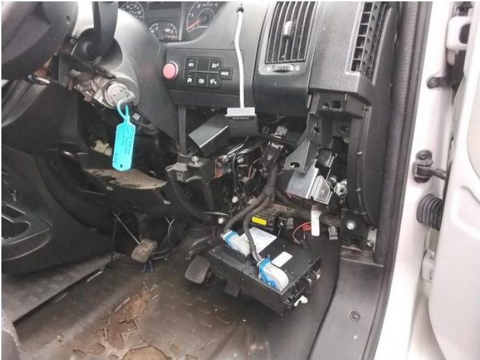
3: Fascia Panel Missing Replace