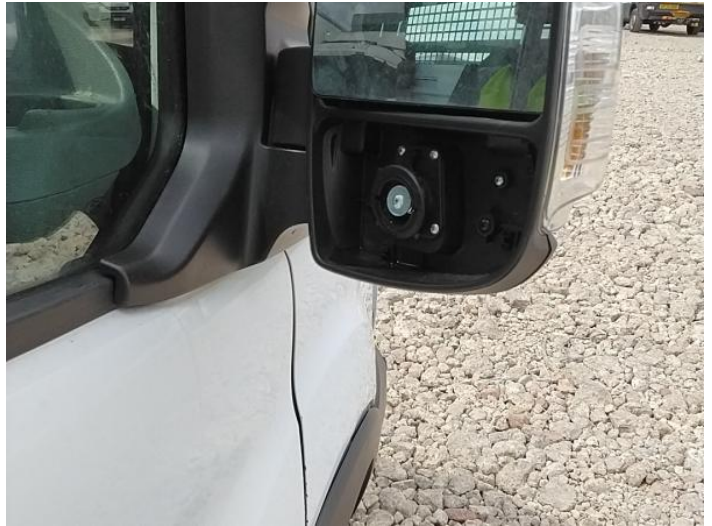
10: Door Mirror Glass os Missing Replace