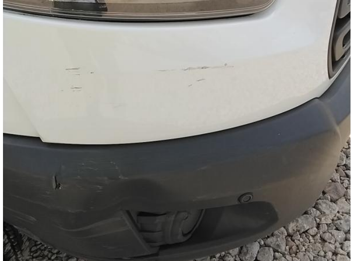
4: Bumper Front Moulding Scratched (Painted) Over 25mm Thru Paint