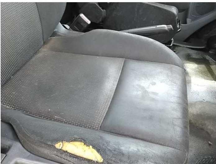
13: Seat Base Cover nsf Holed Over 3mm