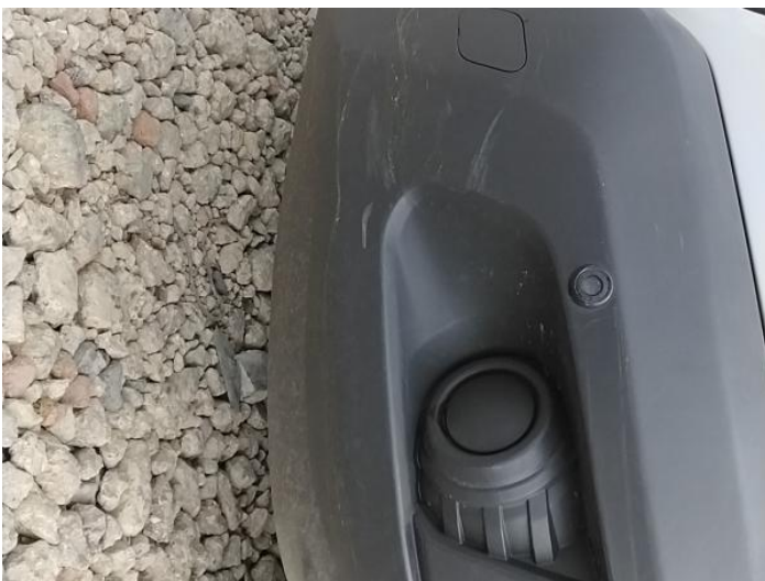
7: Bumper Front Scratched Over 25mm Not Thru Paint