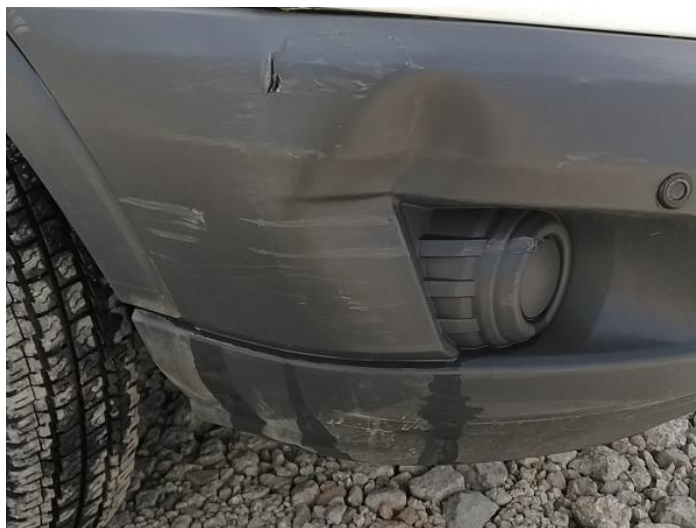
2: Bumper Front Dented Over 30mm