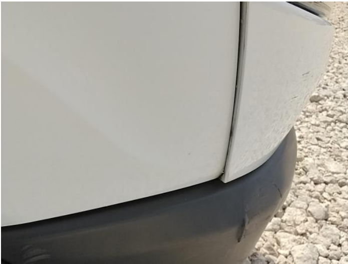
5: Bumper Front Grill Broken Replace