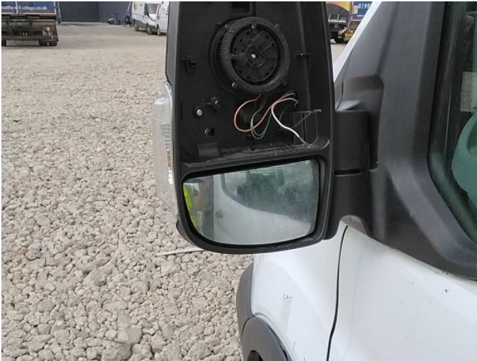
9: Door Mirror Glass ns Missing Replace