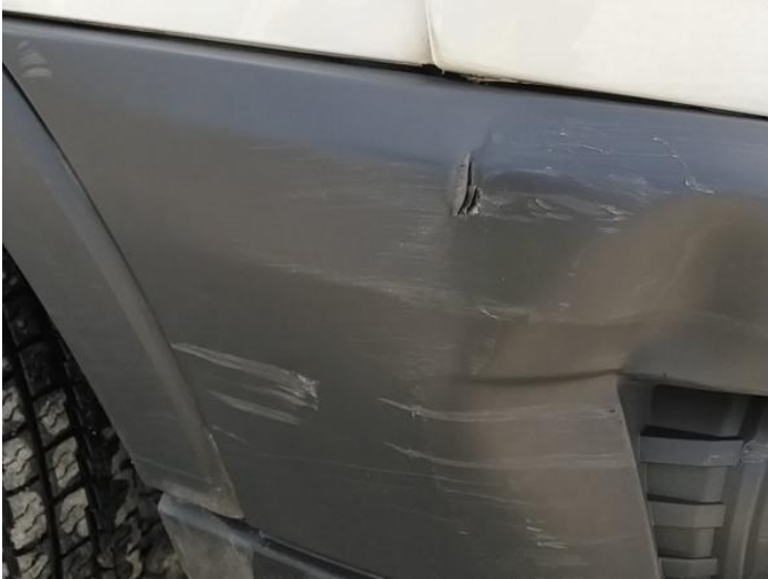
3: Bumper Front Hole Over 25mm