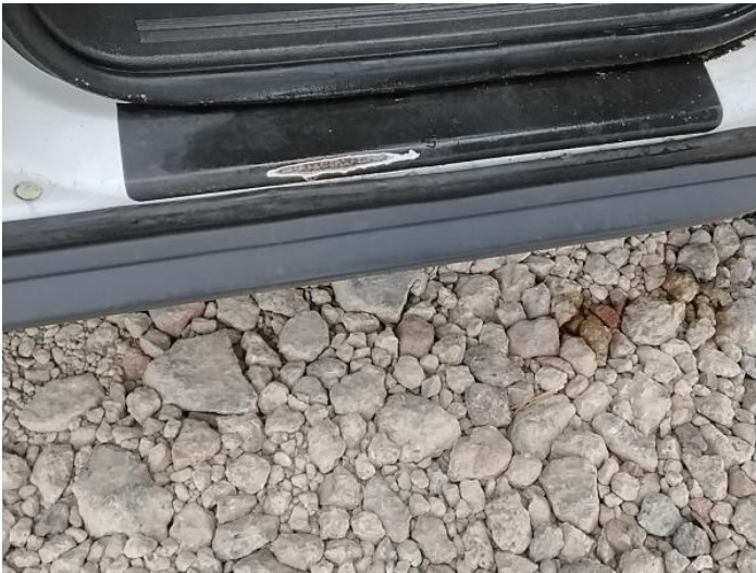
11: Sill os Rusted Over 5mm