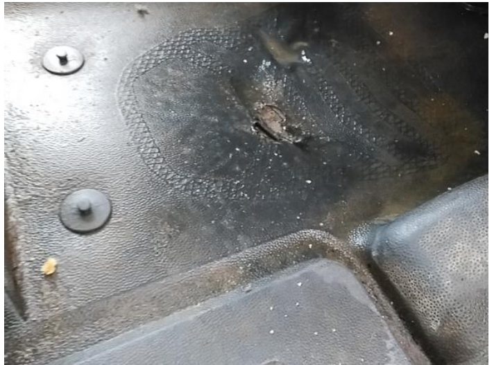
12: Carpets Front Holed Over 3mm