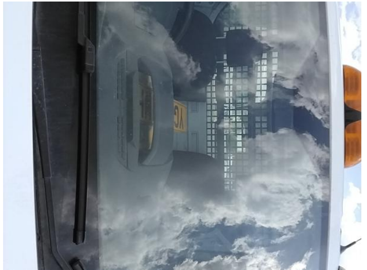
6: Screen Front Chipped UpTo 10mm