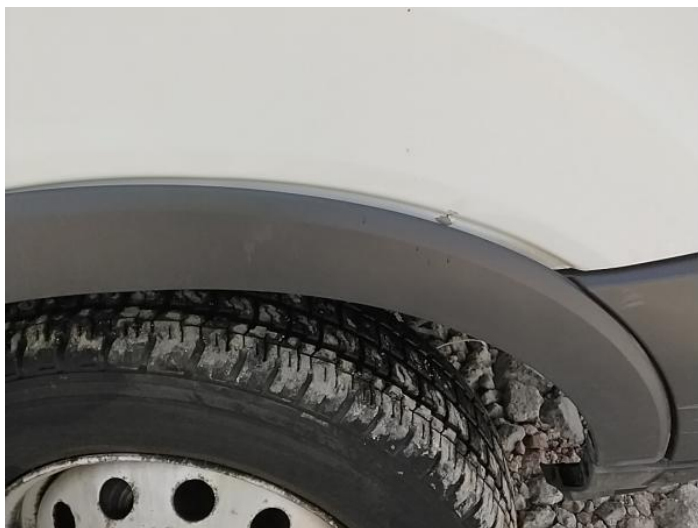
1: Wing of Chipped Over 5mm