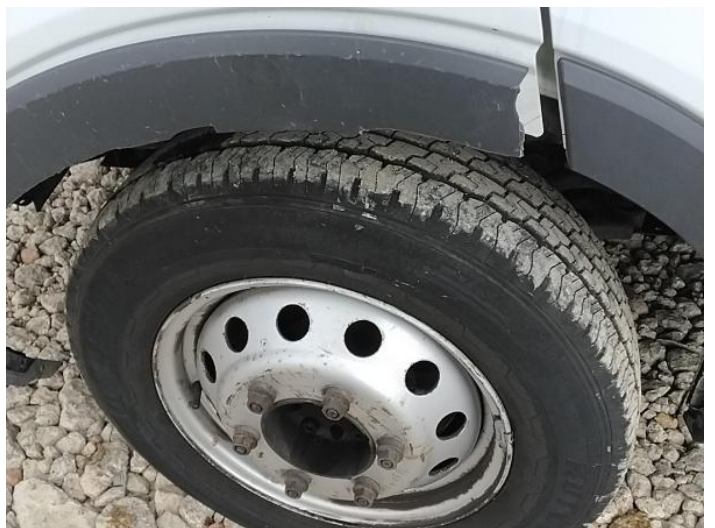
8: Moulding nsf Wing Broken Replace