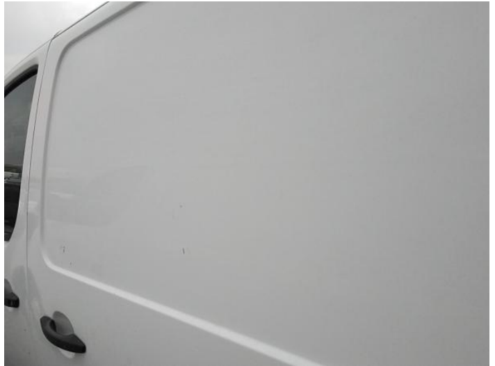
4: Qtr Panel nsr Chipped Multiple Chips