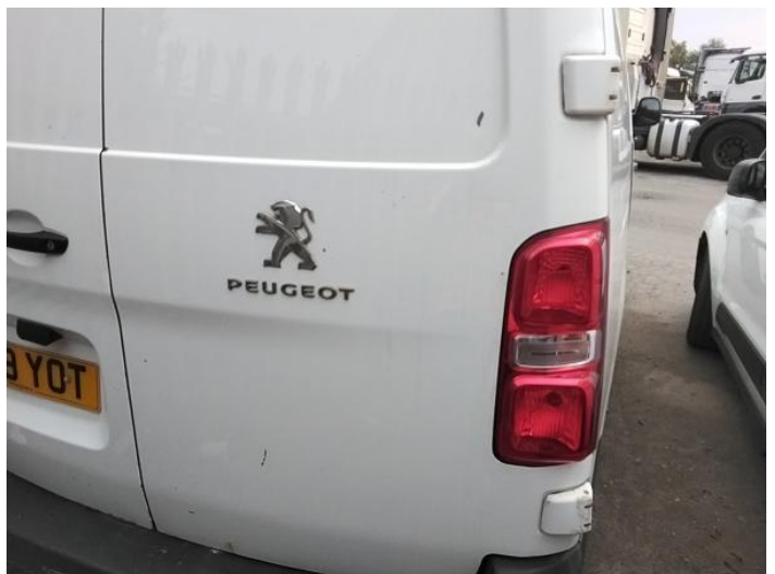
8: Door osr Chipped Multiple Chips