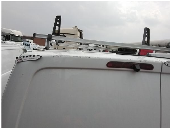
6: Door nsr Scratched Over 25mm Thru Paint