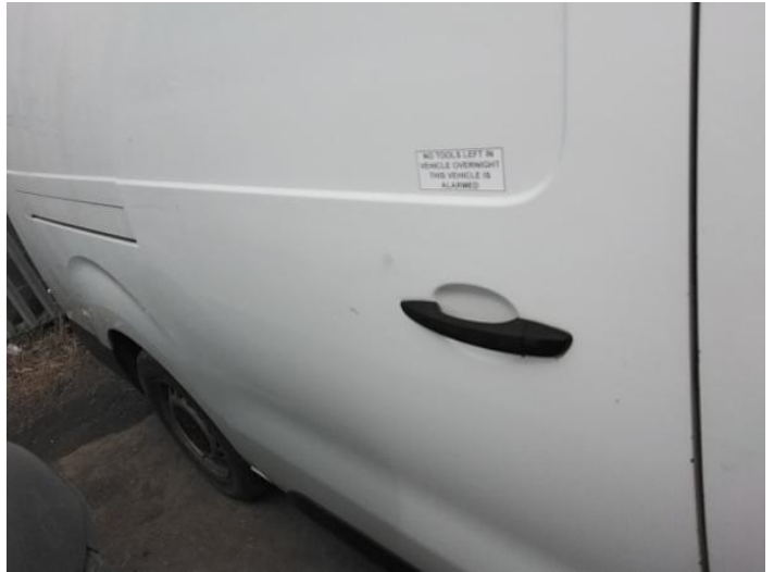
10: Qtr Panel osr Chipped Multiple Chips