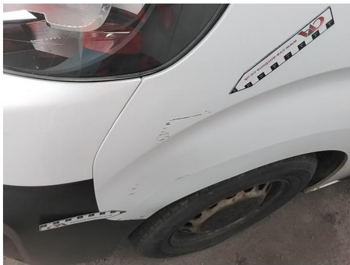
2: Wing nsf Dented With Paint Damage