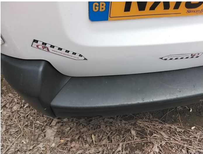
5: Door nsr Dented Over 30mm