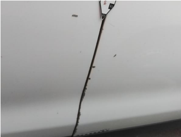
3: Qtr Panel nsr Scratched Over 25mm Thru Paint