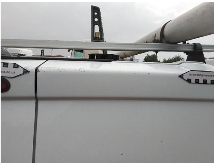
7: Door osr Scratched Over 25mm Thru Paint