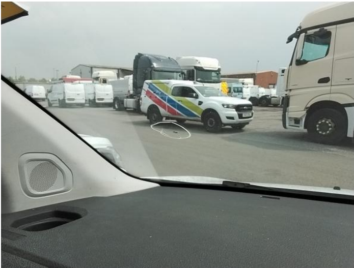
11: Screen Front Chipped Over 10mm