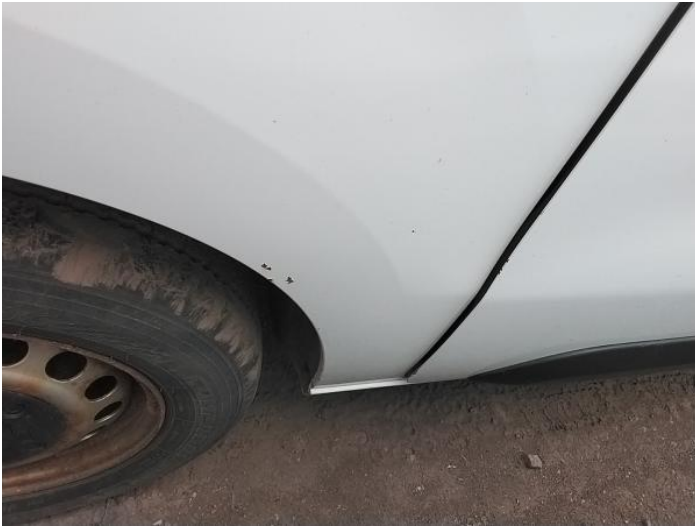
9: Qtr Panel osr Chipped Multiple Chips