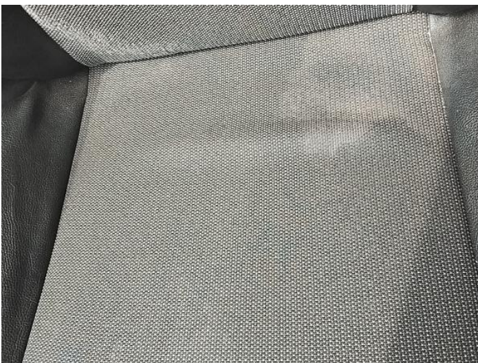
13: Seat Base Cover osf Soiled Heavy