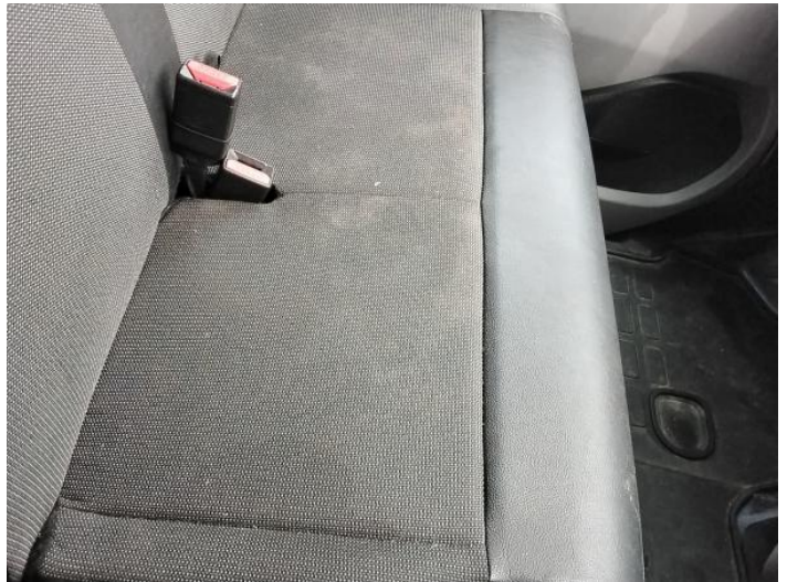
12: Seat Base Cover nsf Soiled Heavy