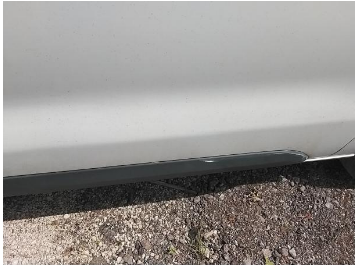
4: Qtr Panel nsr Chipped Multiple Chips