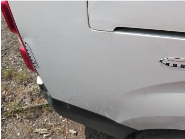
10: Qtr Panel osr Scratched Over 25mm Thru Paint