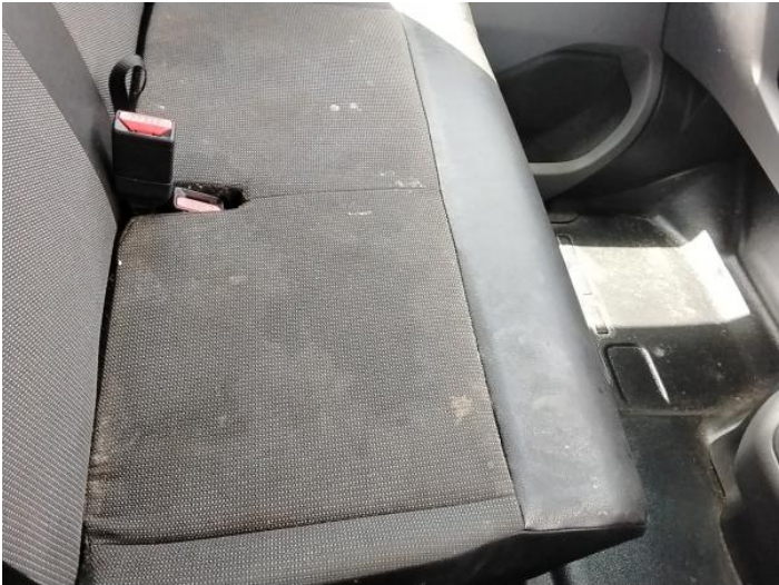
9: Seat Base Cover nsf Soiled Heavy