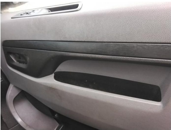
7: Door Pad osf Soiled Heavy