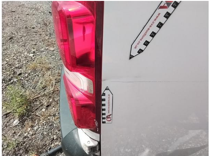
6: Qtr Panel osr Dented With Paint Damage