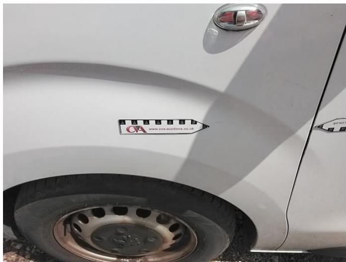
2: Wings Scratched Over 25mm Not Thru Paint