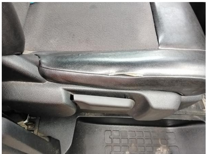
8: Seat Base Cover osf Torn Over 3mm