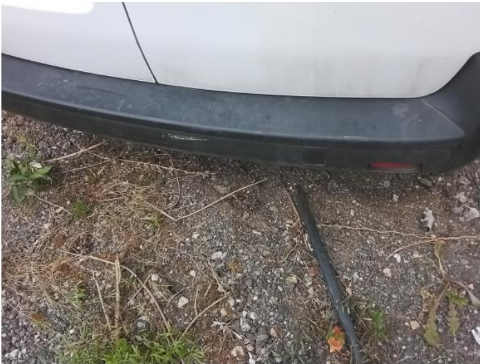
5: Bumper Rear Scratched Over 25mm Not Thru Paint