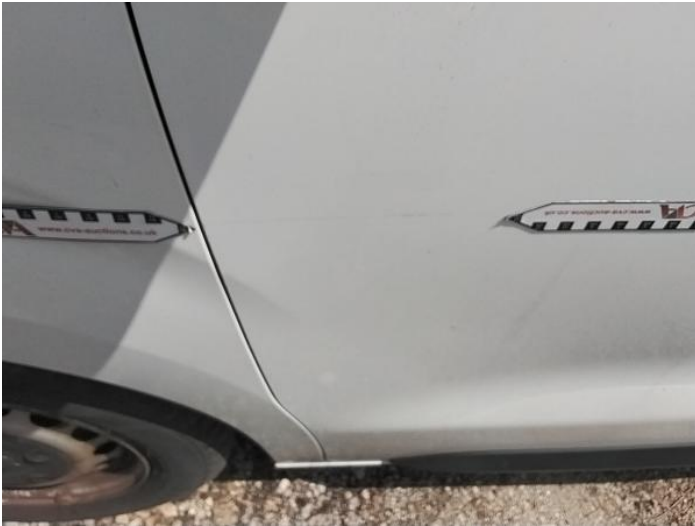
3: Door nsf Scratched Over 25mm Not Thru Paint