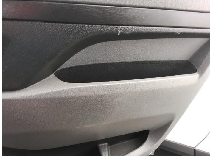
4: Door Pad osf Soiled Heavy