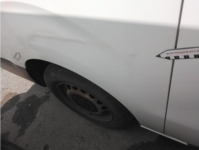
3: Qtr Panel osr Dented Over 30mm