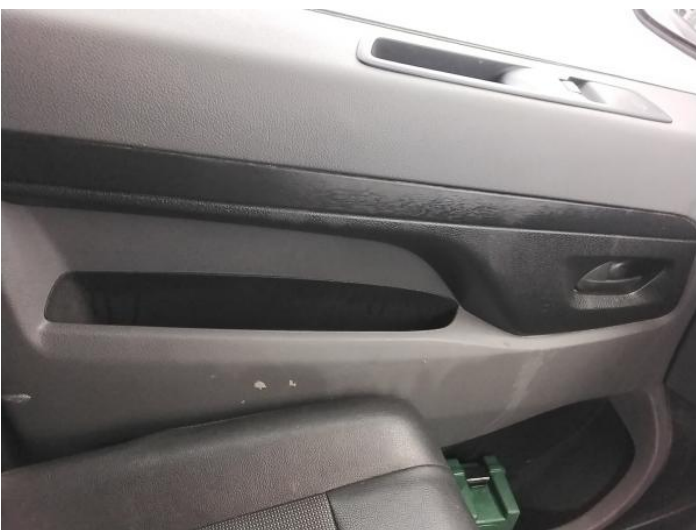
7: Door Pad nsf Soiled Heavy