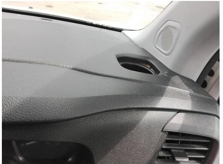
6: Fascia Panel Soiled Heavy