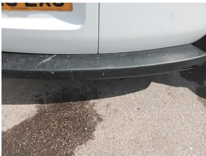
1: Bumper Rear Chipped Multiple Chips