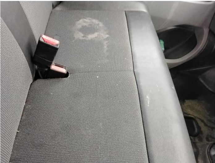
5: Seat Base Cover nsf Soiled Heavy