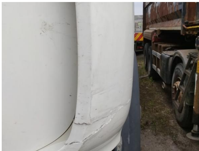
2: Grille Front Broken Replace