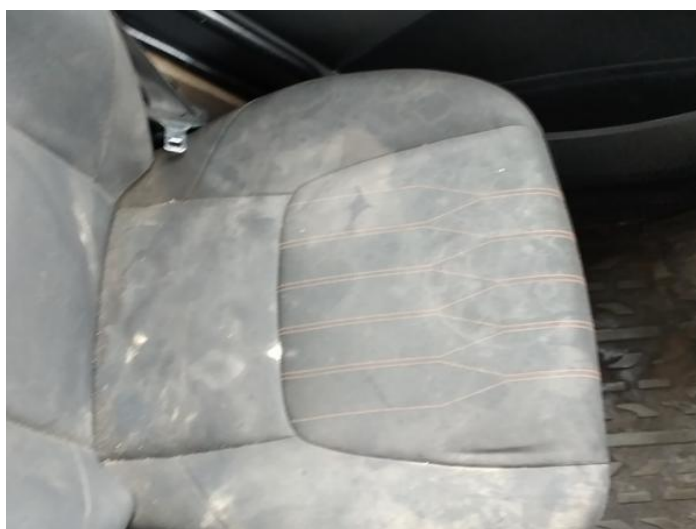
6: Seat Base Cover osf Soiled Heavy