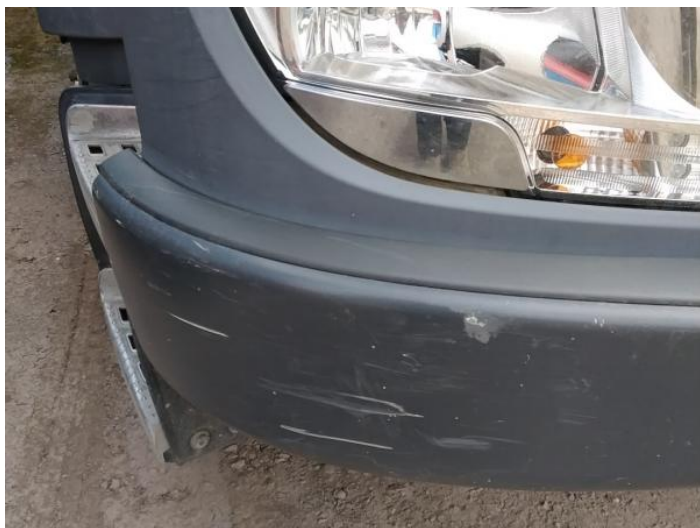
1: Bumper Front Moulding Scuffed (Unpainted) Over 100mm