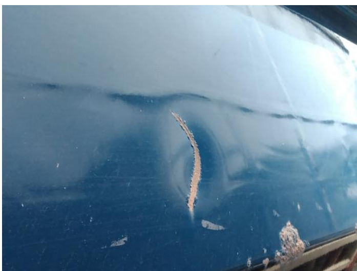
5: Panel Rear Dented With Paint Damage