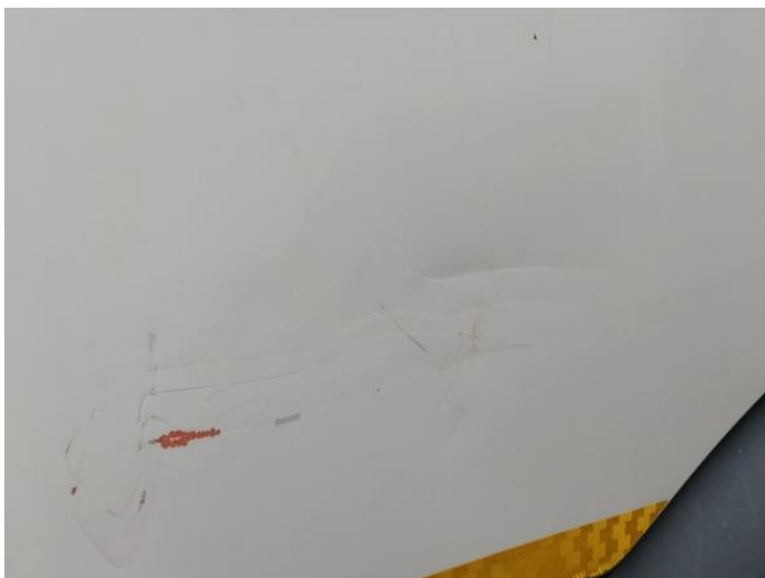
3: Door osf Scratched Over 25mm Thru Paint