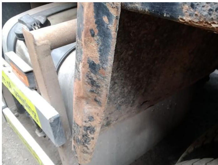
4: Panel Rear Dented Over 30mm