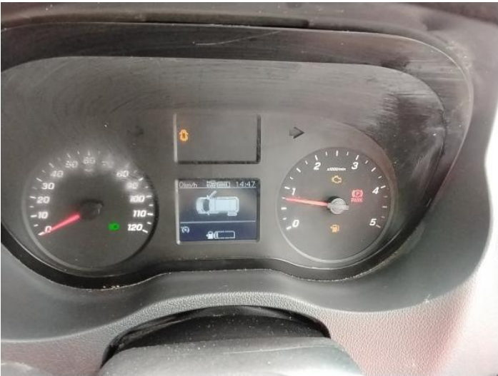
30: Dash Warning Lights Displayed No Action