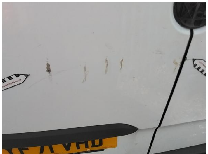
14: Door nsr Scratched Over 25mm Thru Paint