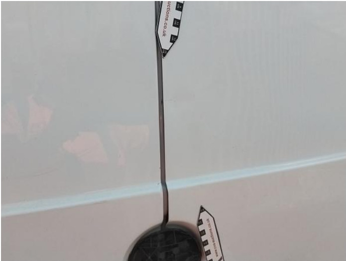
15: Door osr Dented Over 30mm