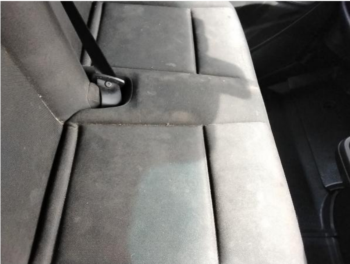
28: Seat Base Cover nsf Soiled Heavy