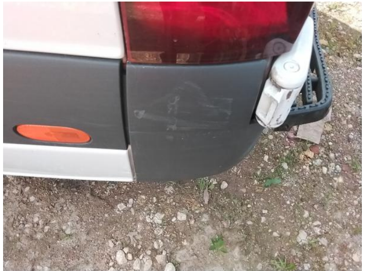
12: Bumper Rear Moulding Scuffed (Unpainted) Over 100mm