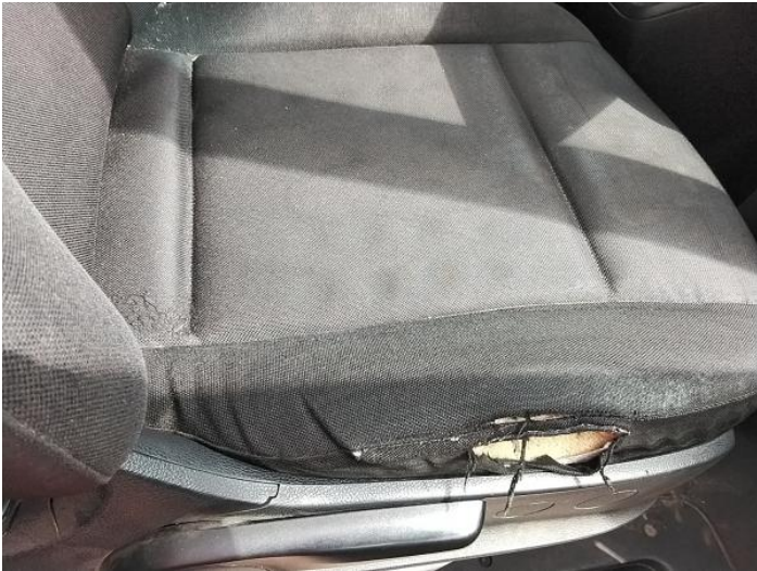
27: Seat Base Cover osf Torn Over 3mm