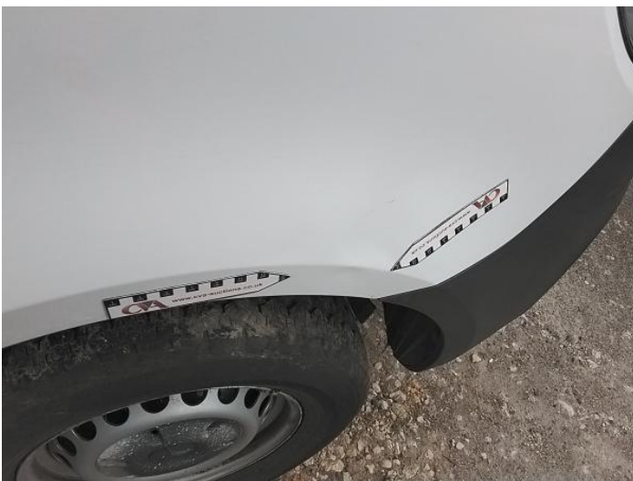
25: Wing osf Dented Over 30mm