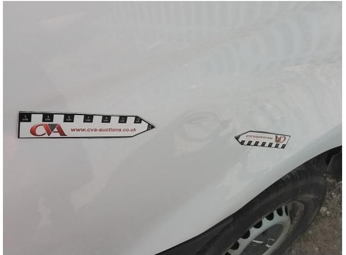
10: Qtr Panel nsr Dented Over 30mm