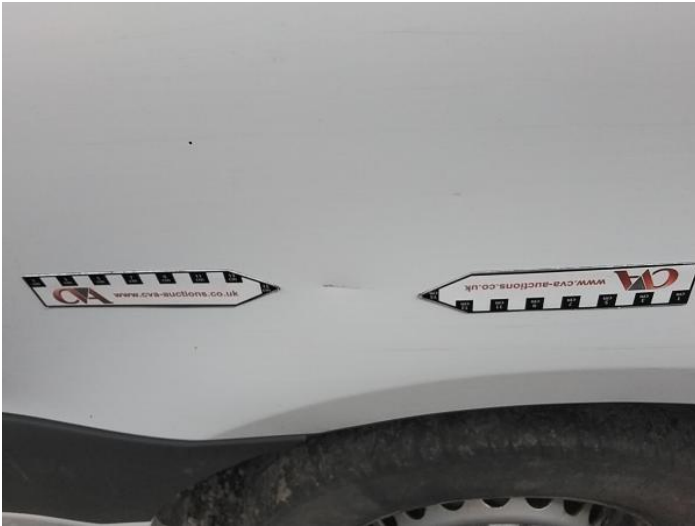
21: Qtr Panel osr Dented Over 30mm