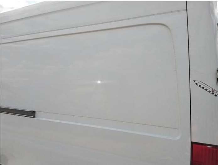
9: Qtr Panel nsr Scratched Over 25mm Thru Paint