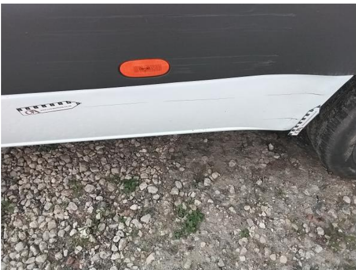
7: Qtr Panel nsr Dented Over 30mm