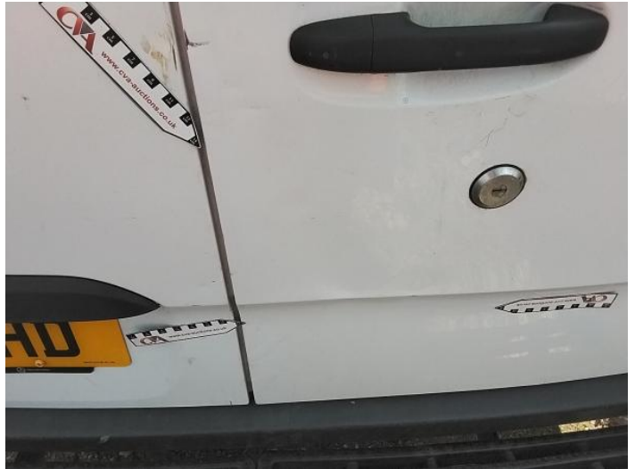
16: Door osr Dented Over 30mm