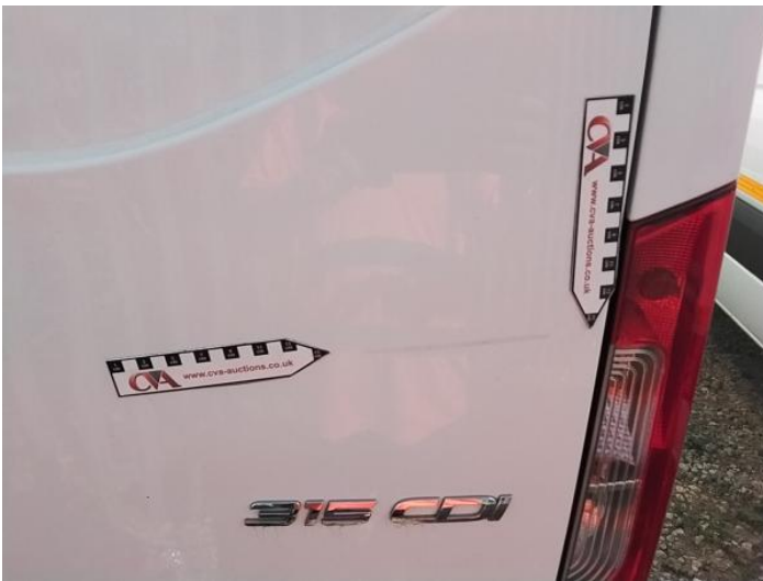
17: Door osr Scratched Over 25mm Not Thru Paint