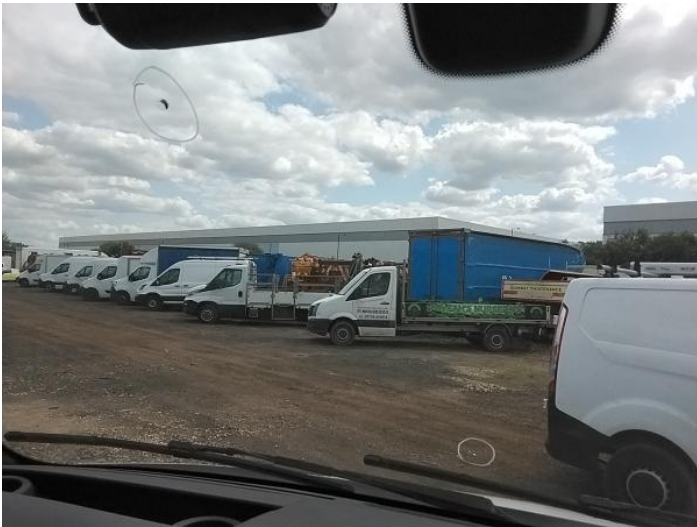
29: Screen Front Chipped Over 10mm