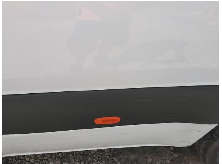
6: Qtr Panel Moulding ns Scuffed (Unpainted) Over 100mm