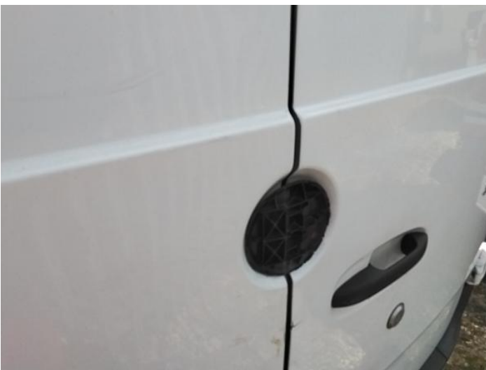
13: Badgedecal Rear Broken Replace