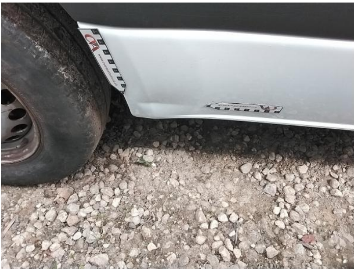
23: Qtr Panel osr Dented Over 30mm