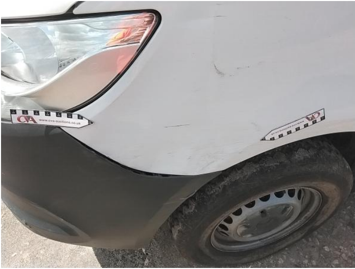
3: Wing nsf Dented Over 30mm