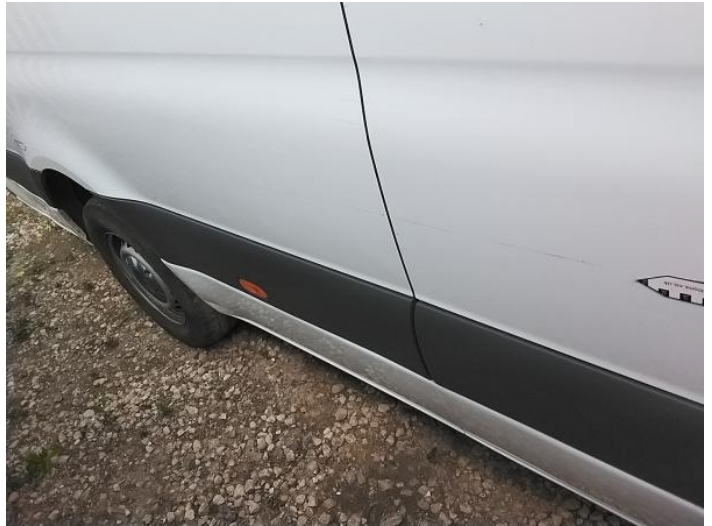
22: Qtr Panel osr Scratched Over 25mm Thru Paint