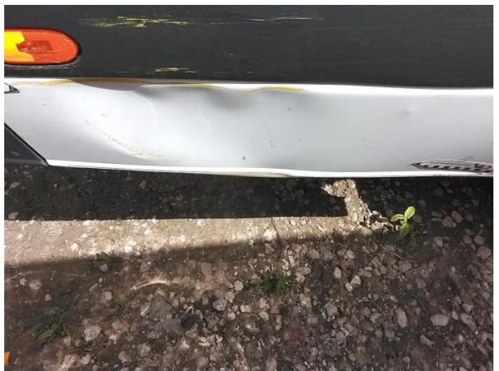
20: Qtr Panel osr Dented Over 30mm