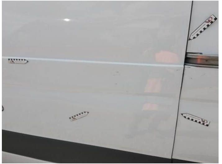
4: Qtr Panel nsr Dented Over 30mm