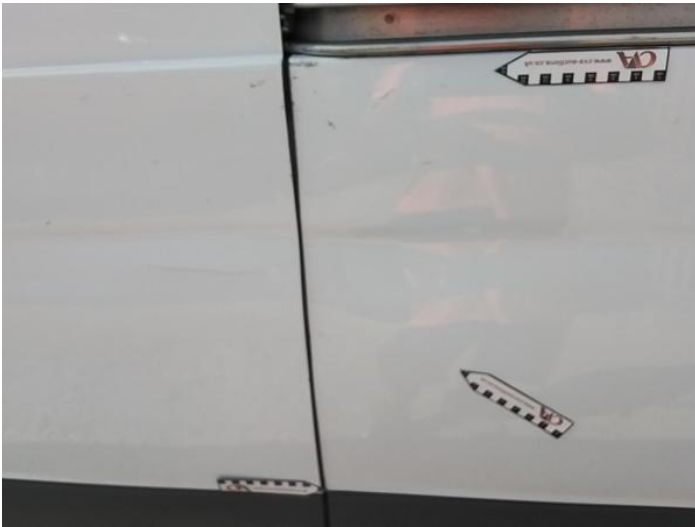
5: Qtr Panel nsr Dented Over 30mm