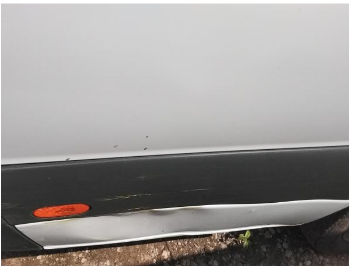
19: Qtr Panel Moulding os Scuffed (Unpainted) Over 100mm