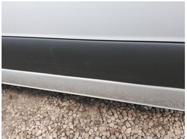
24: Qtr Panel Moulding os Scuffed (Unpainted) Over 100mm