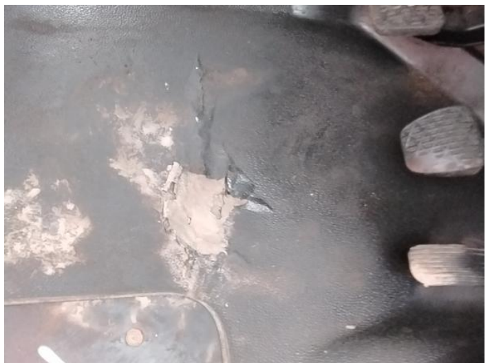
26: Carpets Front Holed Over 3mm