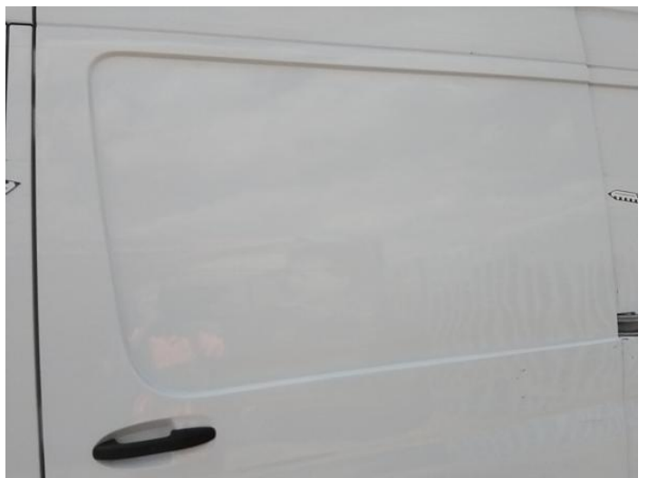
8: Qtr Panel nsr Scratched Over 25mm Thru Paint