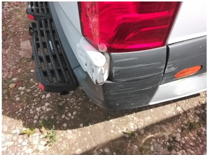
18: Bumper Rear Moulding Scuffed (Unpainted) Over 100mm