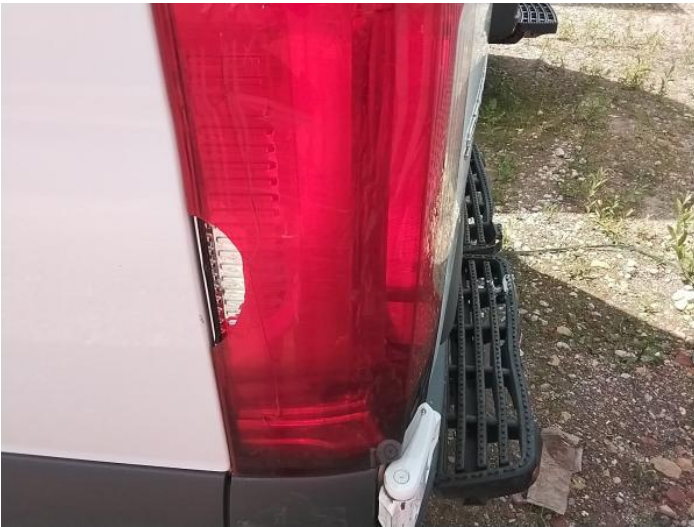
11: Lamp nsr Broken Replace