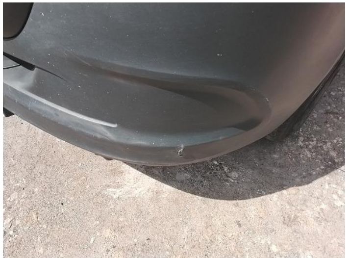
2: Bumper Front Cracked Over 25mm