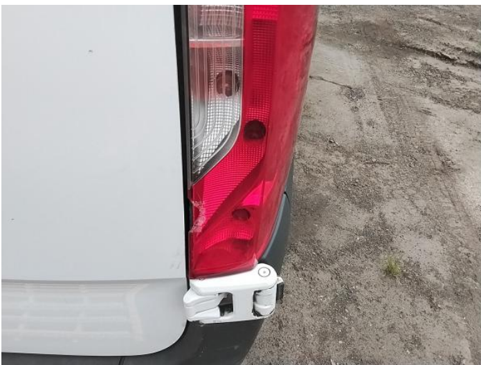
19: Lamp osr Broken Replace