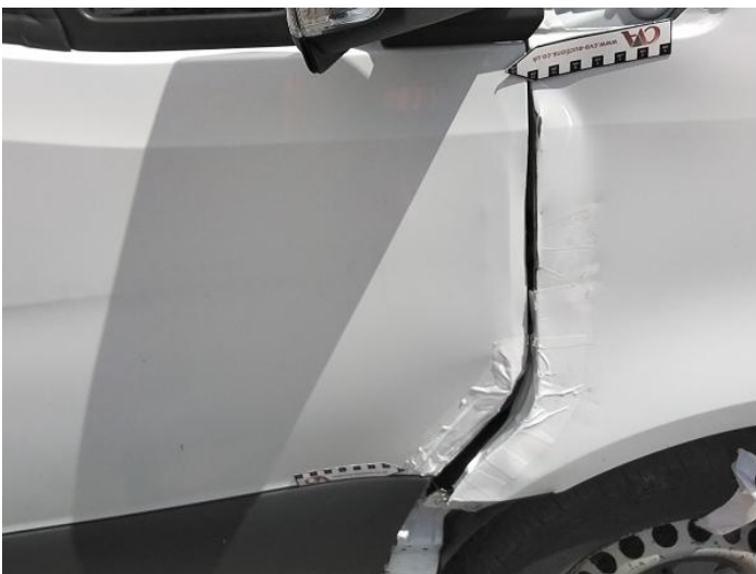
25: Door osf Dented Over 30mm