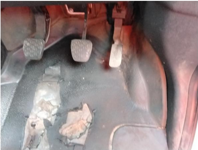
29: Carpets Front Holed Over 3mm