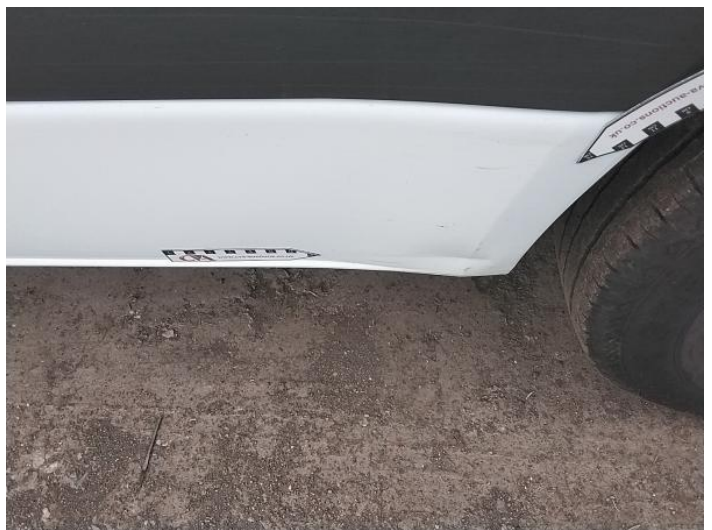
8: Qtr Panel nsr Dented Over 30mm