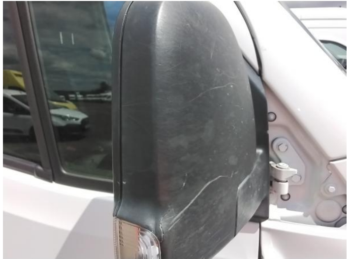
28: Door Mirror Assy osf Broken Replace