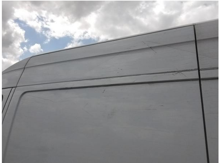
10: Qtr Panel nsr Scratched Over 25mm Thru Paint