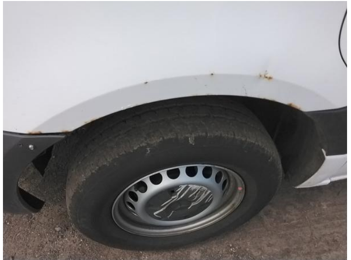
4: Wing nsf Rusted Over 5mm