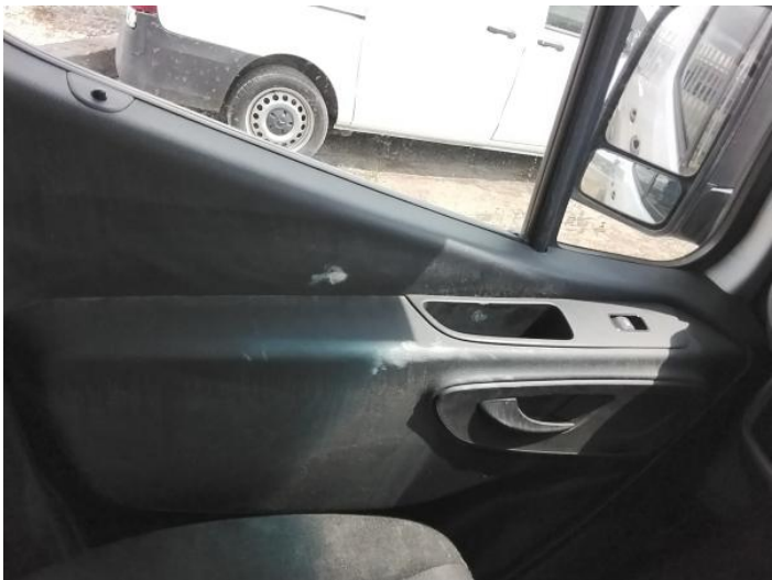
34: Door Pad nsf Soiled Heavy