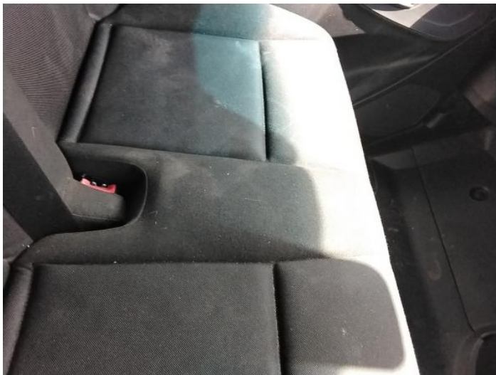
35: Seat Base Cover nsf Soiled Heavy