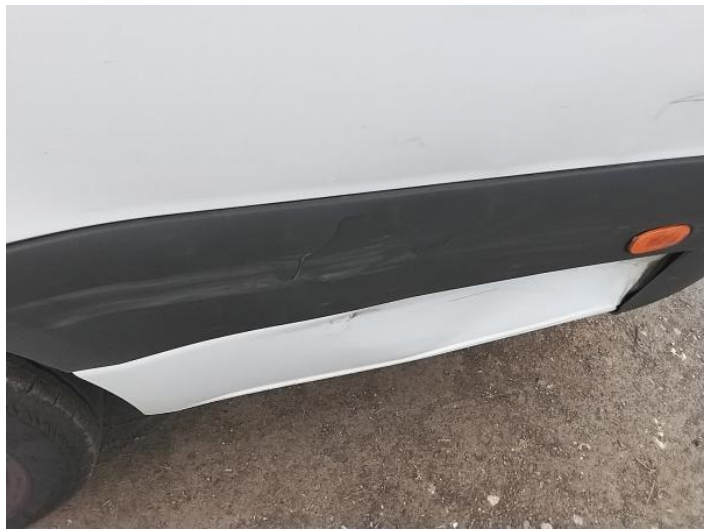
12: Qtr Panel Moulding ns Broken Replace