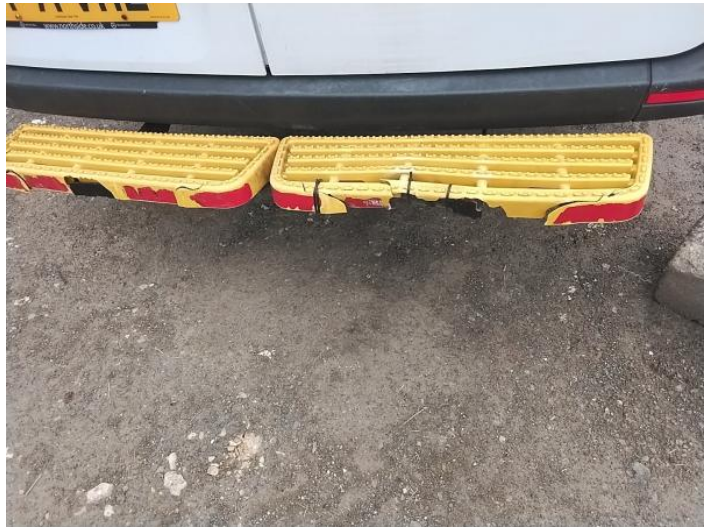
18: Bumper Rear Moulding Broken Replace