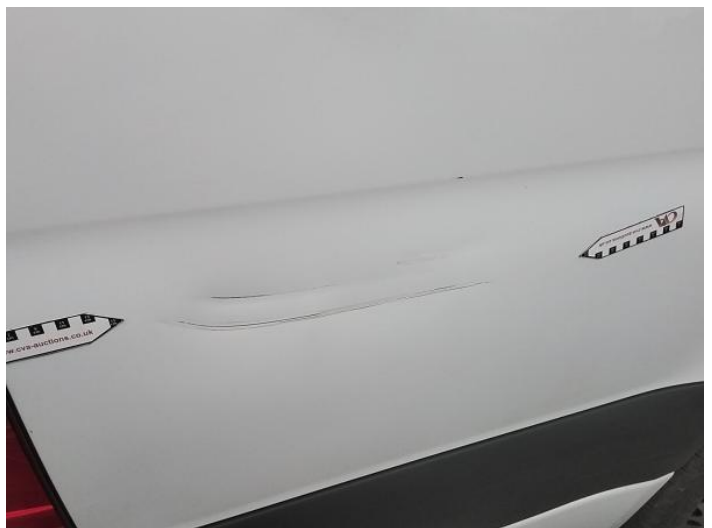
20: Qtr Panel osr Dented Over 30mm