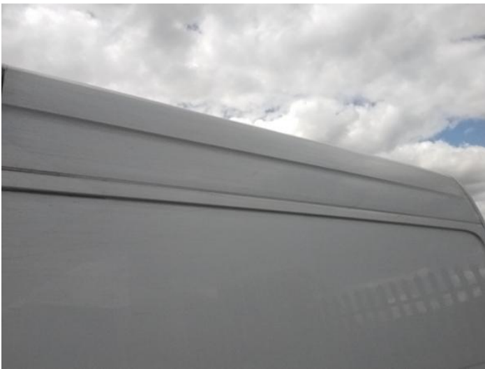
11: Qtr Panel nsr Scratched Over 25mm Thru Paint