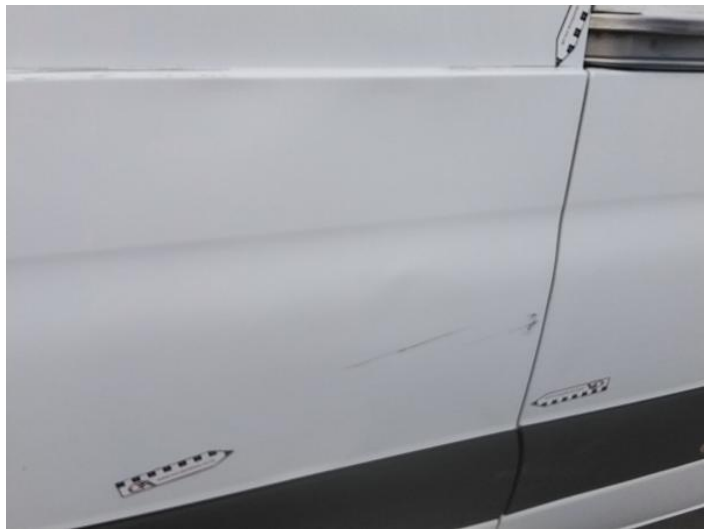
6: Qtr Panel nsr Dented Over 30mm