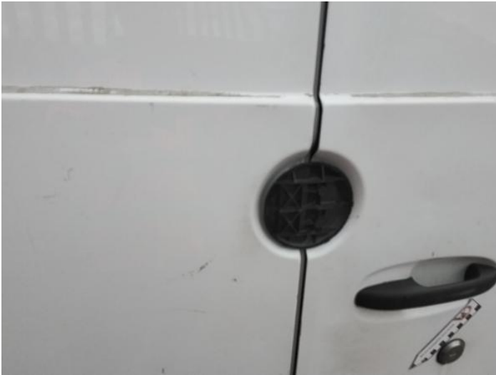
15: Badgedecal Rear Broken Replace