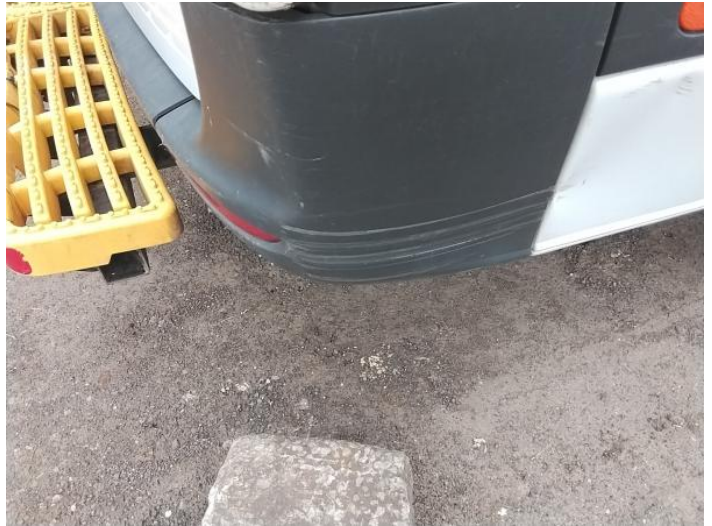
22: Bumper Rear Moulding Scuffed (Unpainted) Over 100mm