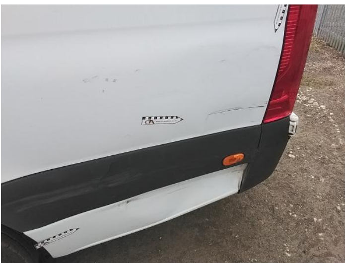
13: Qtr Panel nsr Dented Over 30mm