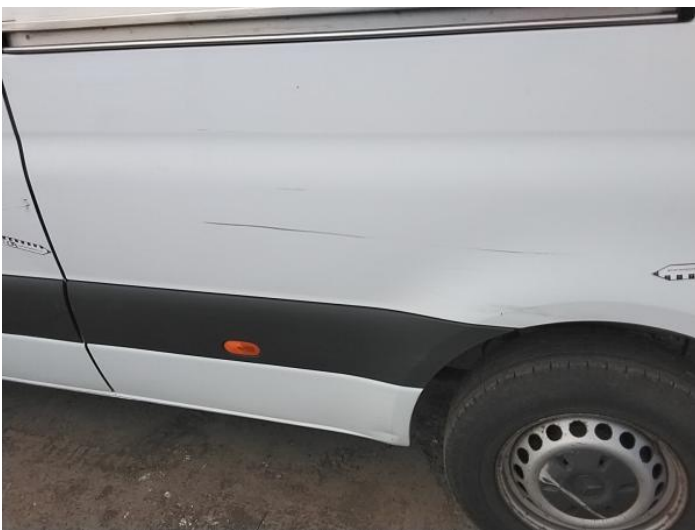
7: Qtr Panel nsr Scratched Over 25mm Thru Paint