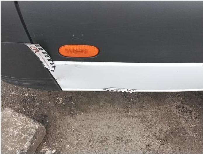
21: Qtr Panel osr Dented Over 30mm