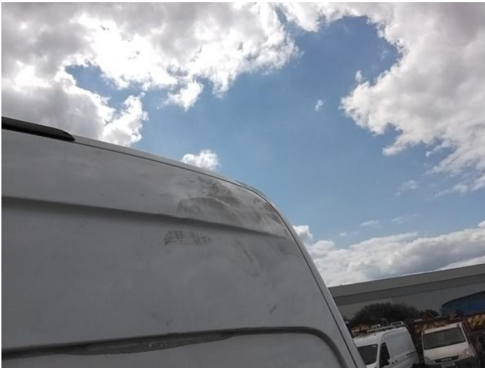
17: Door osr Dented Over 30mm