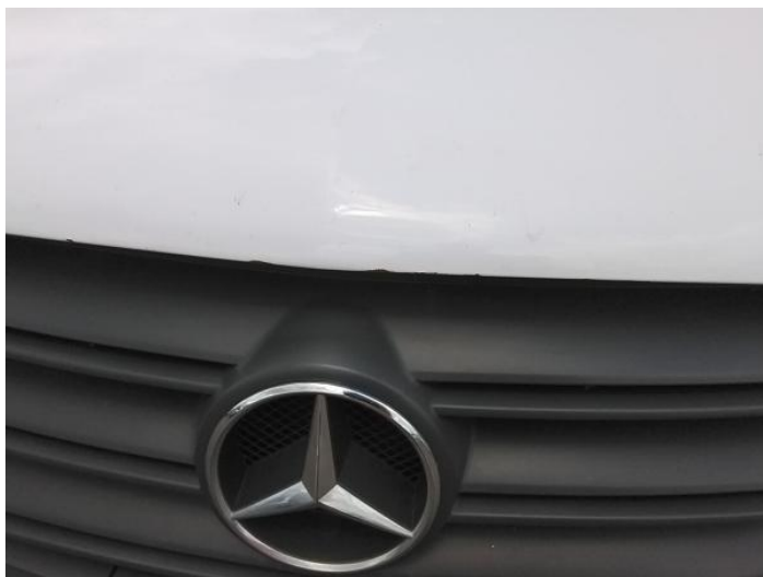
1: Bonnet Rusted Over 5mm