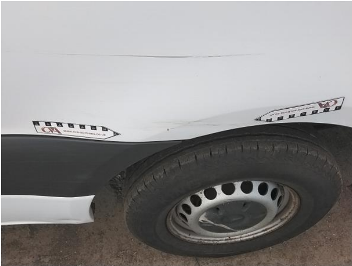
9: Qtr Panel nsr Dented Over 30mm