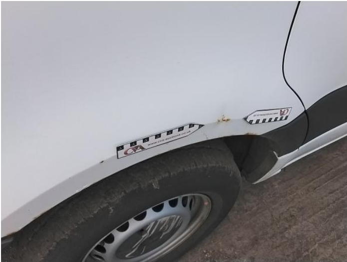
3: Wing nsf Dented Over 30mm