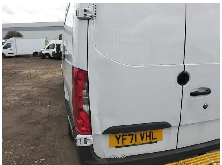
14: Door nsr Dented Over 30mm