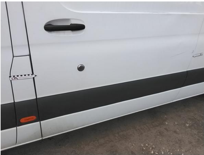
5: Qtr Panel nsr Scratched Over 25mm Not Thru Paint