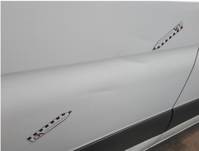
23: Qtr Panel osr Dented Over 30mm