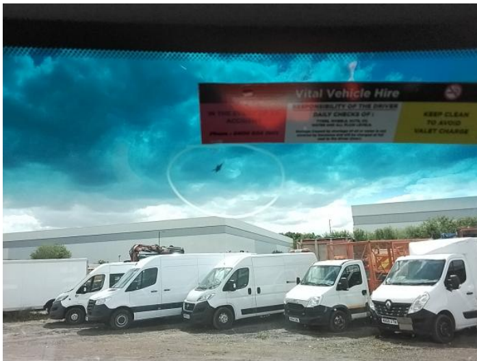
33: Screen Front Chipped Over 10mm