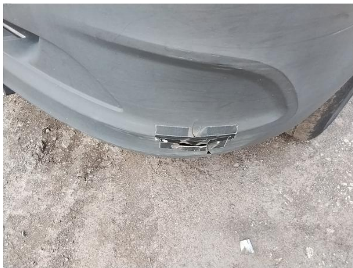
2: Bumper Front Cracked Over 25mm