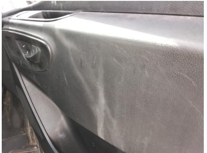
30: Door Pad osf Soiled Heavy