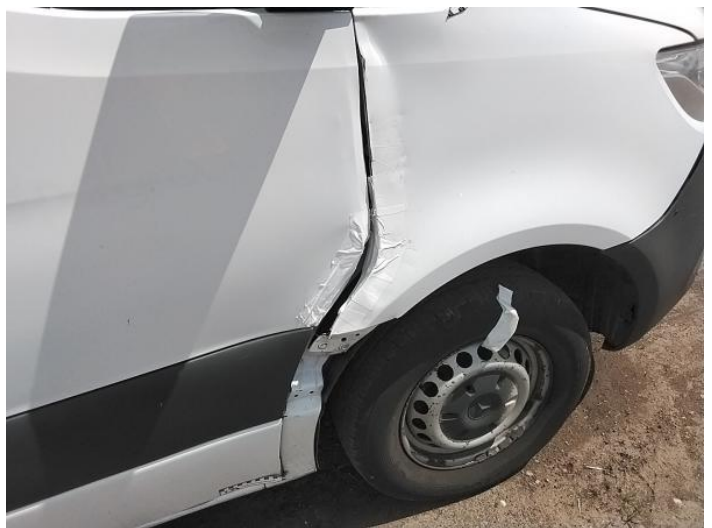
26: Wing osf Dented Over 30mm