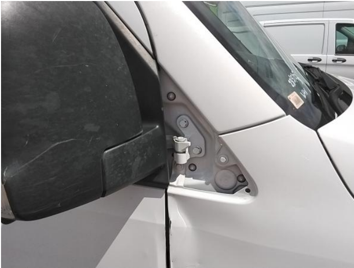
27: Door Moulding osf Missing Replace