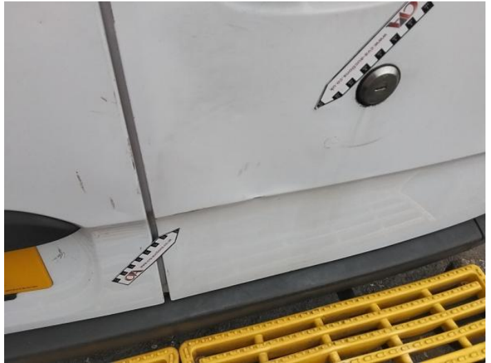
16: Door osr Dented Over 30mm