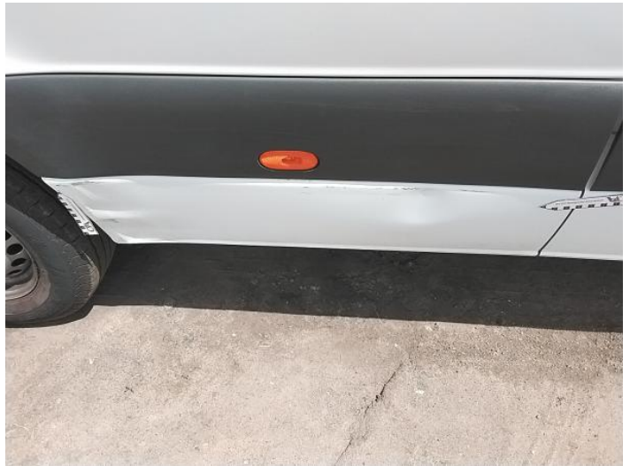
24: Qtr Panel osr Dented Over 30mm