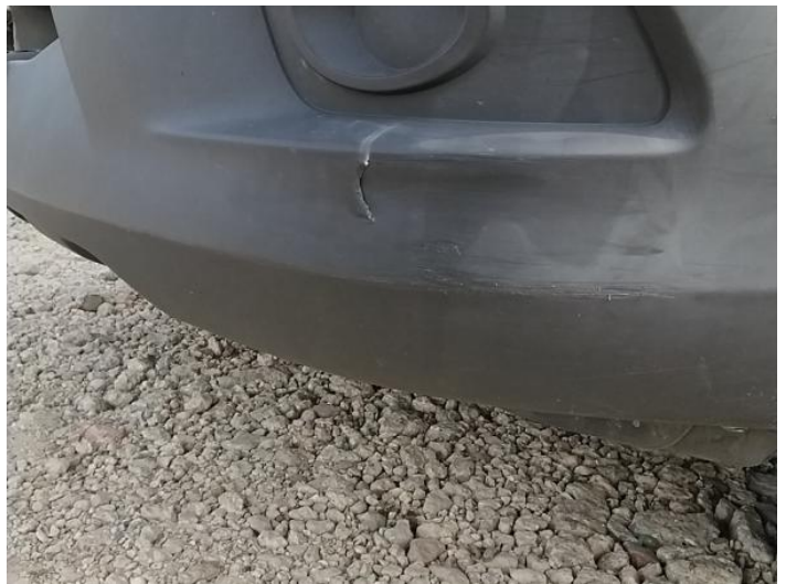
6: Bumper Front Hole Over 25mm