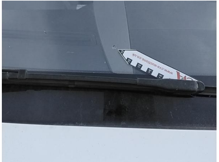
4: Screen Front Chipped Over 10mm