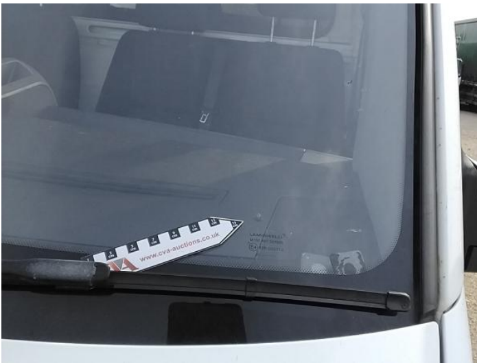
5: Screen Front Chipped Over 10mm