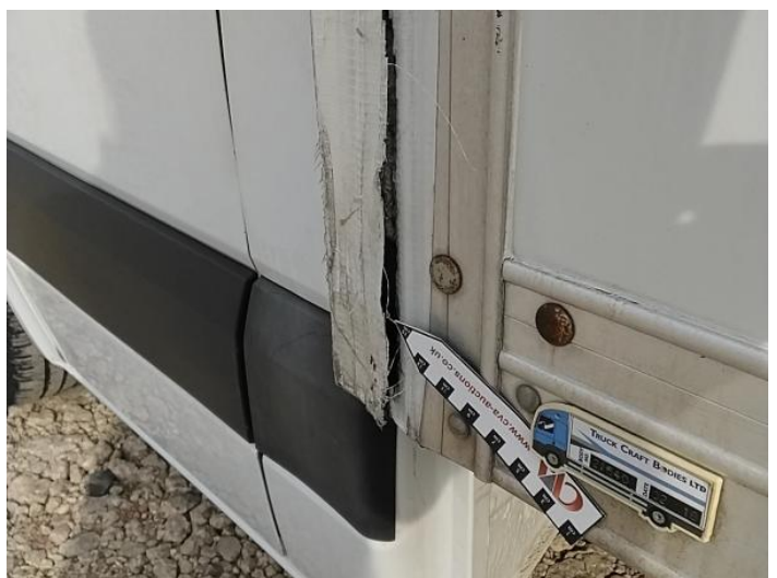
8: General Exterior Soiled Light