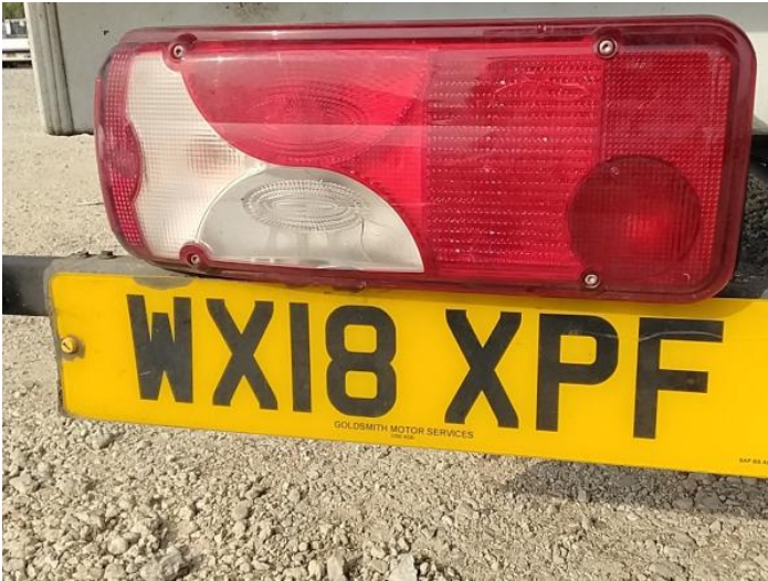
9: Lamp nsr Broken Replace