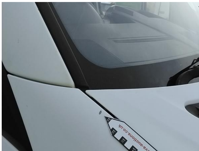
2: Wing osf Chipped Multiple Chips