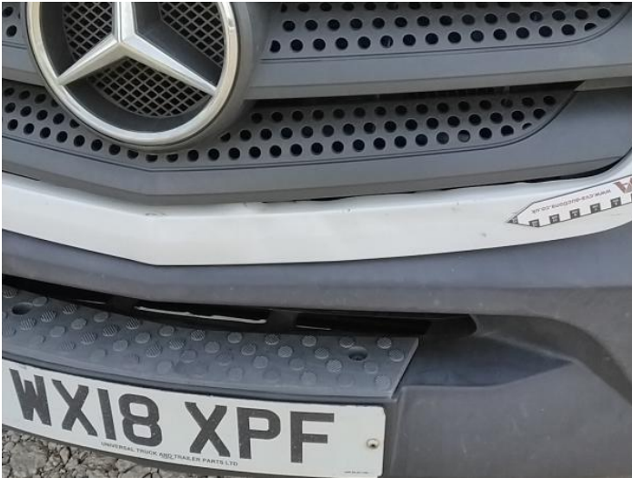
3: Panel Front Dented Over 30mm