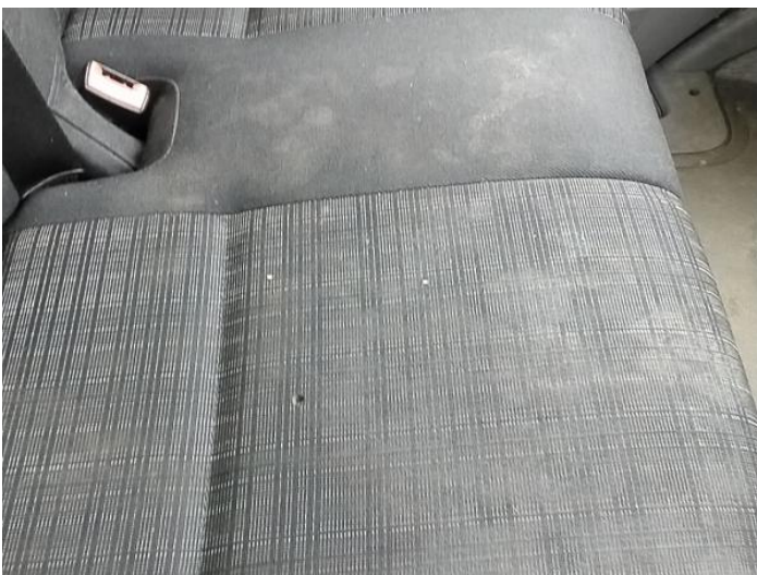
13: Seat Base Cover nsf Holed Over 3mm