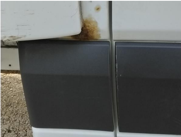
11: B Post os Rusted Over 5mm