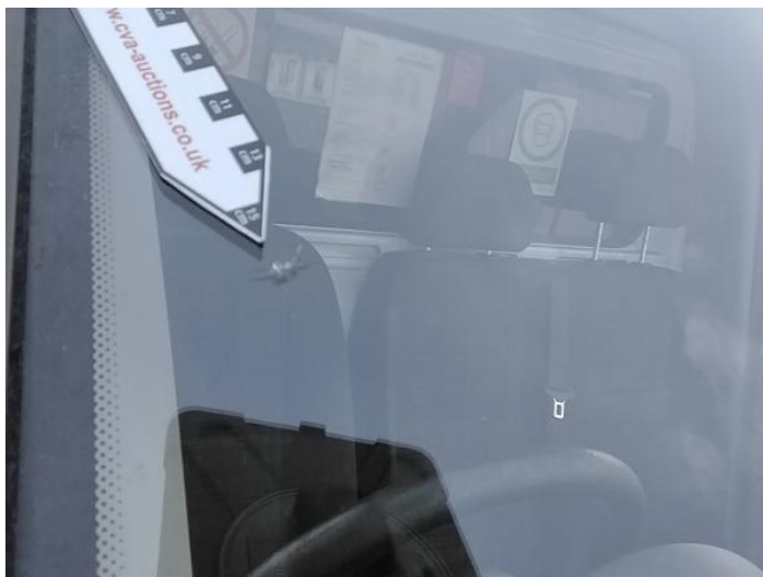
1: Screen Front Chipped Over 10mm