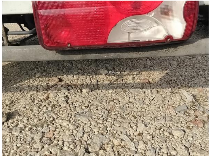
10: Lamp osr Broken Replace