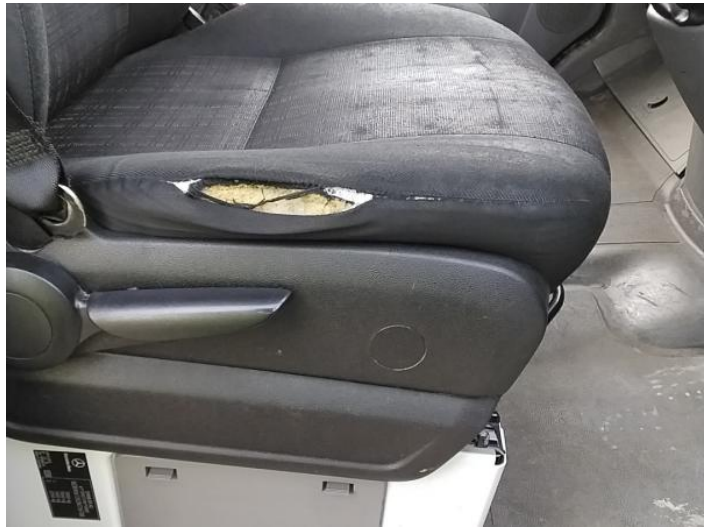
12: Seat Base Cover osf Holed Over 3mm