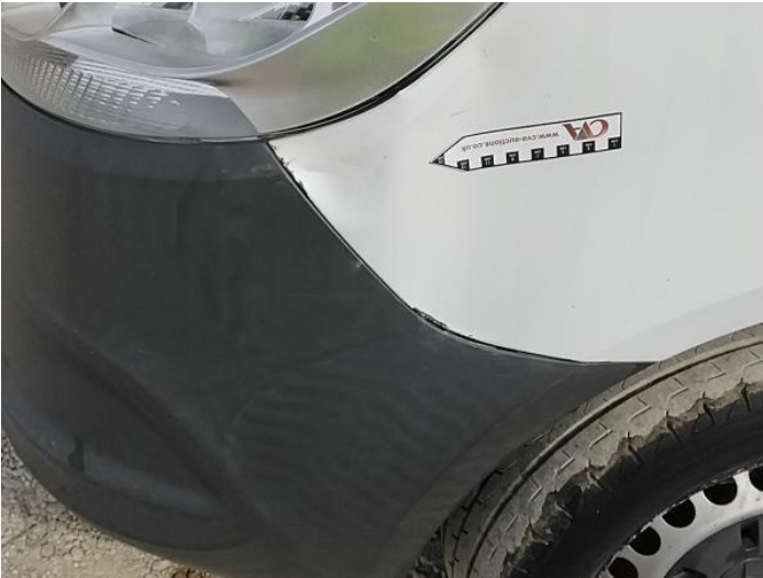
3: Wing nsf Dented With Paint Damage