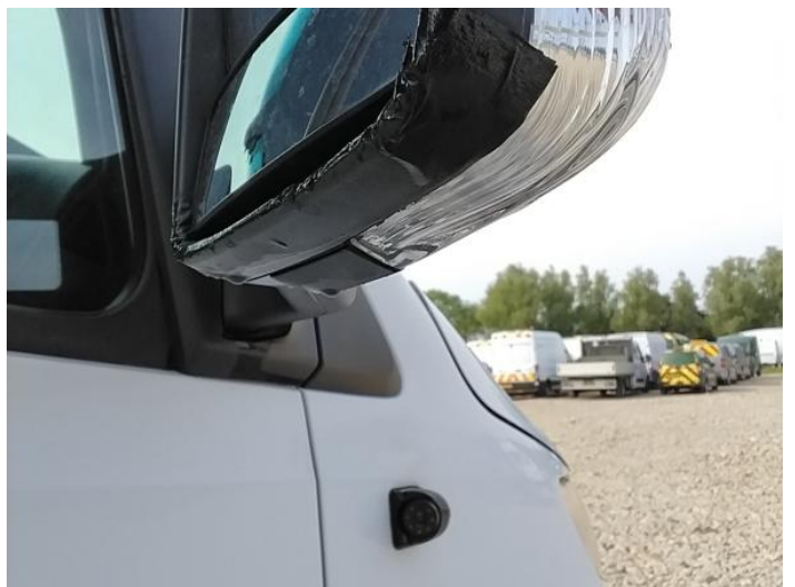
8: Door Mirror Assy osf Broken Replace