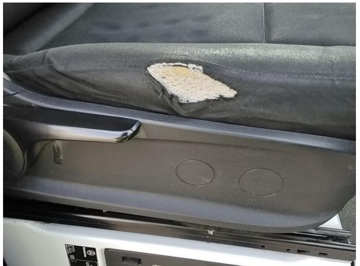
9: Carpets Front Holed Over 3mm