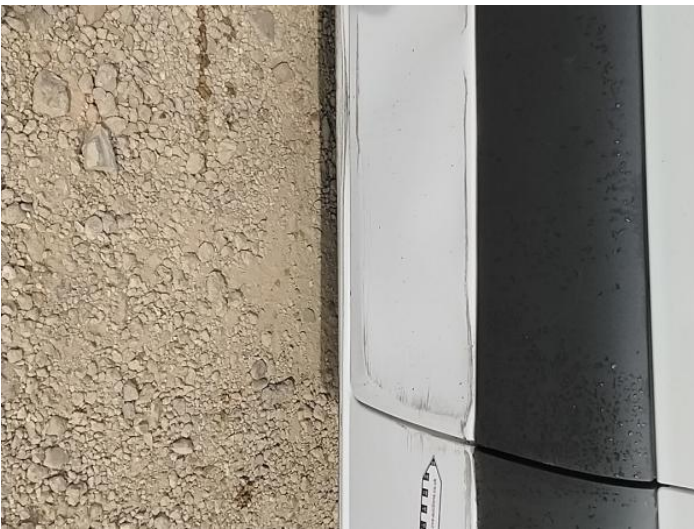
5: Door nsf Dented With Paint Damage