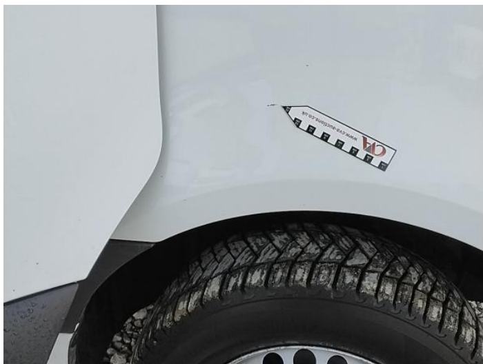
1: Wing of Scratched Up To 25mm Thru Paint