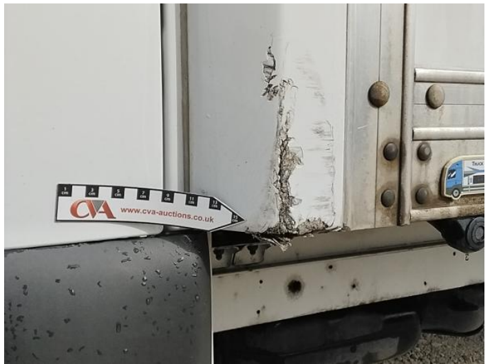
6: B Post ns Hole Over 10mm