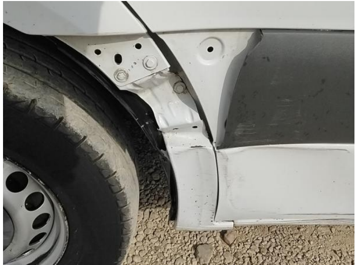
4: Door Moulding nsf Broken Replace