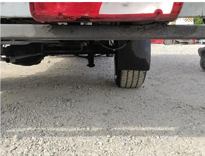
7: Lamp osr Broken Replace