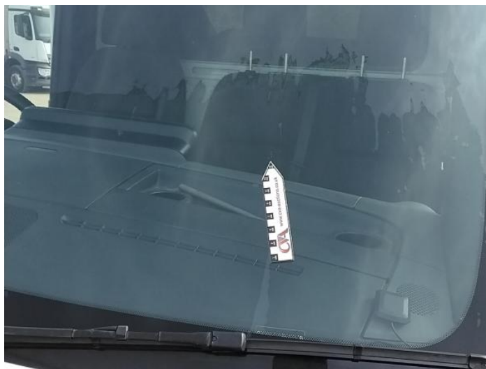
2: Screen Front Chipped Over 10mm