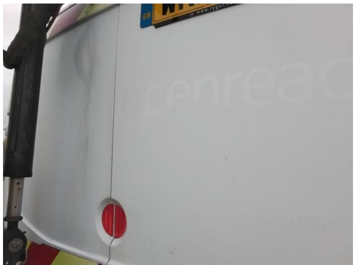
8: Door osr Chipped Multiple Chips