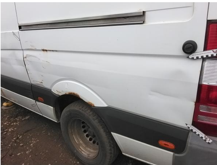
7: Qtr Panel nsr Dented Over 30% Of Panel