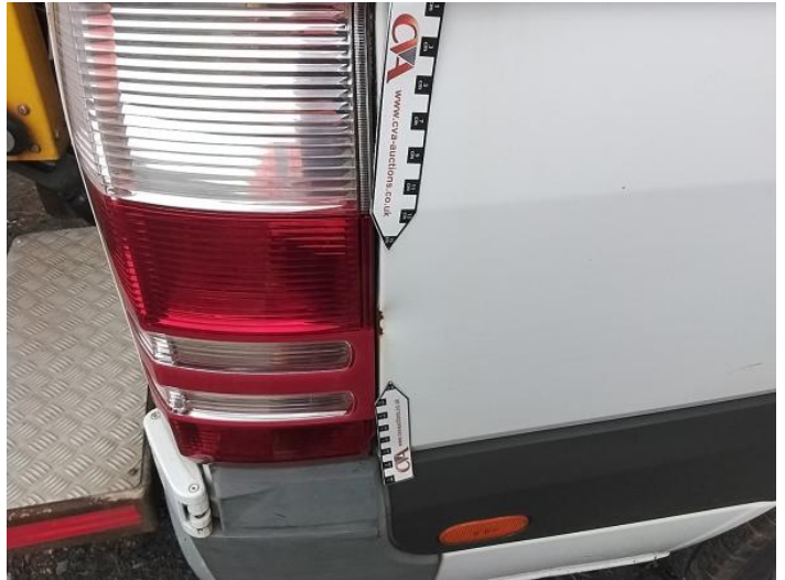
10: Qtr Panel osr Dented Over 30mm