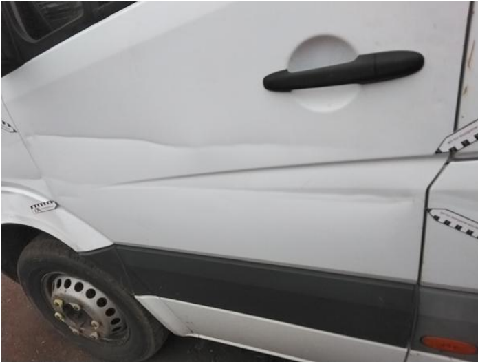
3: Door nsf Dented Over 30mm