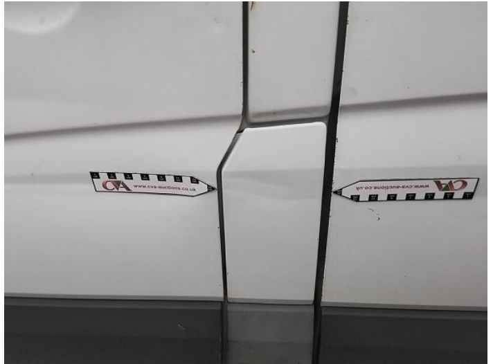
4: B Post ns Dented Over 30mm