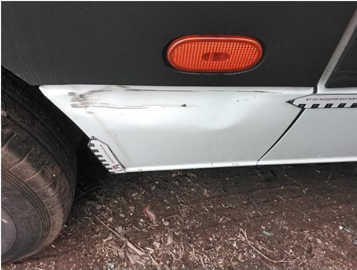
15: Qtr Panel osr Dented Over 30mm