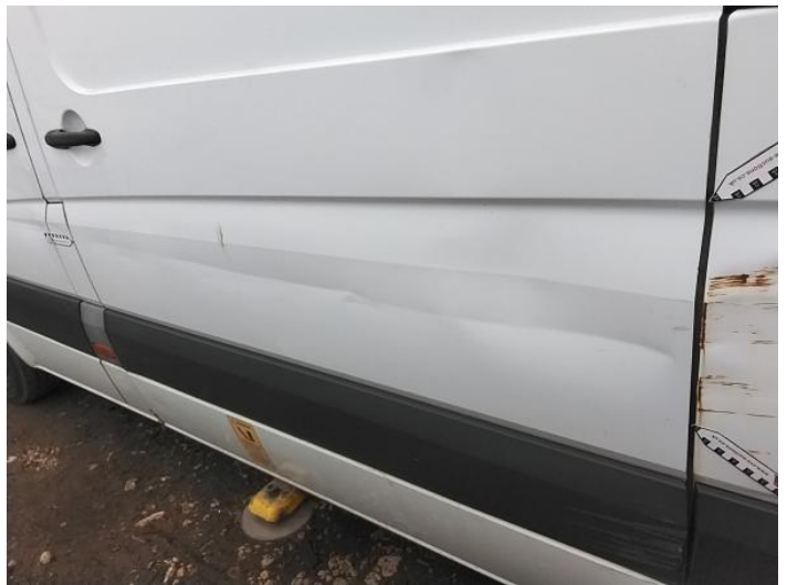
6: Qtr Panel nsr Dented Over 30mm