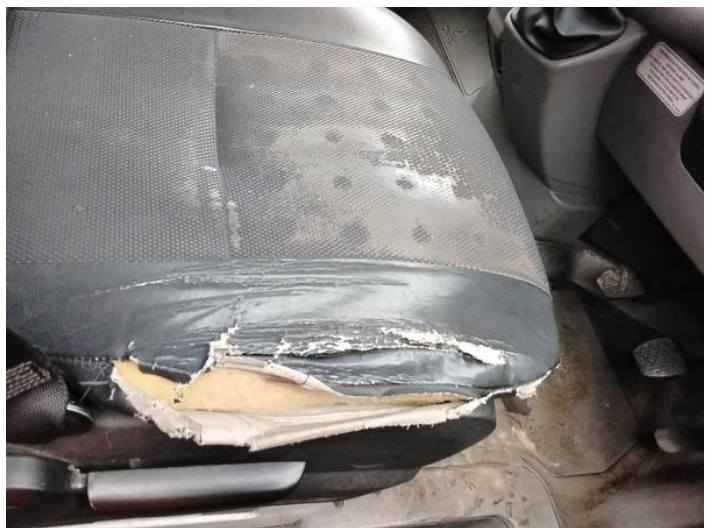
20: Seat Base Cover osf Torn Over 3mm