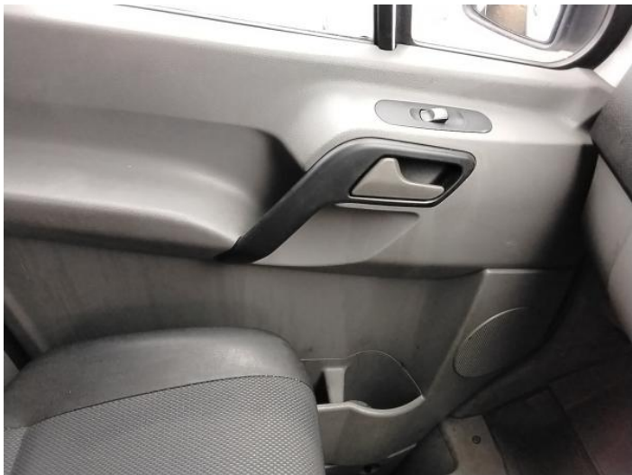
21: Door Pad nsf Soiled Heavy