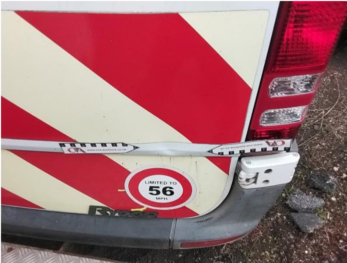
9: Door osr Dented Over 30mm