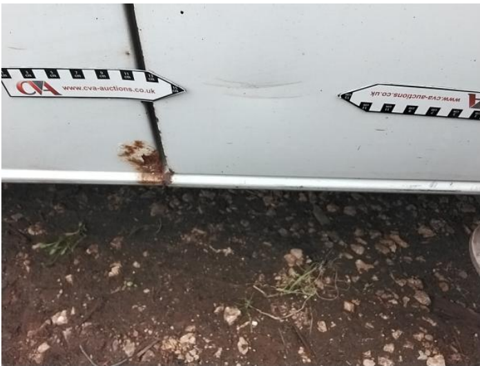
5: Qtr Panel nsr Dented Over 30mm