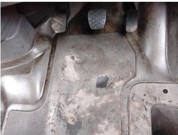
19: Carpets Front Torn Over 10mm