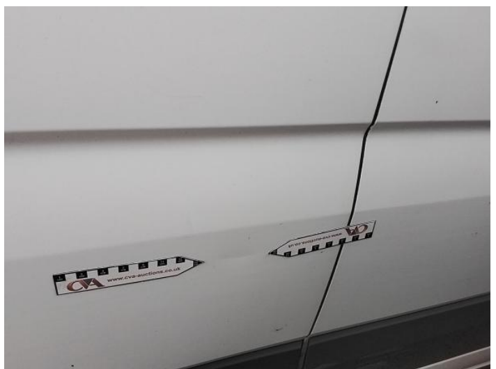
14: Qtr Panel osr Dented Over 30mm