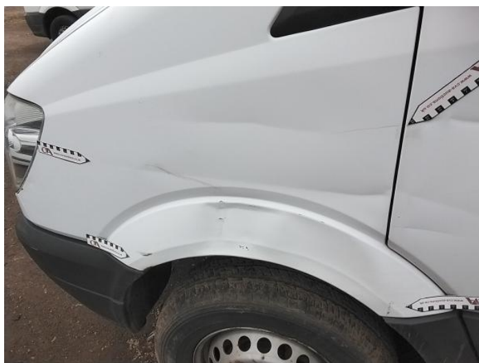
2: Wing nsf Dented Over 30% Of Panel