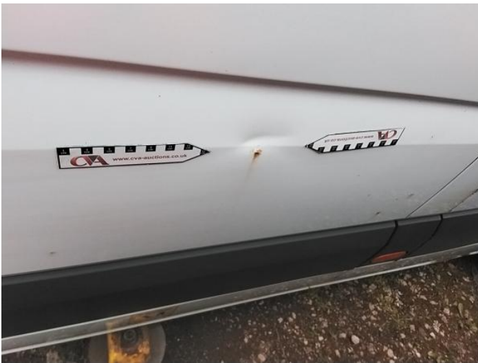
17: Qtr Panel osr Dented Over 30mm