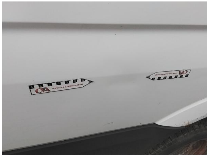
12: Qtr Panel osr Dented Over 30mm