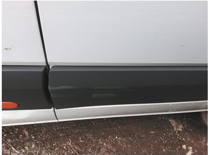
16: Qtr Panel Moulding os Scuffed (Unpainted) Over 100mm