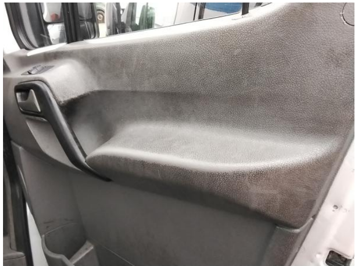
18: Door Pad osf Soiled Heavy