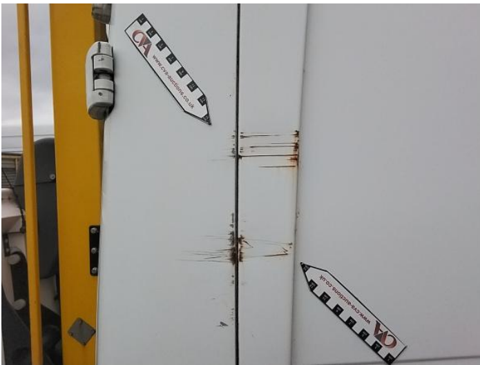
11: Qtr Panel osr Dented Over 30mm