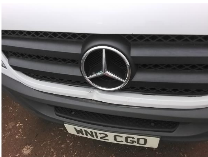
1: Bonnet Dented Over 30mm