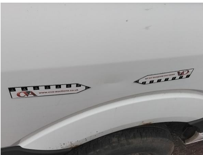
13: Qtr Panel osr Dented Over 30mm