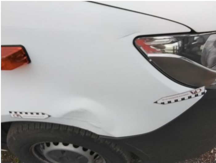
12: Wing osf Dented Over 30% Of Panel