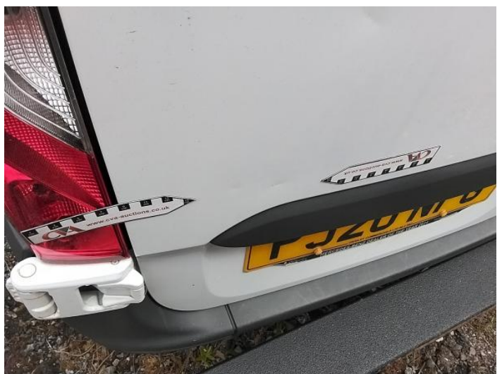
8: Door nsr Dented Over 30mm