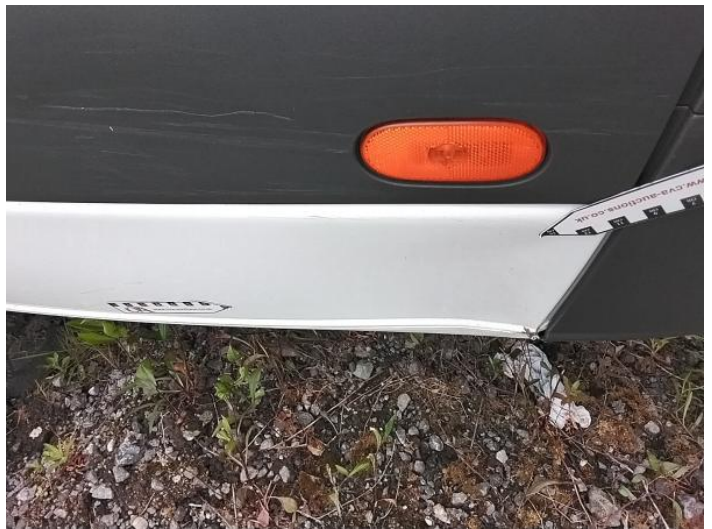
6: Qtr Panel nsr Dented Over 30mm