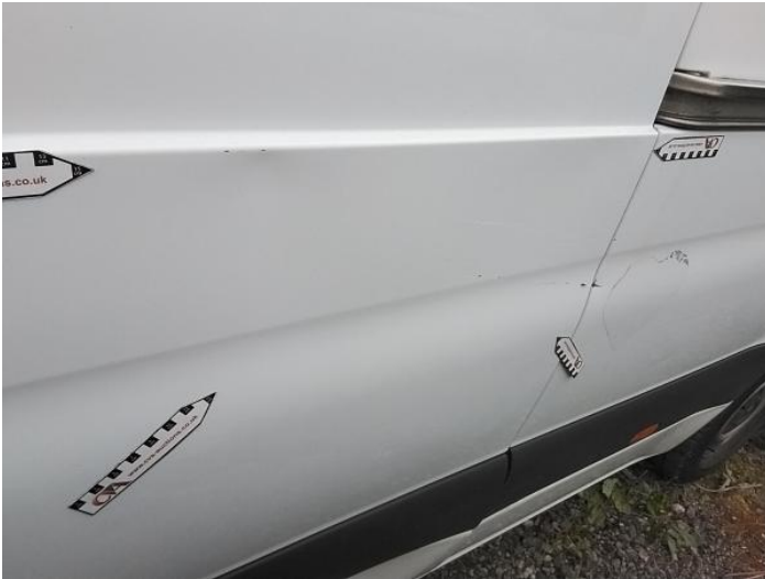
3: Qtr Panel nsr Dented Over 30mm