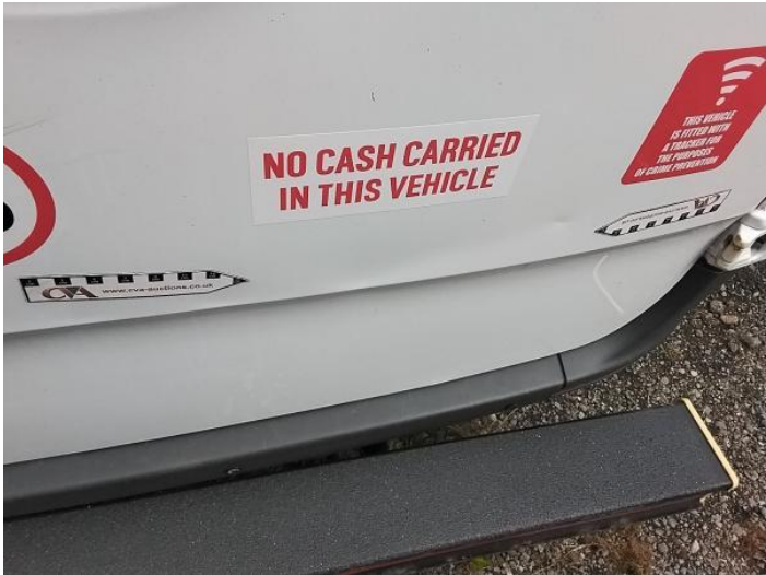
10: Door osr Dented Over 30mm