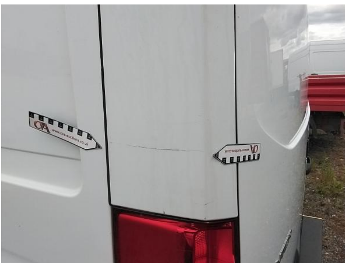
7: C Post ns Scratched Over 25mm Not Thru Paint