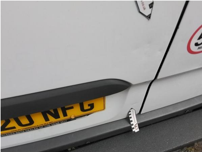
9: Door nsr Dented Over 30mm