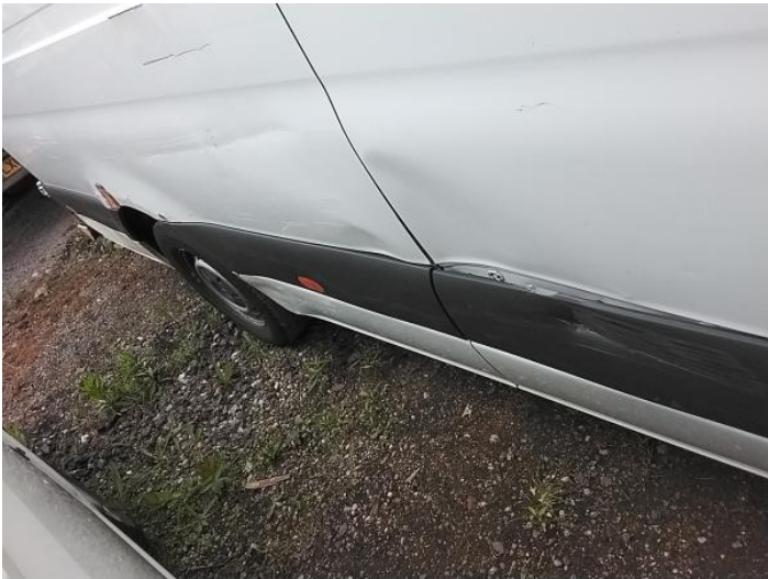
11: Unclassified Substantial Accident Damage Report Only