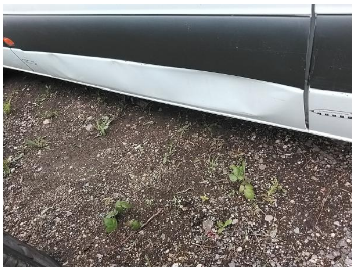
2: Qtr Panel nsr Dented Over 30mm