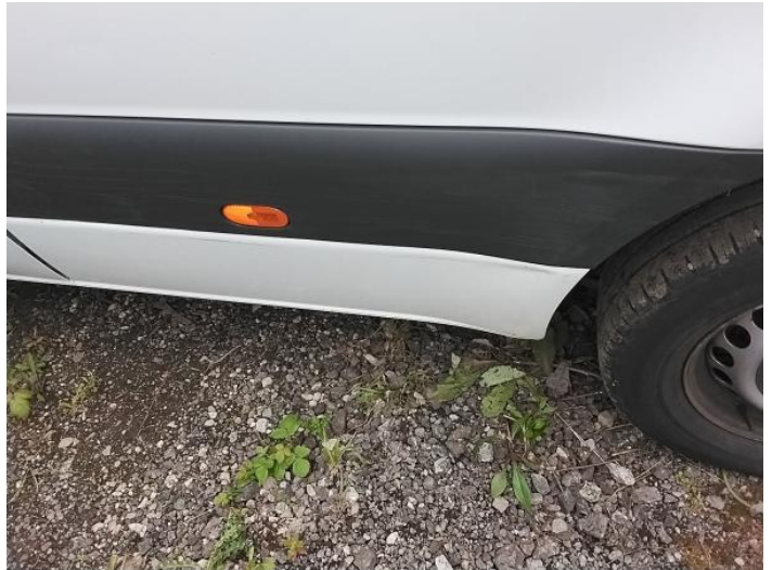
4: Qtr Panel Moulding ns Scuffed (Unpainted) Over 100mm