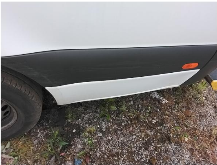
5: Qtr Panel Moulding ns Scuffed (Unpainted) Over 100mm