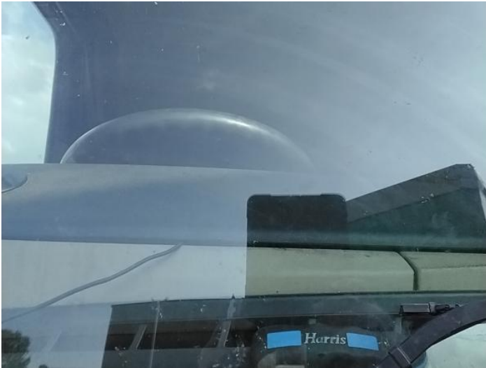
3: Screen Front Chipped Over 10mm