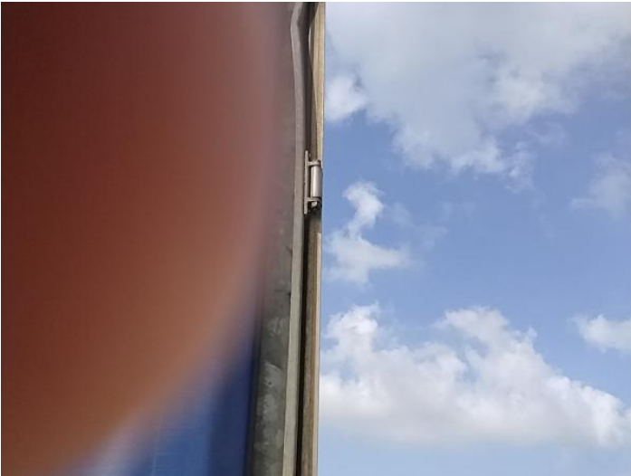
10: General Exterior Soiled Light