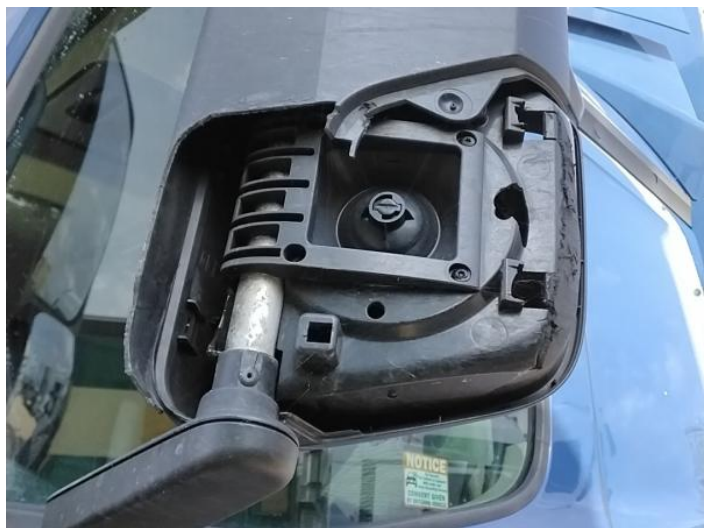
8: Door Mirror Assy nsf Broken Replace