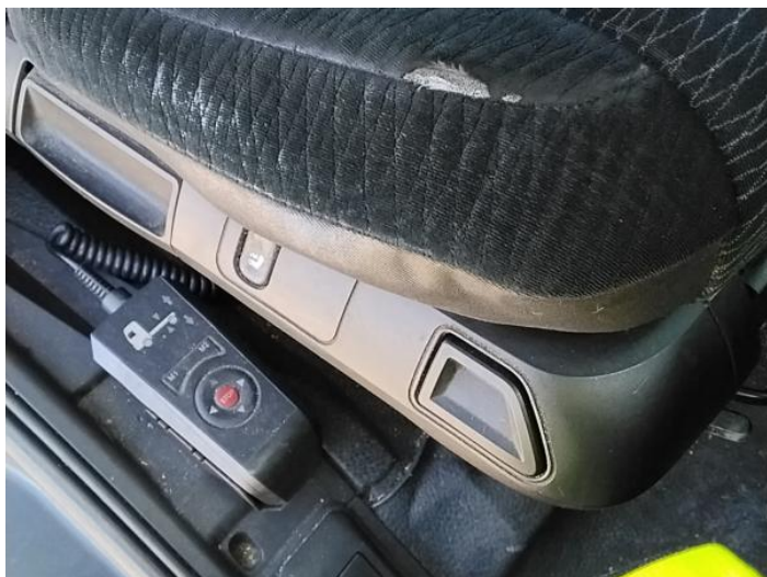
15: Seat Base Cover osf Torn Over 3mm