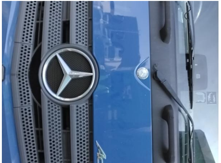
6: Bonnet Chipped Multiple Chips