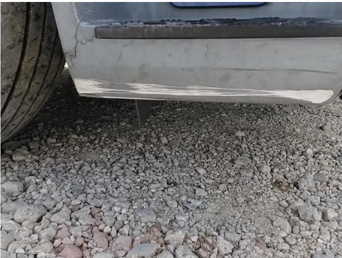
14: General Exterior Soiled Light