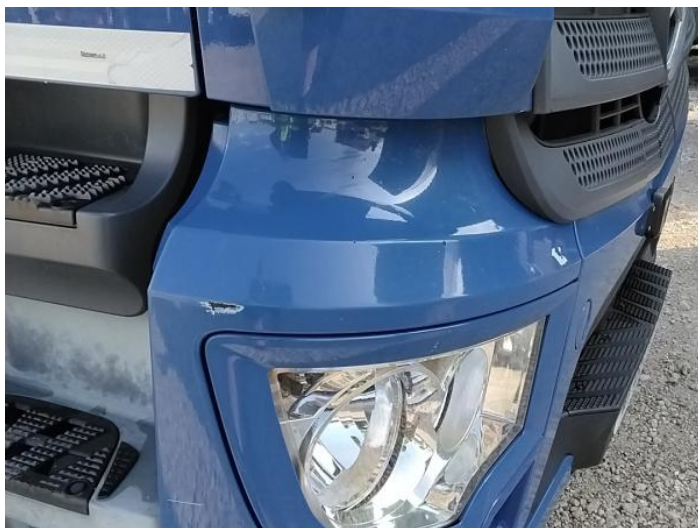
1: Moulding on Wing Scratched (Painted) Over 25mm Thru Paint