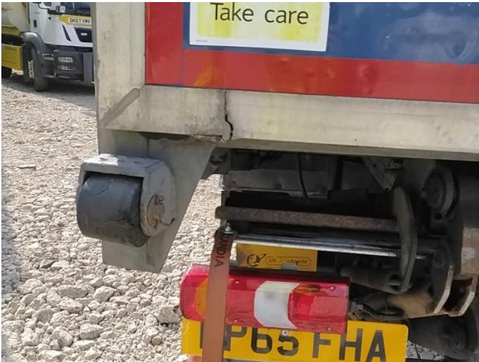
11: Door nsr Cracked Replace