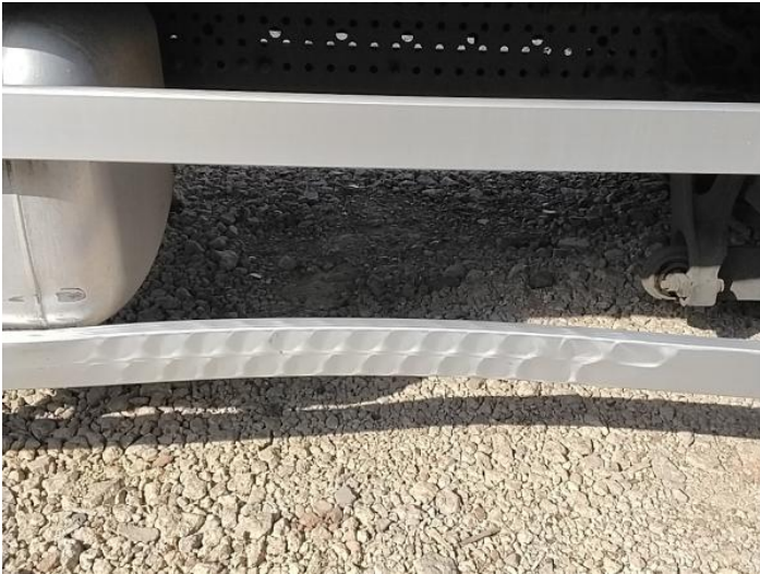
9: General Exterior Soiled Light