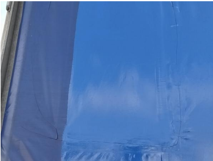
13: General Exterior Soiled Light