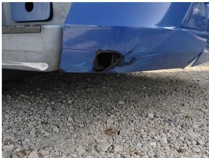
2: Bumper Front Hole Over 25mm