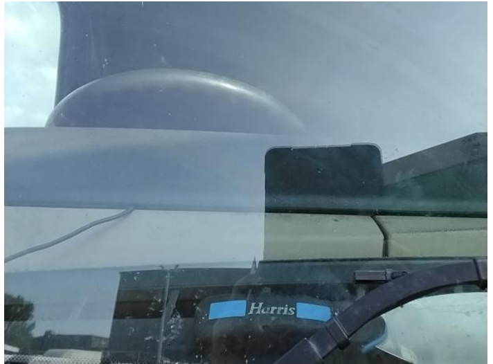
4: Screen Front Chipped Over 10mm