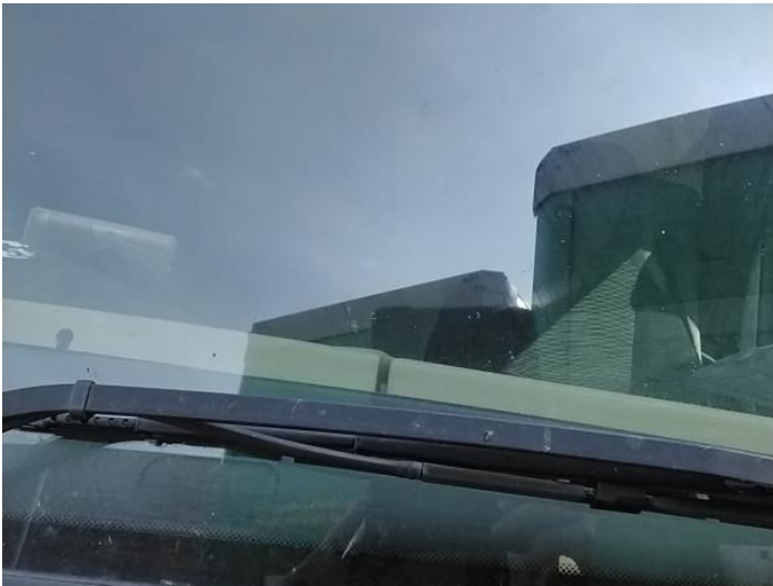
5: Screen Front Chipped Over 10mm