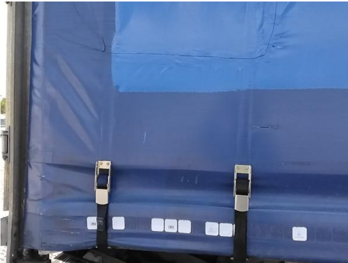
12: General Exterior Soiled Light