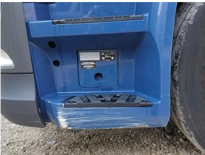
7: General Exterior Soiled Light