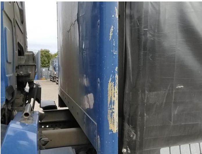
5: C Post ns Scratched Over 25mm Thru Paint