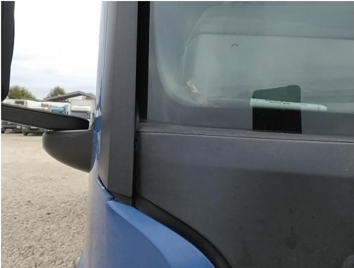
3: Screen Front Chipped Over 10mm