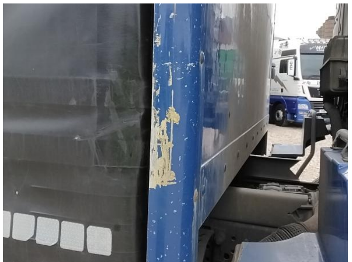
8: C Post os Scratched Over 25mm Thru Paint