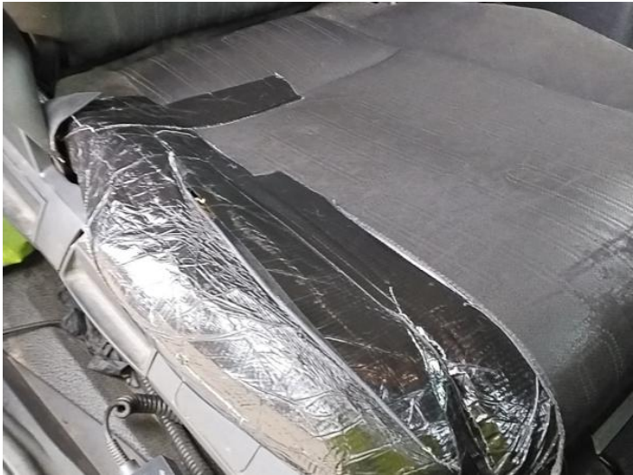
10: Seat Base Cover osf Torn Over 3mm