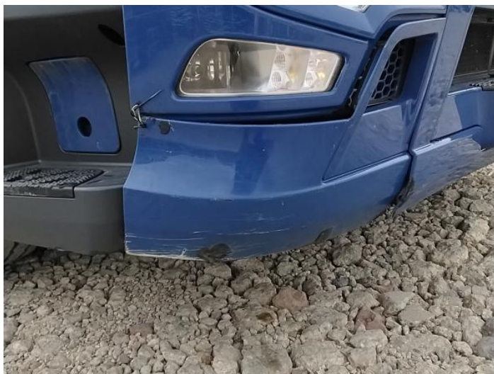
1: Bumper Front Cracked Over 25mm