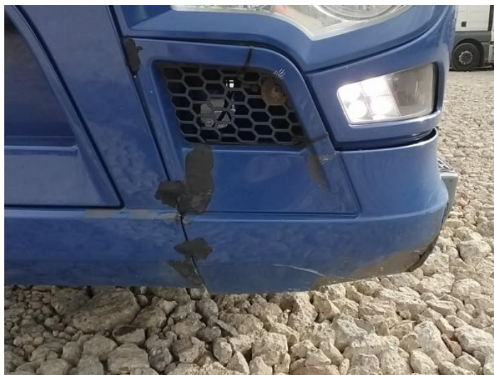
2: Bumper Front Cracked Over 25mm