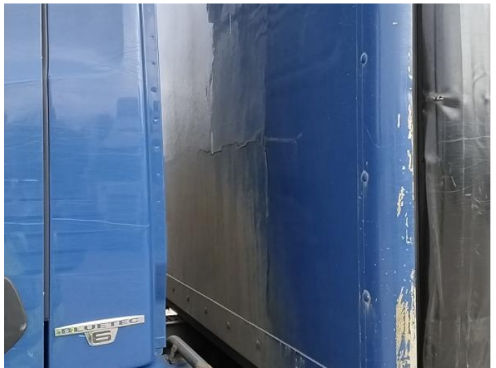
6: General Exterior Soiled Light