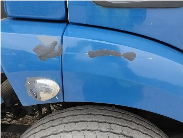
9: Wing osf Poor Previous Repair Poor Colour