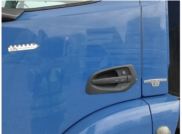
4: Door nsf Scratched Over 25mm Thru Paint