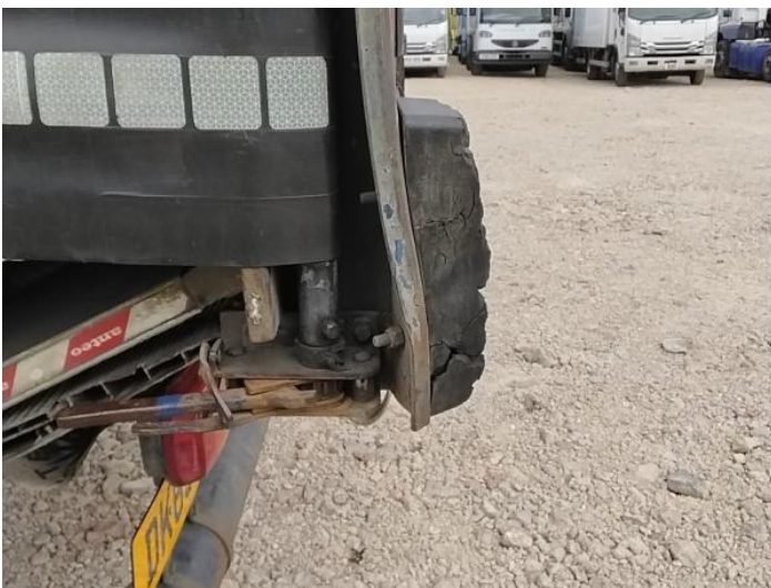
7: Door nsr Rusted Over 5mm