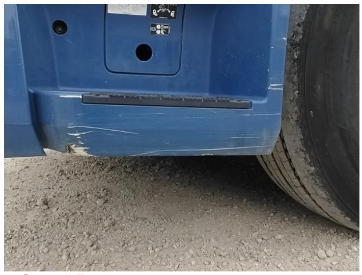
3: General Exterior Soiled Light