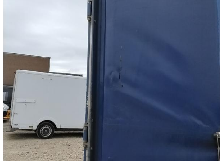
5: General Exterior Soiled Light