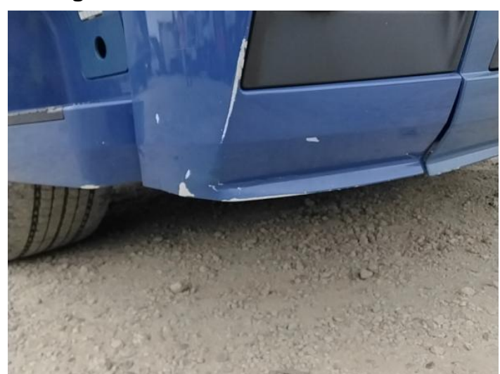
1: Bumper Front Scratched Over 100mm Thru Paint