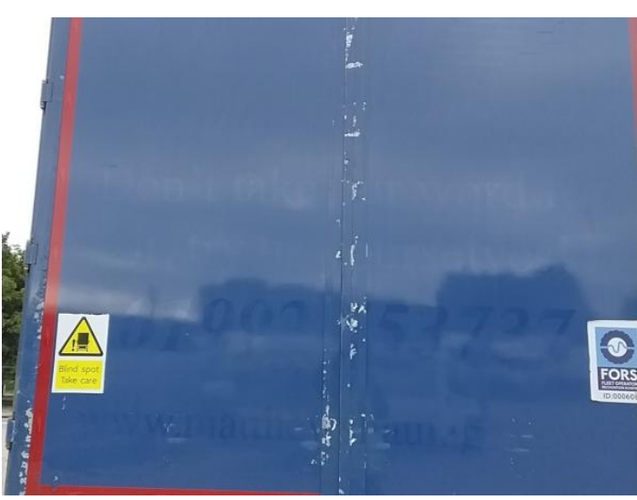
4: General Exterior Soiled Light